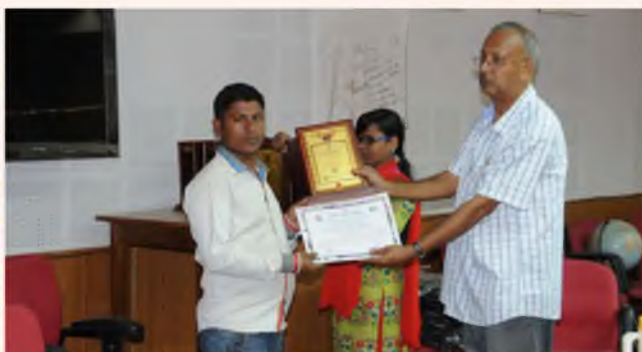
Trainee of Green Skill Development Programme receiving certificate at CRC, Allahabad on 11.09.2017