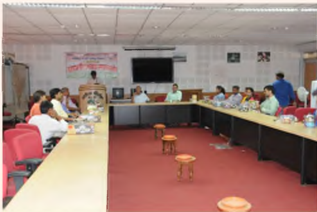
Closing ceremony of Hindi pakhwada organized by CRC, BSI, Allahabad from 1st to 14th September 2017