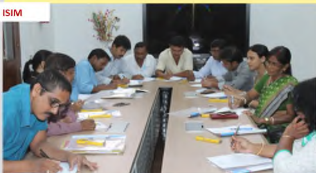
Officials of ISIM participating in competition during celebration of Hindi Diwas 2017