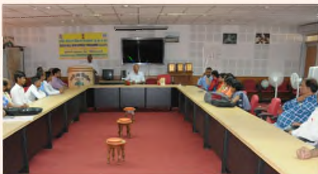
Valedictory function of Green Skill Development Programme at CRC, Allahabad on 11.09.2017