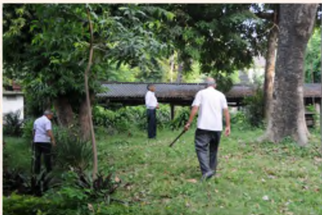
Swachh Bharat–campus cleaning drive at CRC, BSI, Allahabad on 29.09.2017