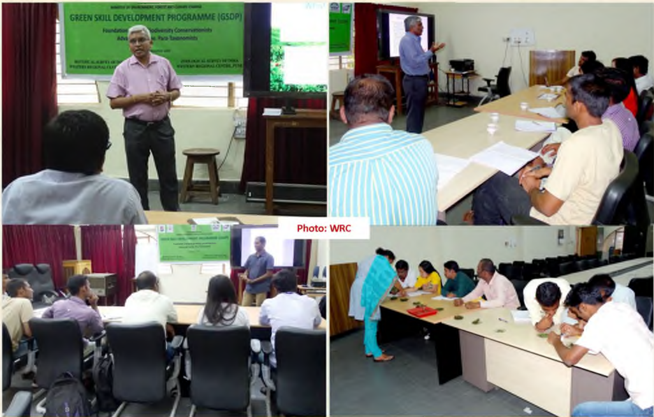
Green Skill Development Programme training classes at WRC, BSI, Pune