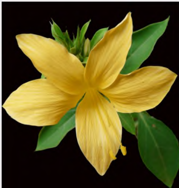
Barleria prionitis L. (ACANTHACEAE), commonly known as porcupine flower, native to temperate-tropical Asia and Africa, grown as an ornamental and medicinal plant, often also cultivated as hedge plant as it reaches up to 1.5 m height. In Sanskrit it is known as Vajradanti, means it makes teeth as hard as diamond and most commonly used in Ayurveda for dental care.