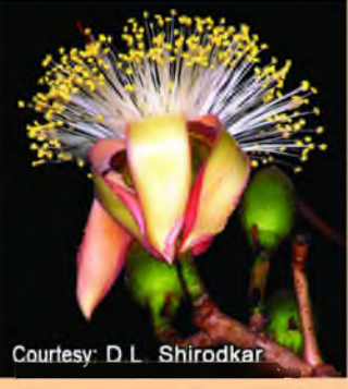
Bombax insigne Wall.