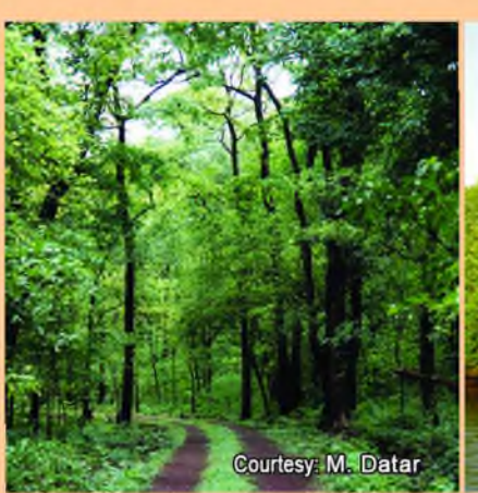
Moist Deciduous Forest near Molem N.P.

Moist deciduous to Semi-evergreen Forest at Pargad, Goa