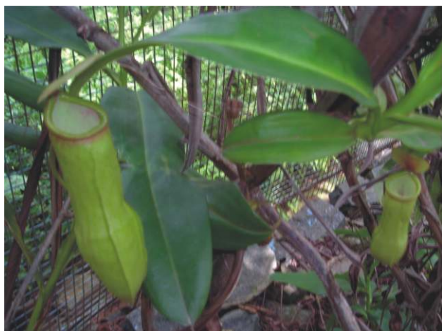
Fig. 2 : Nepenthes khasiana Hook.f. growing in the National Orchidarium & Experimental Garden of Botanical Survey of India, Yercaud, Salem District, Tamil Nadu

The species of Nepenthes (Nepenthaceae) are pitcher forming insectivorous plants and are popularly known as 'Pitcher Plants'. It includes about 70 species distributed from Southern China to North-Eastern Australia and New Caledonia and extending westwards to Seychelles and Malagasy. Pitcher plants thrive well in moist atmosphere, where temperature ranges from 21° – 30° C. They are propagated by cuttings, layers and seeds. The stems of the pitcher plants are very tough and are used for rough cordage.