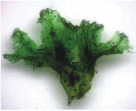
Fig. 7 : Blasia pusilla L.

studies on the Hepaticae of the protected areas of Himachal Pradesh between 2001 – 2003, the author collected it from Sainj valley of Great Himalayan National Park and Rohtang pass in Kullu district of Himachal Pradesh (Singh & Singh, 2009). Long (2006) recorded it from the State of Sikkim (Fig. 7).