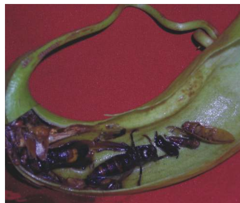
Fig. 3 : Vertical section of the pitcher showing trapped insects

Nepenthes plants are dioecious. Flowers appear in panicles or simple racemes on the tip of the young branches. Each raceme is opposite to a bract leaf which usually differs in shape and venation from the other foliage leaves. Each staminate flower consists of four green, yellowish, red or claret perianth c. 6 mm in