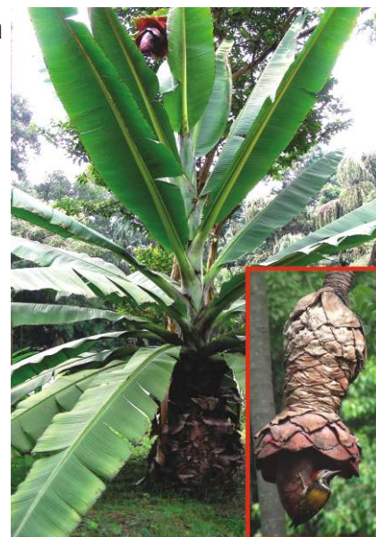
Fig. 4 : Ensete superbum (Roxb.) Cheesman; Inset: Inflorescence

Thus by the end of April 2004, E. superbum was introduced in AJCBIBG for the second time after a lapse of over two centuries. It was planted in Nursery No.1 of AJCBIBG at an elevated place, adjacent to a pond.