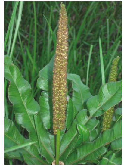
Fig. 10 : Helminthostachys zeylanica (L.) Hook.