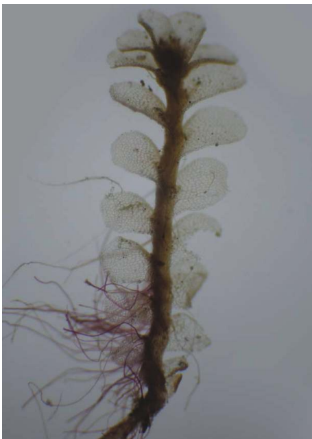
Fig. 5 : Jungermannia subrubra Steph.

During bryological exploration in and around Great Himalayan National Park, Kullu, Himachal Pradesh, India, Singh & Singh (2009) documented 104 taxa of liverworts and hornworts. Of these, five little known species have been discussed in the present article.