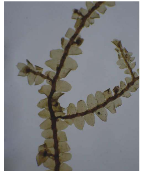
Fig. 6 : Porella variabilis (Kashyap) Parihar

Porella variabilis (Kashyap) Parihar (Porellaceae): This species was originally described by Kashyap (1932), as Madotheca variabilis from Mussoorie, Uttarakhand. Apparently the species could not be collected afterwards, either from its original locality in Uttarakhand or elsewhere in Western Himalaya. Recently, Singh & Singh (2009) recorded it from Great Himalayan National Park after a gap of about seven decades (Fig. 6).