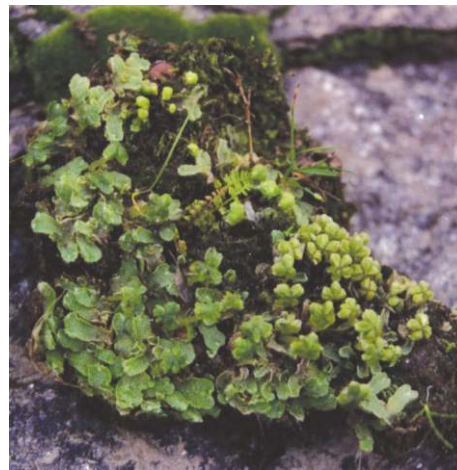
Fig. 9 : Sauteria spongiosa (Kashyap) S. Hatt.

originally described by Kashyap (1916) as Sauchia spongiosa from Sauch Pass located in between Chamba-Pangi road, Himachal Pradesh. Subsequently, Kashyap (1929) recorded the species from various localities in Himachal Pradesh (above Alwas on Pangi Road, Rohtang Pass, Chandra valley, Manh Pass). Later it was reported from Nepal (Grolle, 1966; Hattori, 1975), Pakistan (Furuki et al. , 1993) and from Tibet (Wu & Wang, 2000). More recently Long (2006) reported it from Yunnan. The author collected this species from Rohtang pass and Jalori pass in Kullu district of Himachal Pradesh and Mussoorie in Uttarakhand after a gap of more than