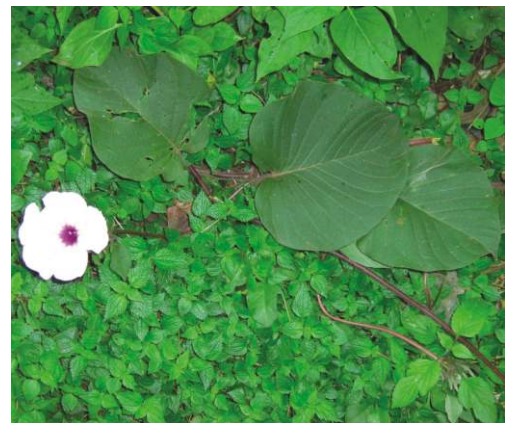
Fig. 1 : Argyreia coonoorensis W.W. Sm. & Ramaswami

Large scandent climbers. Leaves broadly ovate, 15–20 x 12–15 cm, sparsely pilose above, strigose beneath, cordate at base, acute to acuminate at apex, 10–12-nerved; petioles 4–5.5 cm long. Cymes few flowered; bracts linear, up to 2 cm long, strigose; peduncles up to 26 cm long. Calyx 5-lobed; lobes c. 1.5 cm long, pubescent. Corolla pink, c. 7 cm long, campanulate, sparsely hirsute; pedicel shorter than peduncle. Stamens 5, included; anthers oblong. Ovary subsessile; style straight; stigma globose.