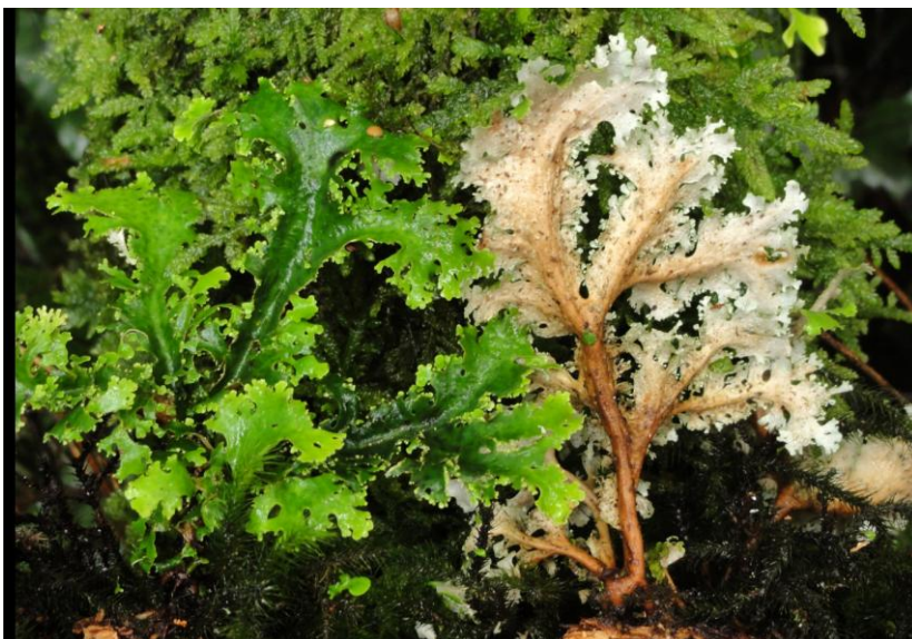
Sticta filix , Mohua Park, showing the green finely divided upper surface and the pale lower surface with distinctive stalk

The list of 70 species is not particularly representative, as Lars and I were more interested in looking for curiosities and may well have bypassed many obvious, common lichens in favour of less well known microscopic crusts. Our most curious finds, all growing on bark in the forest, included a species of Mycoblastus that glows bright white under UV light, an unidentified pale green warty crust with orange apothecia that is possibly a Coenogonium and an entirely new isidiate species of Coenogonium that Lars first discovered on Swampy Summit. Thank you, Fergus, for giving us a glimpse of a forest full of so many interesting and seldom seen lichens.