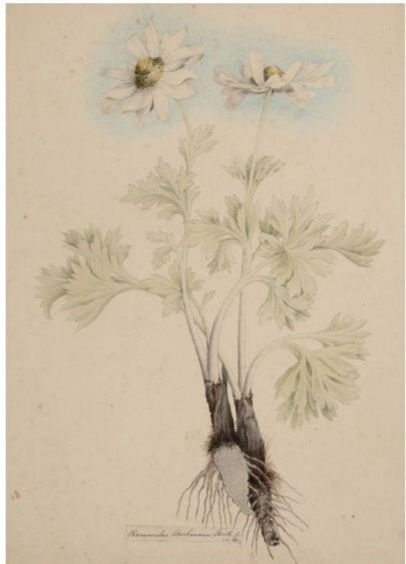
John Buchanan, Ranunculus buchanani 1865, pencil and watercolour on paper, 277 x 202mm.

Landscapes, painted in watercolour, while employed by the Otago Provincial Geological Survey record the bones of the South Island. The exhibit included Lake Wanaka looking south towards the flats, the Otago harbour looking north and an iconic view of Milford Sound. In these watercolours, Buchanan is depicting landforms ; there isn't a bucolic dream in the lot. He is drawing the structure of the land that he is viewing; the mountains, the islands, the hills and the rivers; with very little foreground to distract the viewer. A characteristic in these landscapes shared by Buchanan's more lyric floral paintings is a strong focus on the main feature and little ornament.