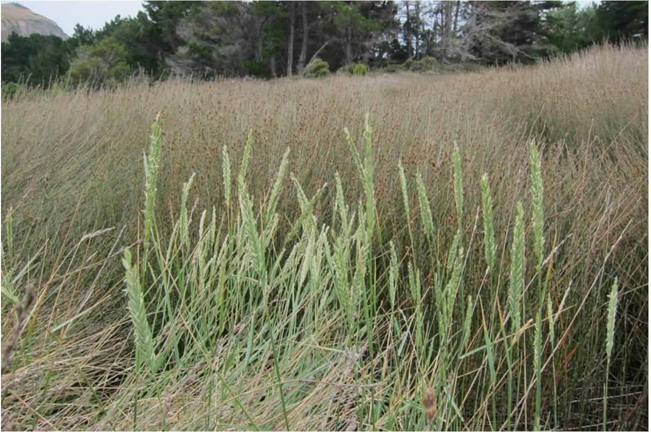
Elytrigia pycnantha , sea couch, Aramoana salt marsh