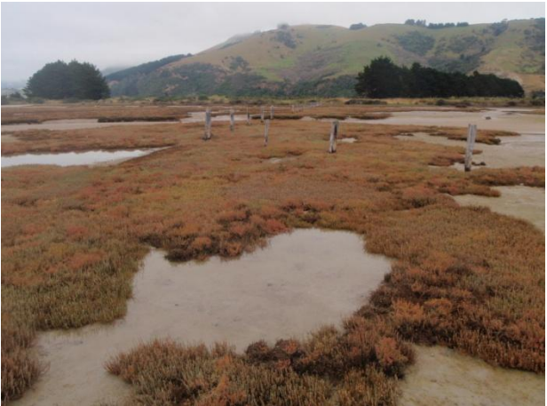
Aramoana salt marsh patterns