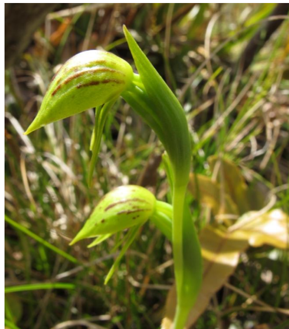
Waireia stenopetala

and numerous odd-leaved orchid ( Aporostylis bifolia ). A stop amongst the narrow-leaved tussock on the ridge crest leading to Silver Peak revealed a few plants of southern greenhood ( Pterostylis australis ).