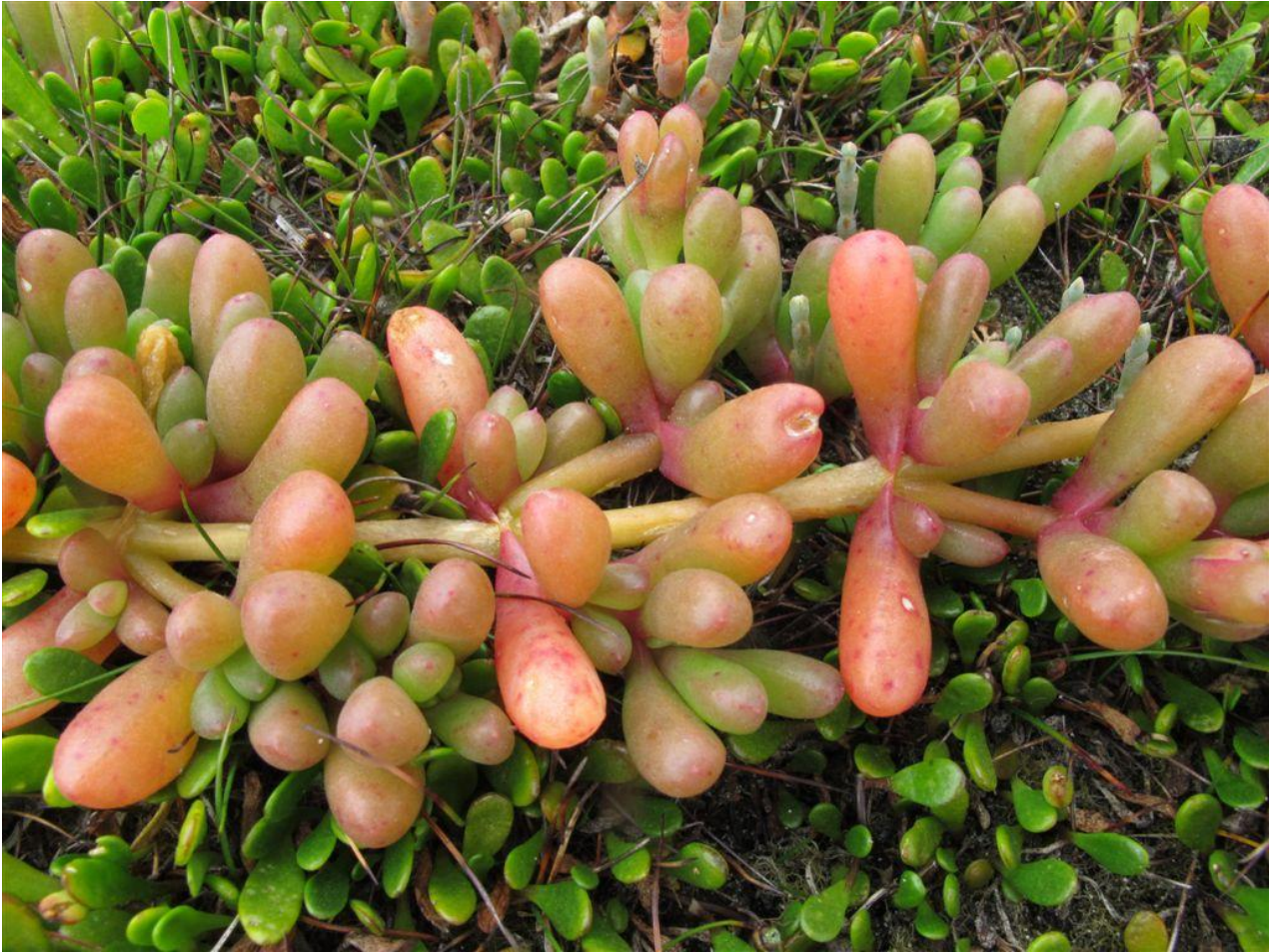
Disphyma clavellatum , jelly beans