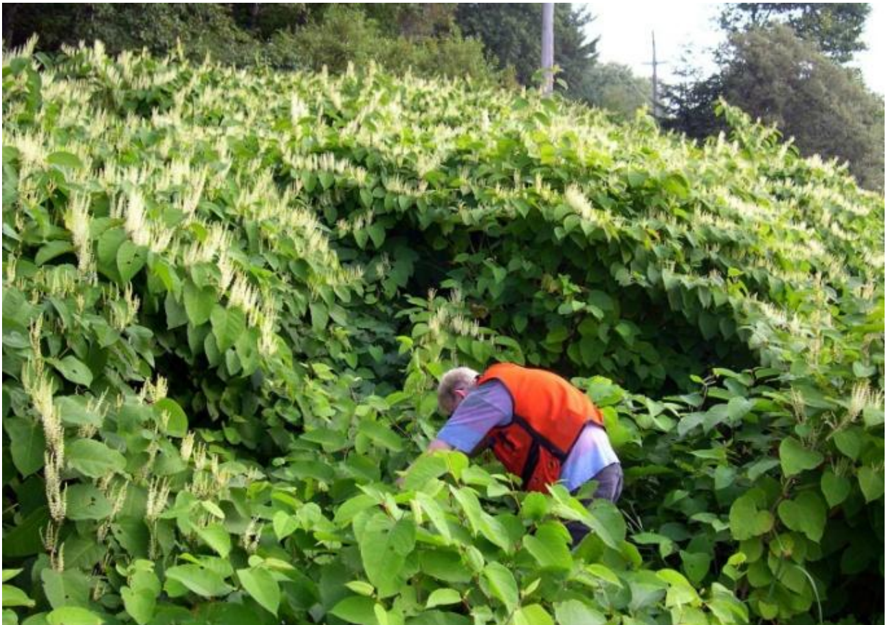
Japanese Knotweed in the UK

tablets such as the iPad. Feature plants have been added to the home page and a navigation bar has been included to help users explore the site. It is nearly 10 years since the NZPCN's website was launched and in that time it has grown to become an invaluable resource for anyone studying, growing, restoring and learning about native and exotic plants in New Zealand. Close to half a million visits are made to the website each year. The website now has 7,600 species pages, more than 23,000 photographs and over 1.4 million plant observations (and growing!). The website now includes vascular plants, liverworts, macroalgae, mosses and fungi. The most recent additions are the charophytes thanks to work by NIWA, funded by the government's TFBIS (Terrestrial and Freshwater Biodiversity Information Systems) programme.