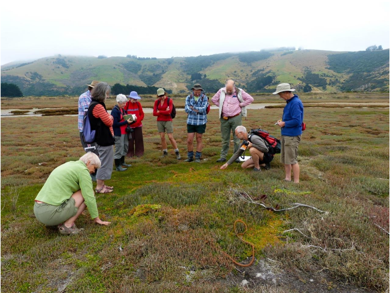
Botanists looking at the low growing plants of Aramoana salt marsh