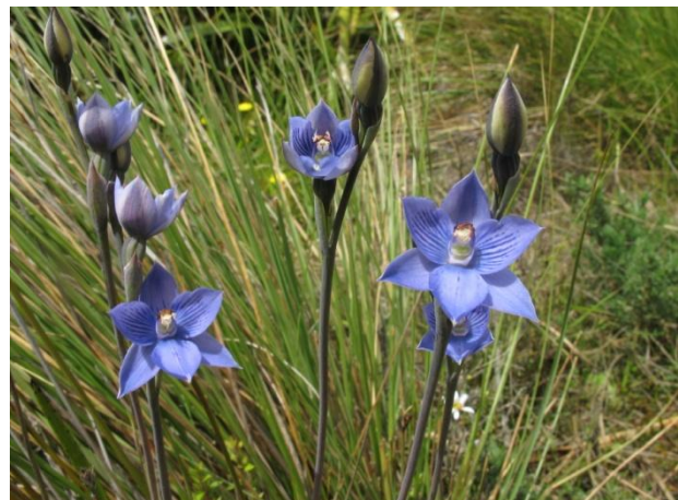
Aporostylis bifolia (left) and Thelymitra pulchella (right)