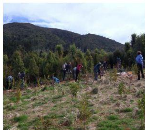
Figure 5 & 6 the excavated cow byre was part of the colonial farm development of Craigieburn. Otago Polytechnic horticulture student's plant trees to strengthen the bush edges of the original cleared paddock. The Amenities Society has combined the forest preservation values with the colonial history to create a unique conservation area.