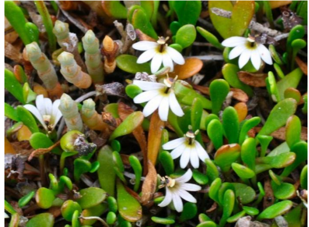
Schoenoplectus pungens Selliera radicans