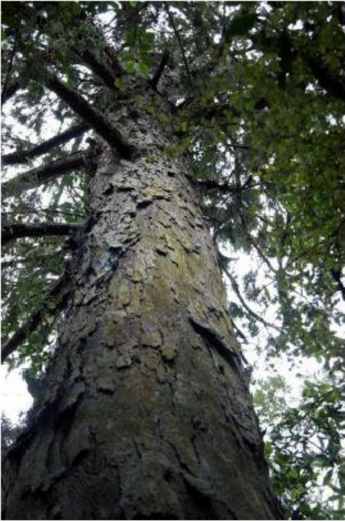
Figure 2 There are 52 rimu in the forest area of Craigieburn that are separated into two distinct areas by a pre-colonial period of disturbance in the forest canopy.

was clearly a very deliberate decision made by the family to retain the trees on the property.