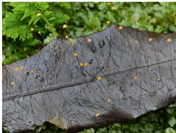
Fungi at Trotters Gorge

After a successful day, it was a bonus on the way home to sample some generous whitebait fritters and coffee, on the banks of the Shag River. It was great to have new faces and diversity of skills in the group.