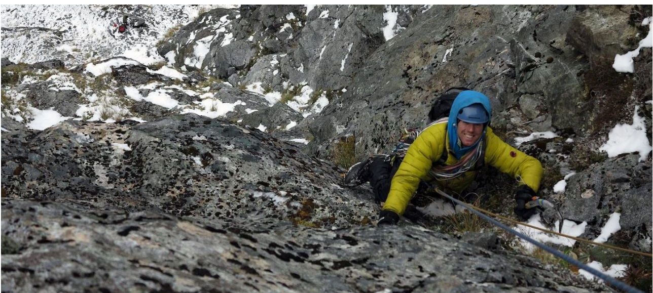
Climbing 'Home Turf', Homer Tunnel

The final 'ecosystem service' we will discuss here is the simple morale boost gained simply from encountering plants when they are not expected. To discover Ranunculus buechananii blooming at 2500m on the buttress of Mt Aspiring or lichens ( Thamnolia spp.?) on the 3600m summit rocks of Aoraki/Mt. Cook is to be reminded that life is pervasive, persistent and potent, even when we think (because we are cold, and struggling?) that conditions are surely too harsh for anything to survive in these places. Our mountain world is in fact full of life; the mountaineer delights in it. Then, after the privilege of such a trip, we return to Dunedin to be indirectly fed and watered by these self-same species. How priceless!