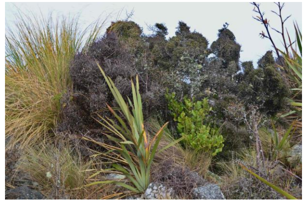
Mt Watkin summit

At 616 metres, Mt Watkin is the most prominent feature, but forms only a small corner of the Dunedin City Council's 650-hectare Mt Watkin / Hikaroroa Reserve regarded as one of the best remaining examples of dry coastal forest in Otago. John Steel and Aimee Pritchard abandoned the rest of the group to explore a part of this forest as well as the lower slopes of the other side of the mountain. This proved to be rather rough terrain with rock glaciers spreading into the upper levels of the forest and limiting exploration in the time available. The rocks here are rich in bryophytes and lichens with pockets of forest vegetation extending up from the forest in the valley below. The forest comprises two steep sided valleys with the mountain separating them. These streams join towards the base of the reserve before feeding into the Waikouaiti River. A public road,