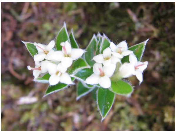
Pimelea pseudolyalii

After a successful day, it was a bonus on the way home to sample some generous whitebait fritters and coffee, on the banks of the Shag River. It was great to have new faces and diversity of skills in the group.