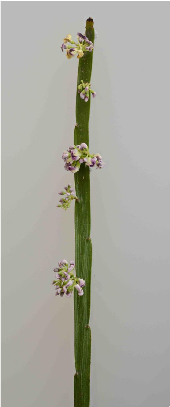
Carmichaelia sylvatica