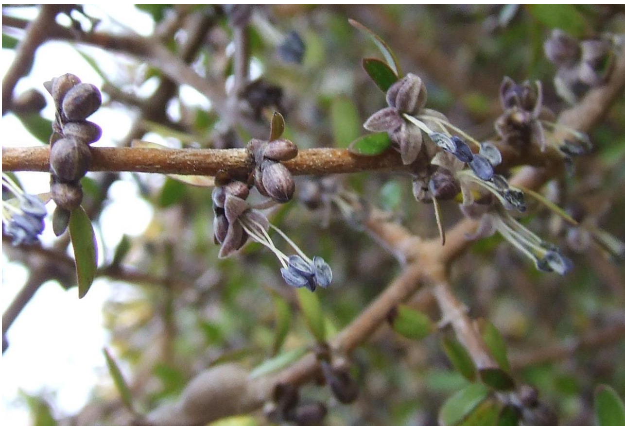
Coprosma propinqua with male flowers on show

Should anyone want a copy of the species list for this site, please contact John Steel at john.steel@botany.otago.ac.nz for an electronic copy.