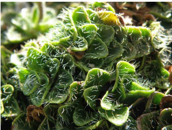
Ourisia glandulosa, Richardson Mountains, 1800m asl

As the chopper lowered us onto a nice looking camp site just below the crest of Glencairn Spur both Rich and I noticed that there were quite a few large animals watching us from an outcrop only a few hundred metres away. We leapt (carefully) out of the cabin, quickly unloaded our gear, grabbed our rifles and stealthily raced up the hill. We intercepted some goats as they were crossing a conveniently open face below some bluffs, and let rip. It sounds somewhat sadistic, but I get great satisfaction from removing exotic animals and plants from areas where I know they are causing great damage to the native vegetation. I feel like I'm making a little bit of a difference. Unfortunately our efforts