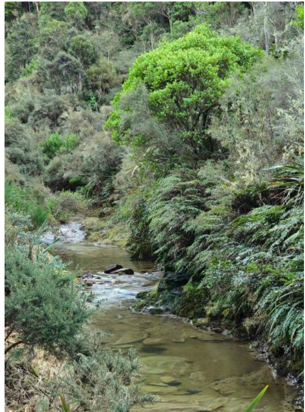
Carey's Creek

For me, Otago Botanical Society field trips never turn out the way I expect. True to form, during a recent trip to Evansdale Glen, one thing led to another and before I knew it I was inadvertently posing as Dr Seuss' The Lorax! But let me start at the beginning. During July, a group of keen Otago BotSoc members took a trip to Evansdale Glen, part of the Silver Peaks Reserve about 20 km north of Dunedin. Evansdale Glen is a beautiful spot hidden in a valley right below State Highway 1. I got quite a surprise when our car suddenly turned off a major highway, drove down a little gravel road that lead to a popular community picnic area, and arrived at the start of Carey's Creek track. It was a stunning morning, albeit a little fresh. When we arrived I immediately noticed flood effects from the recent floods that drowned the region in June. Thankfully it hadn't washed away any bridges or caused too much damage to the vegetation.