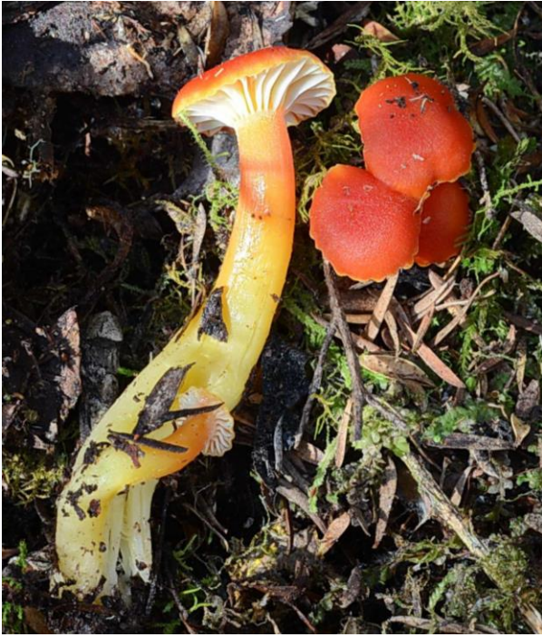
Hygrocybe sp. at Evansdale

Without wasting any time in the car park, we set off exploring the area by following the track alongside Carey's Creek. Soon enough the track became too slippery and dangerous so we had to either cross the river or venture up the cliff side. I was not mentally or physically prepared to get into that freezing river and so opted to climb upwards. This resulted in a bit of bush bashing and off track explorations. I can still vividly see the moss Thuidiopsis furfurosa carpeting huge areas up the cliff side. This particular moss stood out to me because I had seen it in my work with DOC, but always in a dried form. I hadn't realised just how common it is round Dunedin.