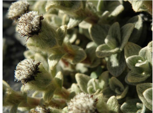
Haastia sinclairii var. fulvida inflorescence closeup, Richardson Mountains, 1900m asl

After navigating through a set of bluffs, over many steep icy snow shoots, and around glacially eroded ribs of schist bedrock, we finally reached the location where the plot was to be set up. The plot area turned out to be 1/3 bedrock, 1/3 glacial rubble, and 1/3 semi-permanent snow (in March). The area looked like it had been covered in glacial ice until very recently, possibly only 10-15 years ago judging by the almost un-weathered state of the glacially smoothed bedrock. Surprisingly eight species of plants were present within the 20mx20m square, somehow managing to cling onto the unstable rock and glacial silt. These included two grasses, Agrostis muelleriana and Poa novae-zelandiae ; three willow herbs, Epilobium crassum , E. glabellum and E. purpuratum ; also Myosotis pulvinaris , Cardamine corymbosa and Colobanthus canaliculatus . In this high-altitude active environment, where snow probably covers the ground for all but 2-3 months of the year a surprisingly diverse plant and associated animal community persists. After completing all the plot work I was able to spend the long evenings exploring the surrounding area and compiling a species list. I was surprised to