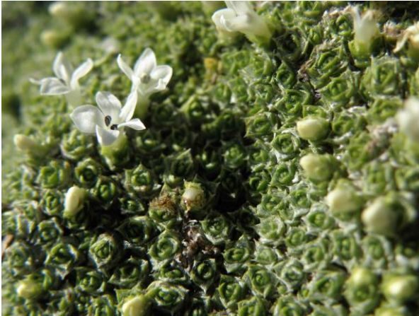
Chionohebe thomsonii , Richardson Mountains, 1900m asl

were really just a token gesture. There were many more goats, each one capable of munching kilograms of vegetation per day, and signs of browse were everywhere. We had limited time and more pressing work to get done.