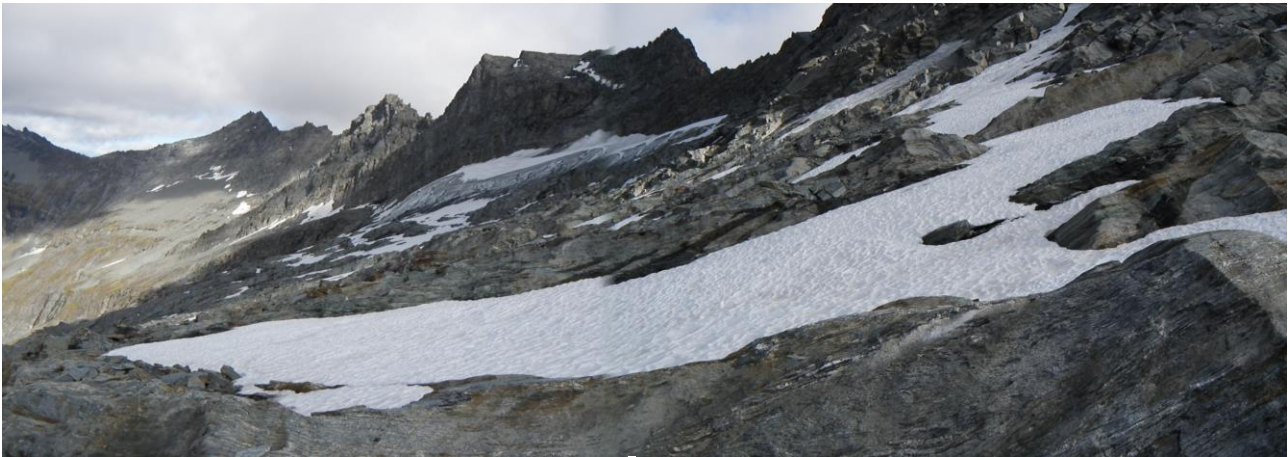
View of general area where our plot was located

monitoring most of the plots in the Southern South Island, from Haast Pass/Dunstan Range south to Stewart Island. We set up and measure 20mx20m vegetation plots, with associated bird stations and ungulate monitoring lines. These plots are set at precise 8km intervals across all of the conservation land in New Zealand, and are able to be re-measured every 5 years. Due to the pre-determined nature in which our work areas are selected, plots often end up in some pretty unusual places. One example of this was a plot we set up and measured near Little Lochnagar Peak in the Richardson Mountains, north of Queenstown.