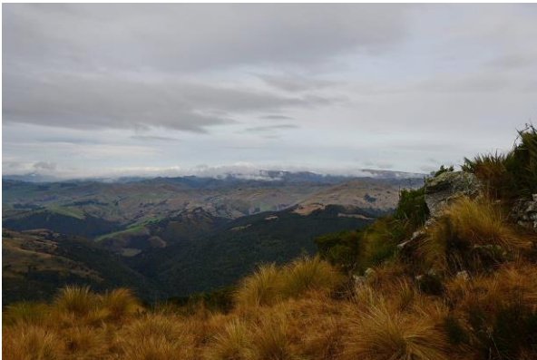
View from Mt Watkin

Eleven Botanical Society members headed north on a cool misty morning to turn west just south of Waikouaiti to wind inland a few kilometers to the lower slopes of Mt Watkin. A short attempt to climb the rock glacier showed how hazardous this could be so we backtracked and climbed up a clearing just to the south. Higher up they found the combination of damp and lichens on the rock surfaces was treacherous for climbing on, but eventually made the top. A good view over the Waikouaiti-Karitane coastline through the mist.