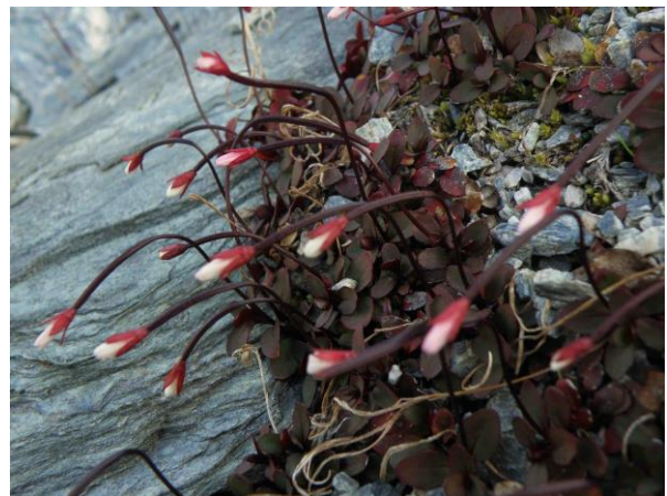
Epilobium purpuratum, Richardson Mts, 2000m asl