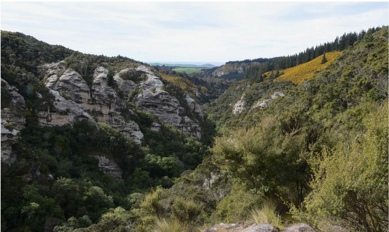
Trotters Gorge

There are two tracks leading from the western end of the campsite. The track that the majority took on the day was the loop track along a narrow, steep-sided valley, past small caves and up to a ridge presenting beautiful views of the coast and inland. Some years ago the fern, Notogrammitis ciliata , was noted here, but later disappeared from where it was found. A dead specimen was found at a different spot in 2012 so it was a delight to find further specimens in abundance along the track. Patches of a fertile liverwort, Hymenophyton flabellatum and the moss, Plagiomnium novae-zeelandiae , helped highlight the existence of these often spurned groups of plants. At the summit it was time for lunch and soak up some sun atop a large, lichen-encrusted rock allowing extensive views of the distant towns and farmlands while surrounded by another local rarity, Pimelea pseudolyallii , in full bloom. The local endemic, Celmisia hookeri , was abundant and healthy with plenty of juvenile plants. However, the small-leaved shrub, Teucrium parvifolium , does not seem to be faring well with fewer plants than noted on earlier trips and completely gone from one site.