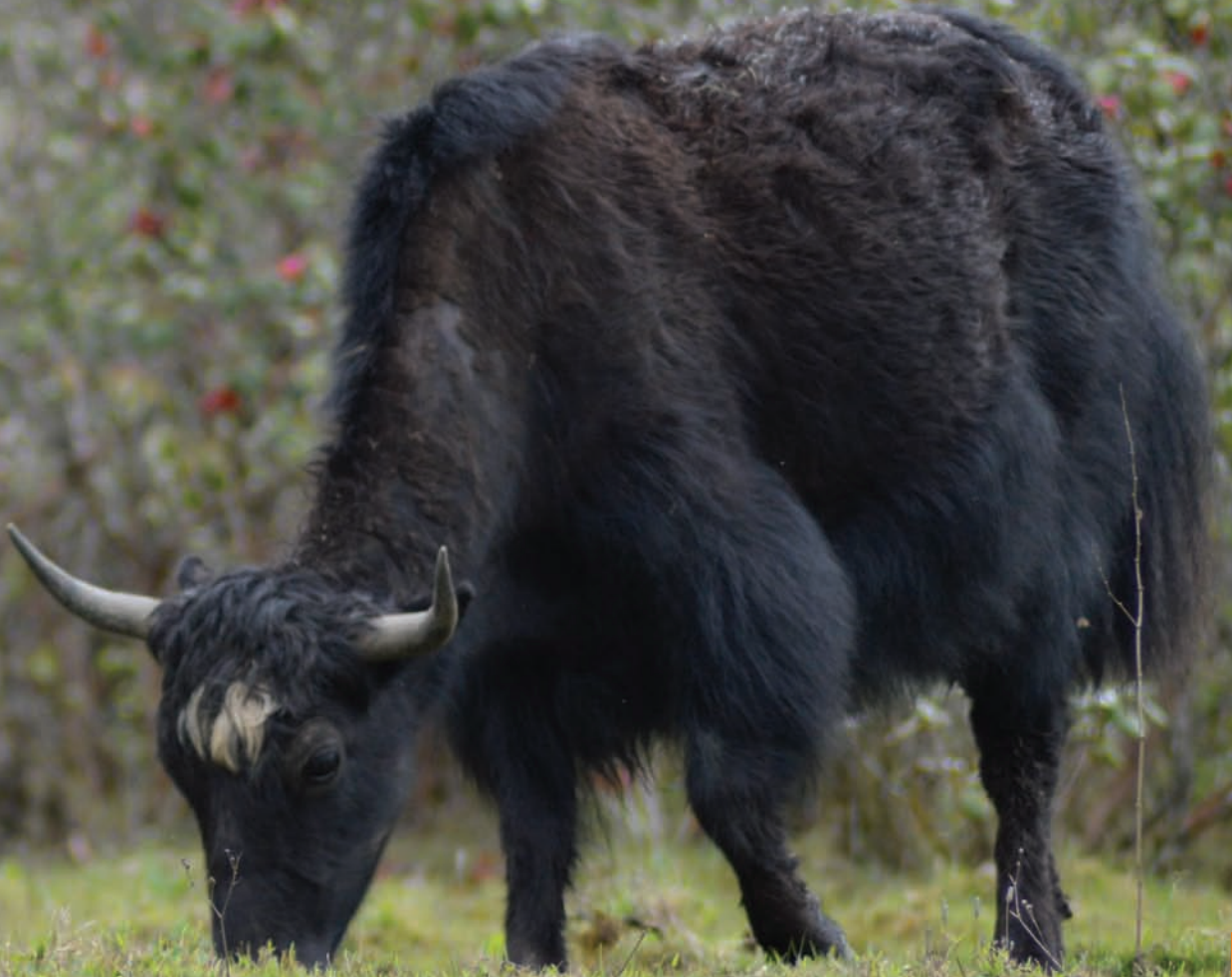
Yak ( Bos grunniens )