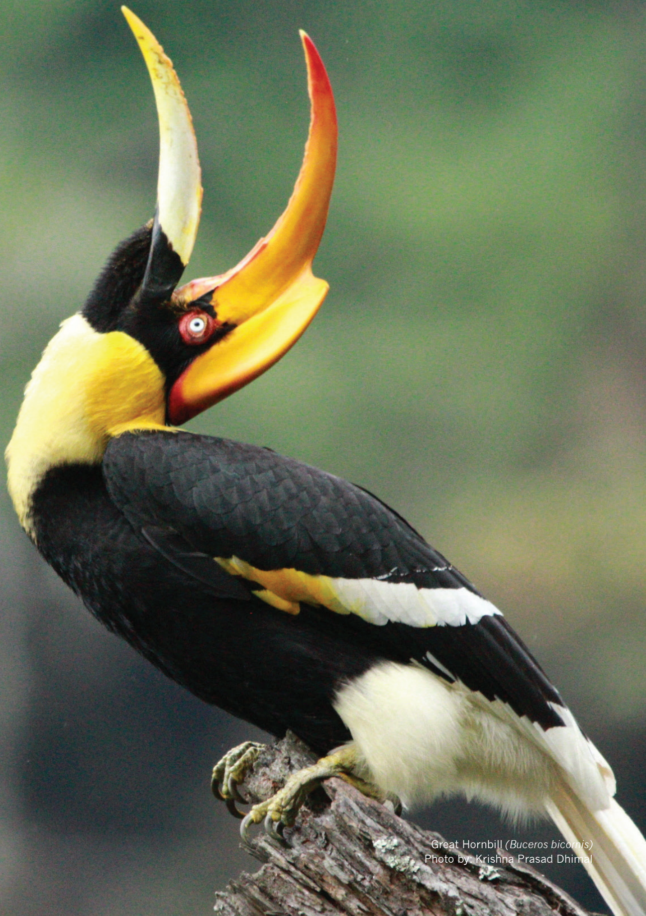
Great Hornbill ( Buceros bicornis )