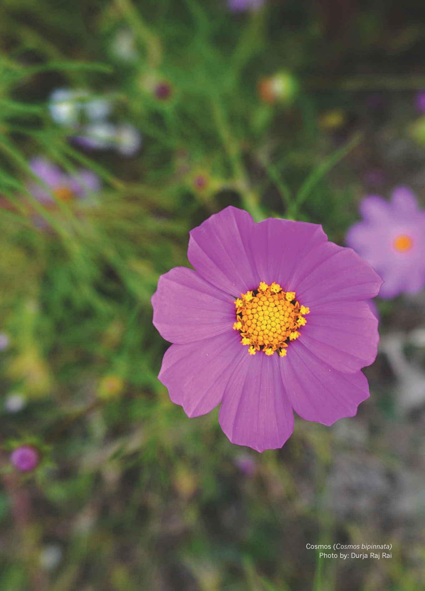
Cosmos ( Cosmos bipinnata)