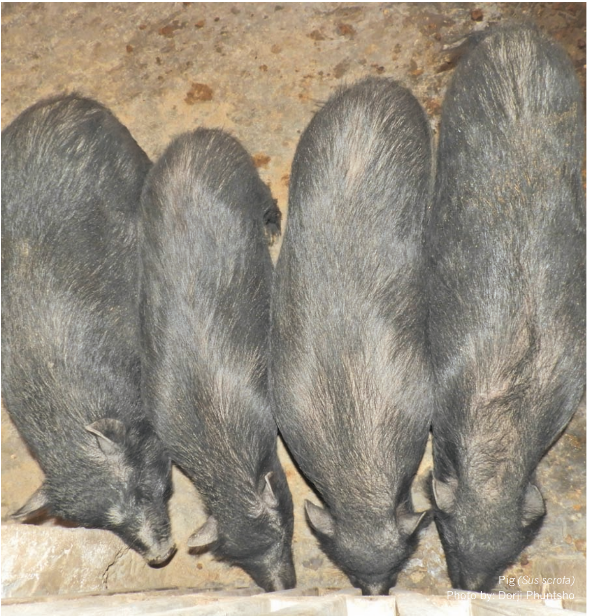
Pig ( Sus scrofa )