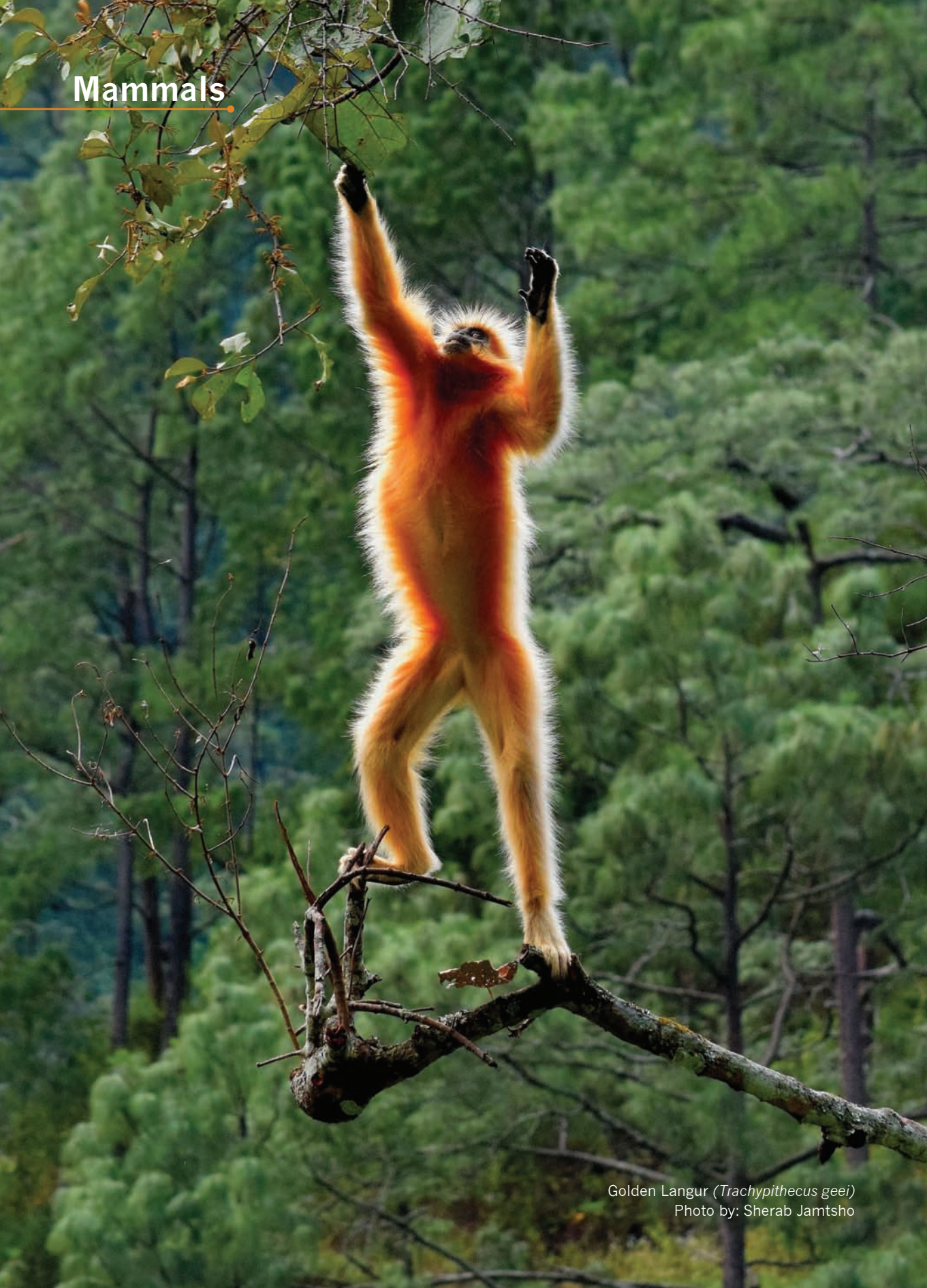
Golden Langur ( Trachypithecus geei )