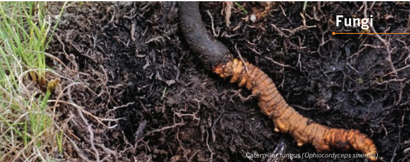
Caterpillar fungus ( Ophiocordyceps sinensis )