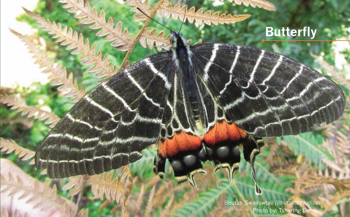
Bhutan Swallowtail ( Bhutanitis ludlowi )