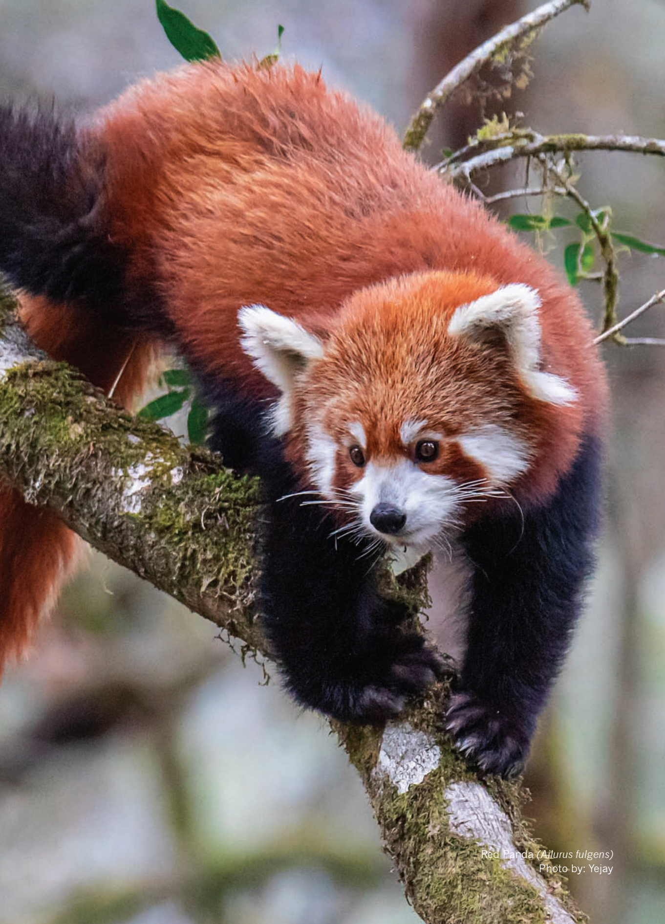
Red Panda ( Ailurus fulgens )