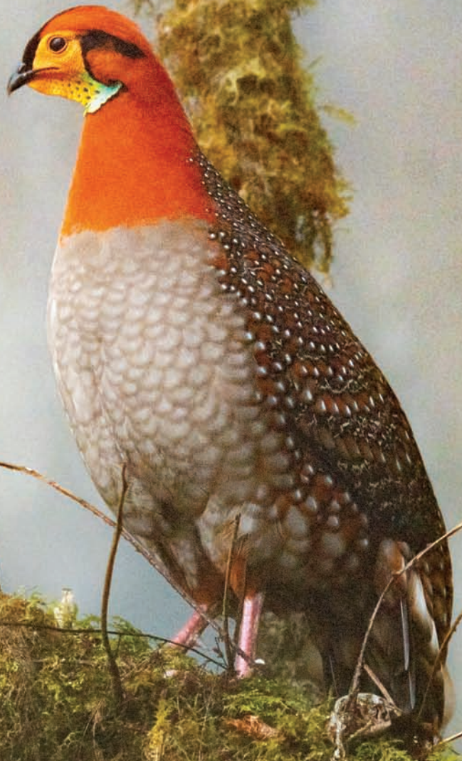
Blyth's Tragopan ( Tragopan blythii )