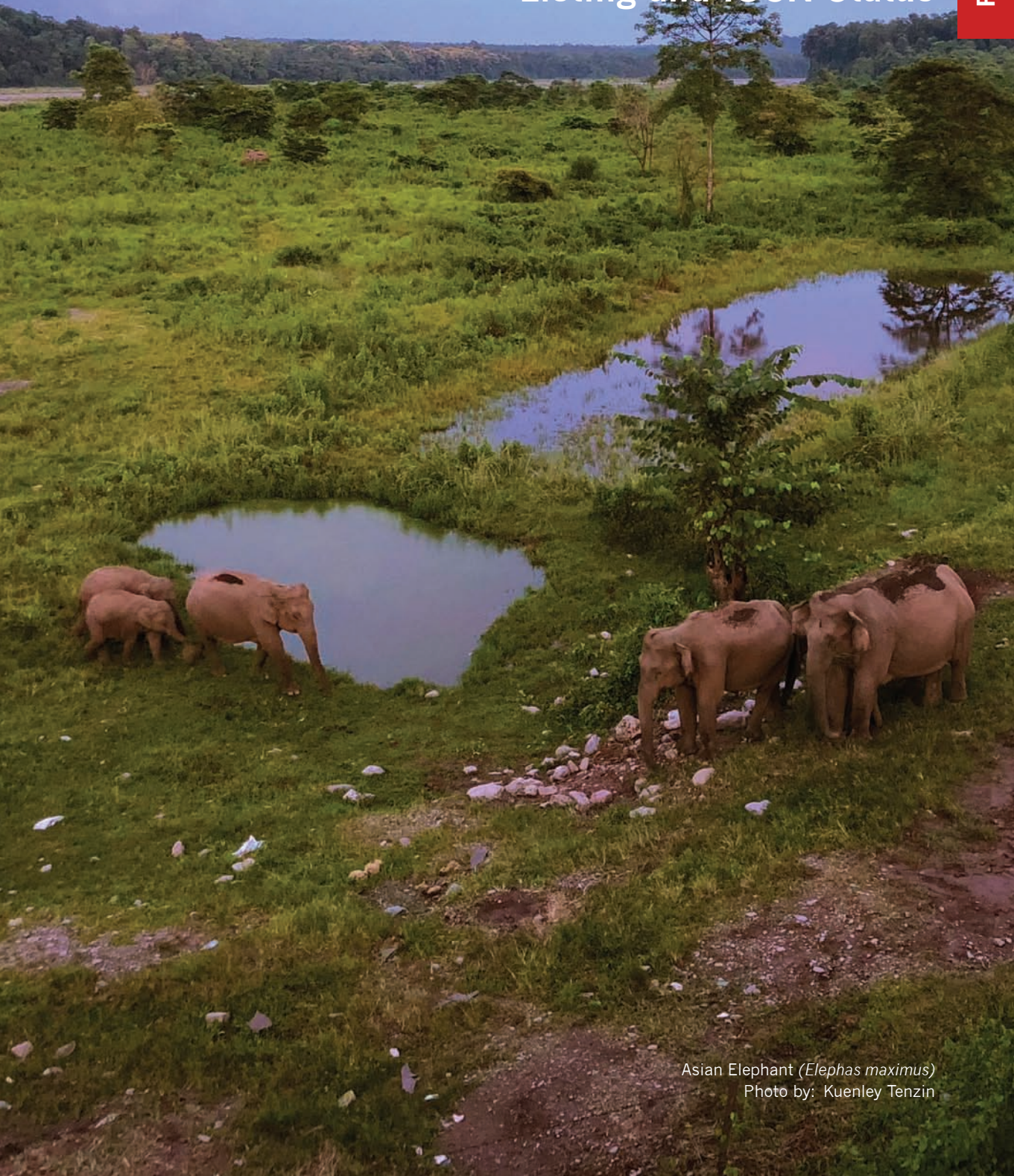
Asian Elephant ( Elephas maximus )