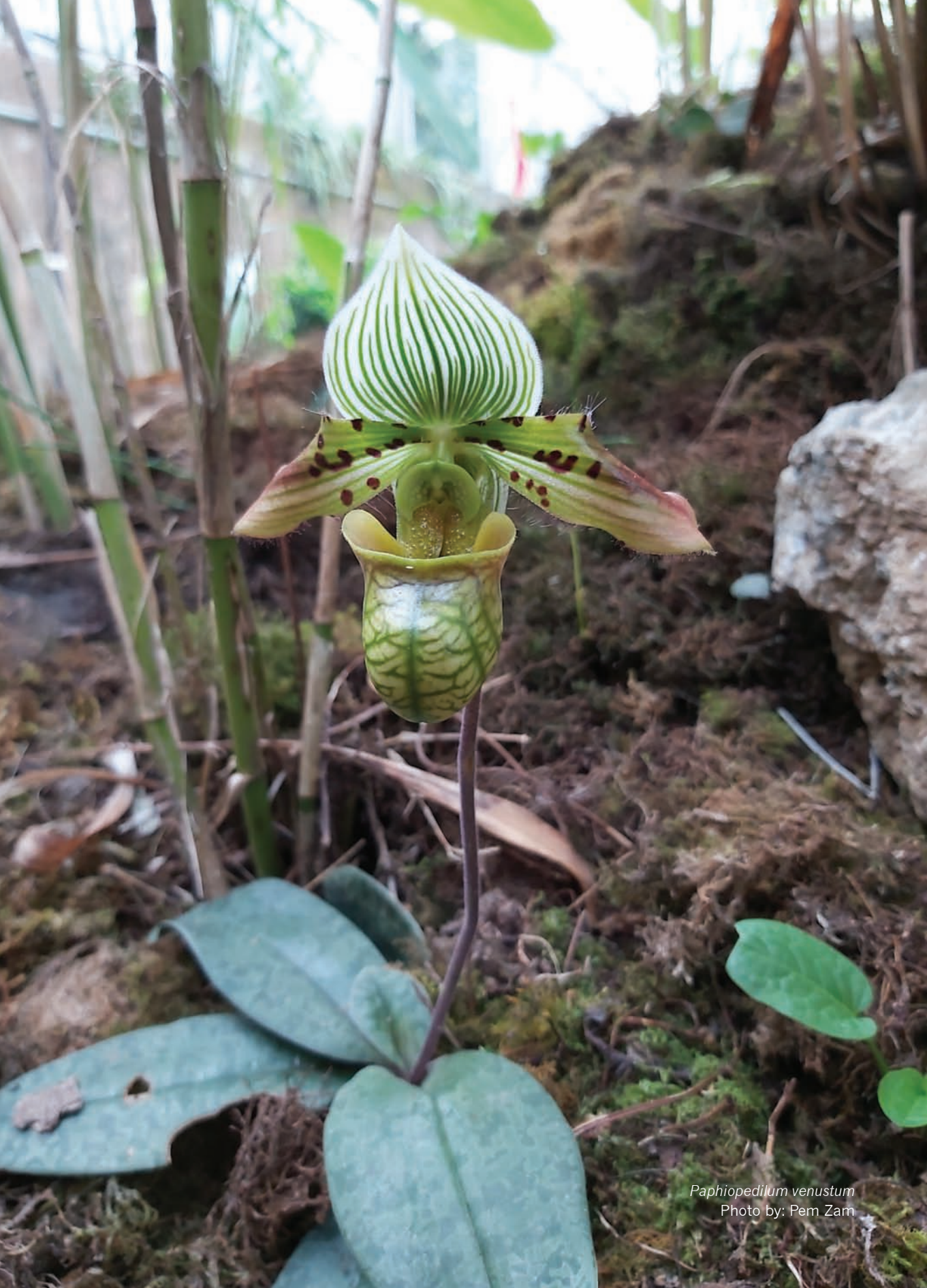
Paphiopedilum venustum