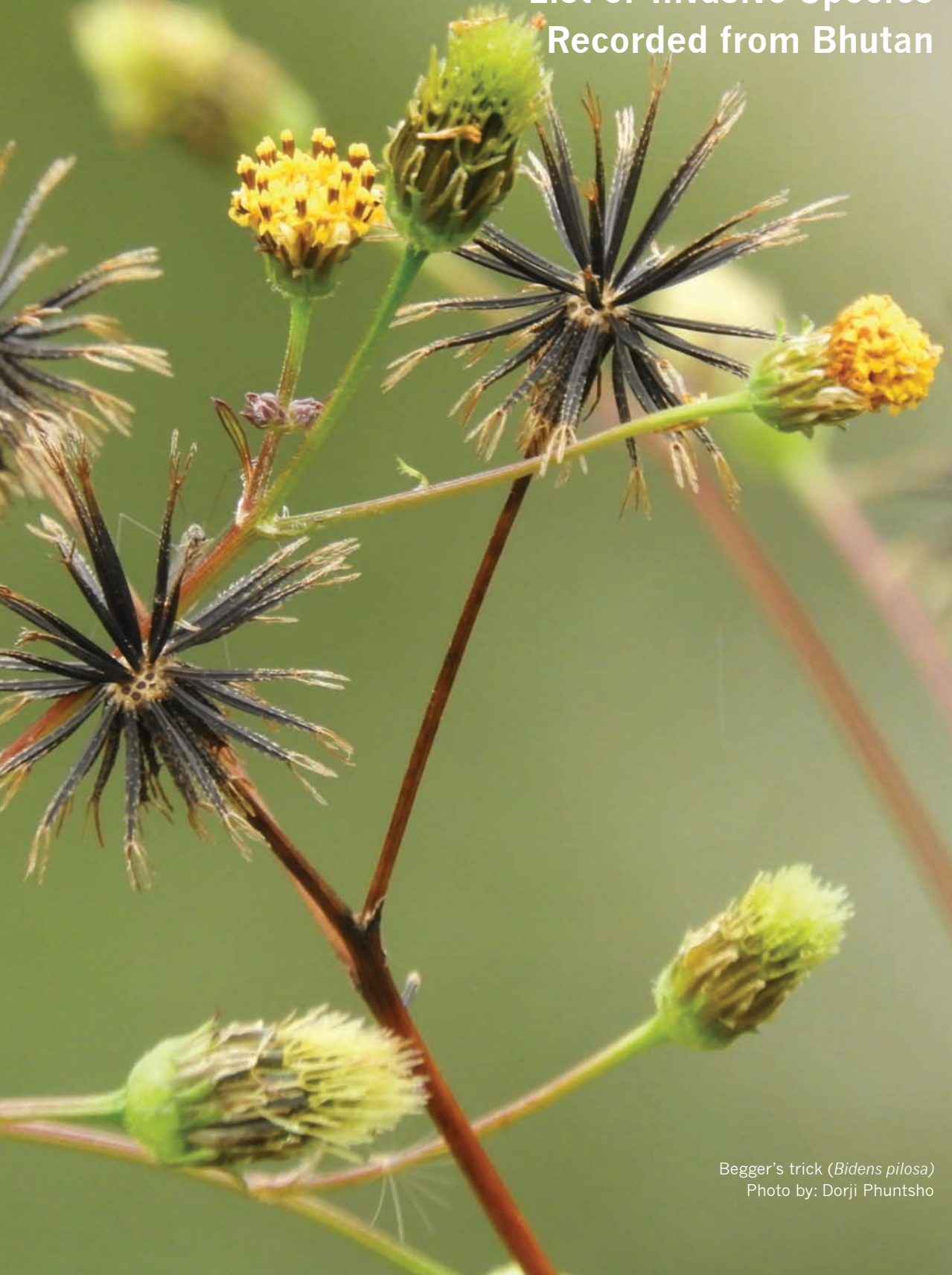
Begger's trick ( Bidens pilosa )