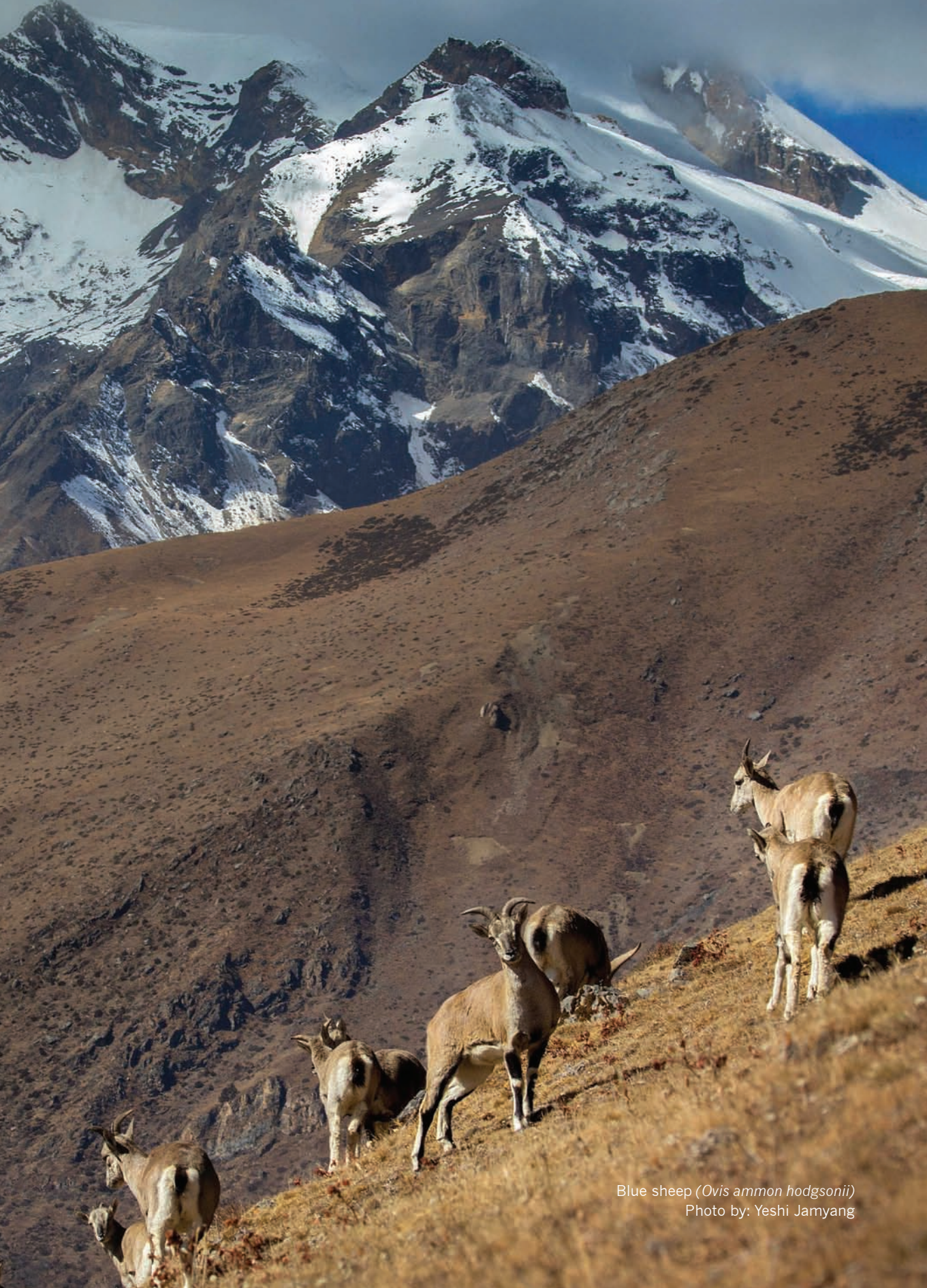
Blue sheep ( Ovis ammon hodgsonii )