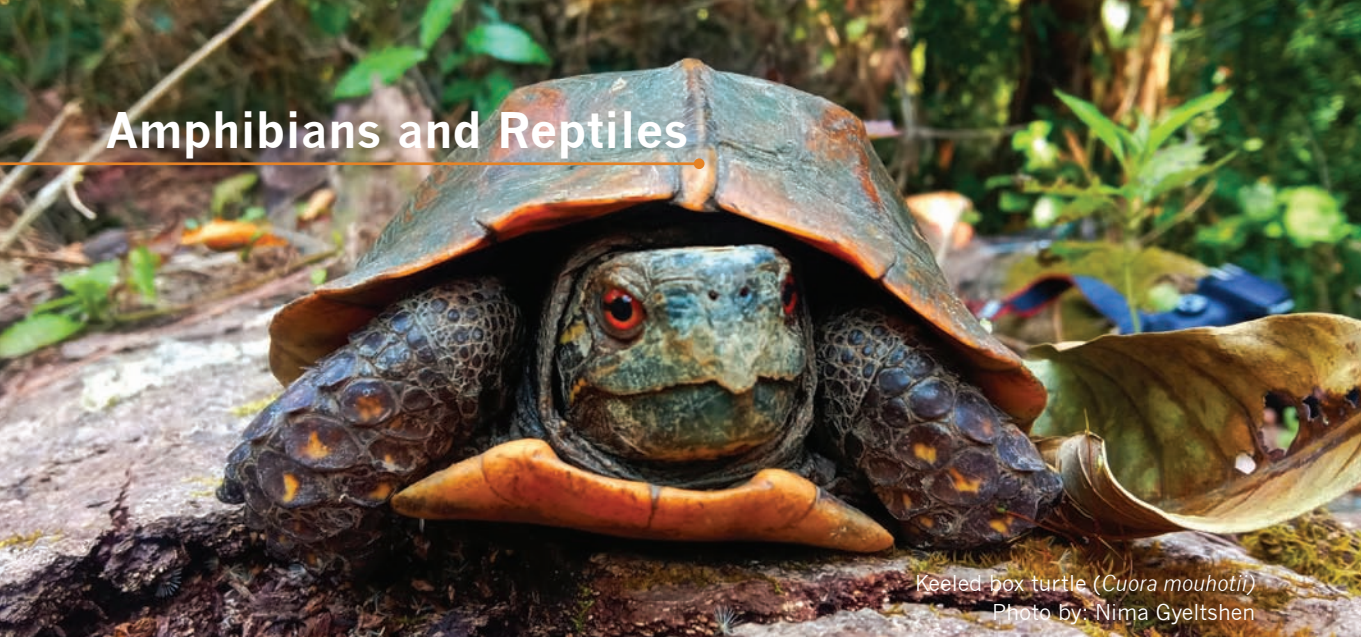
Keeled box turtle ( Cuora mouhotii )