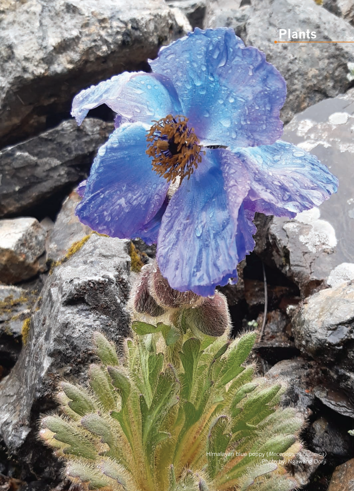
Himalayan blue poppy ( Meconopsis bhutanica )