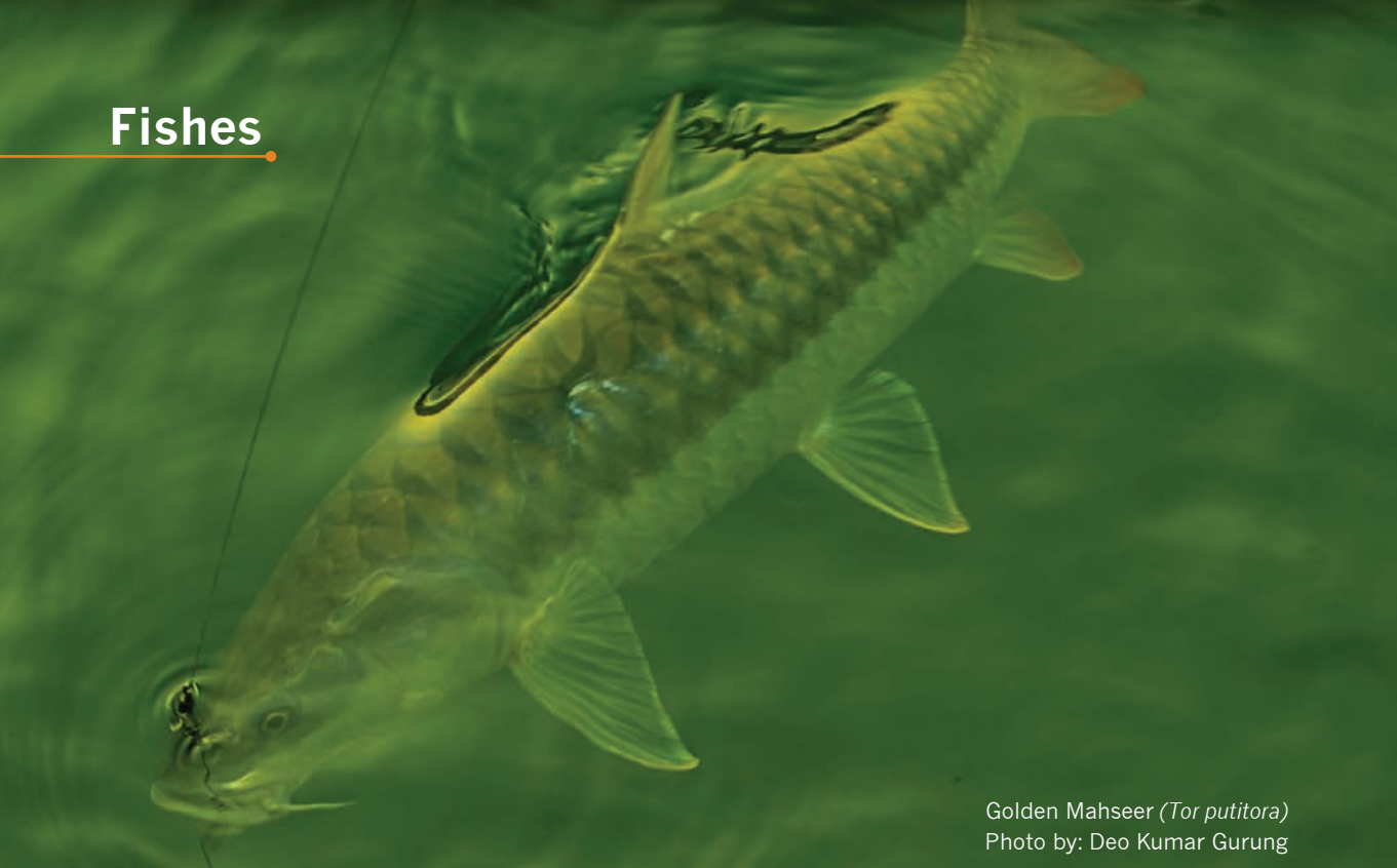
Golden Mahseer ( Tor putitora )