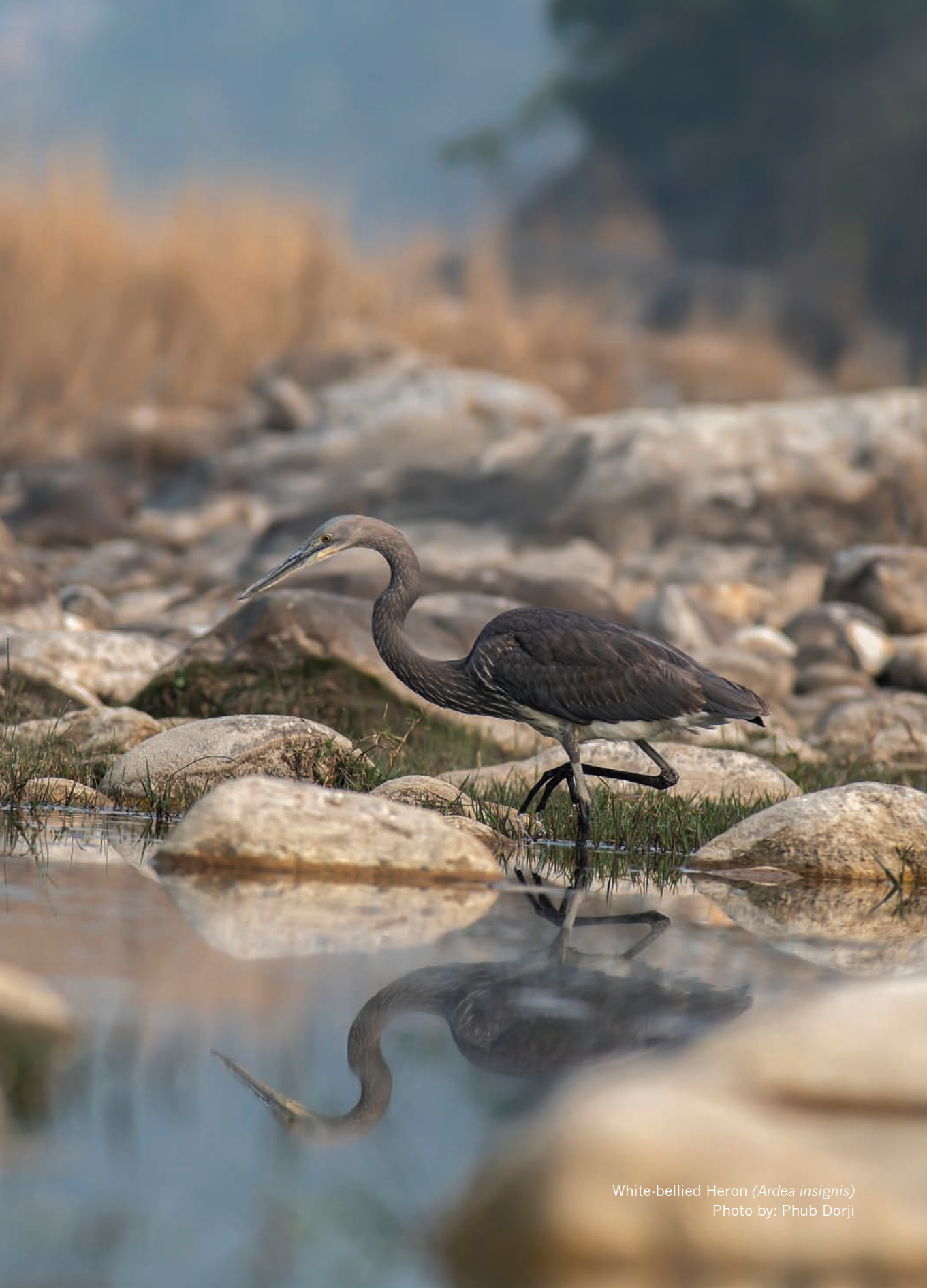
White-bellied Heron ( Ardea insignis )