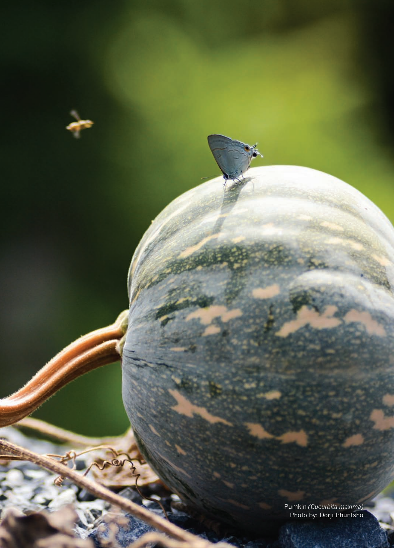
Pumkin ( Cucurbita maxima )