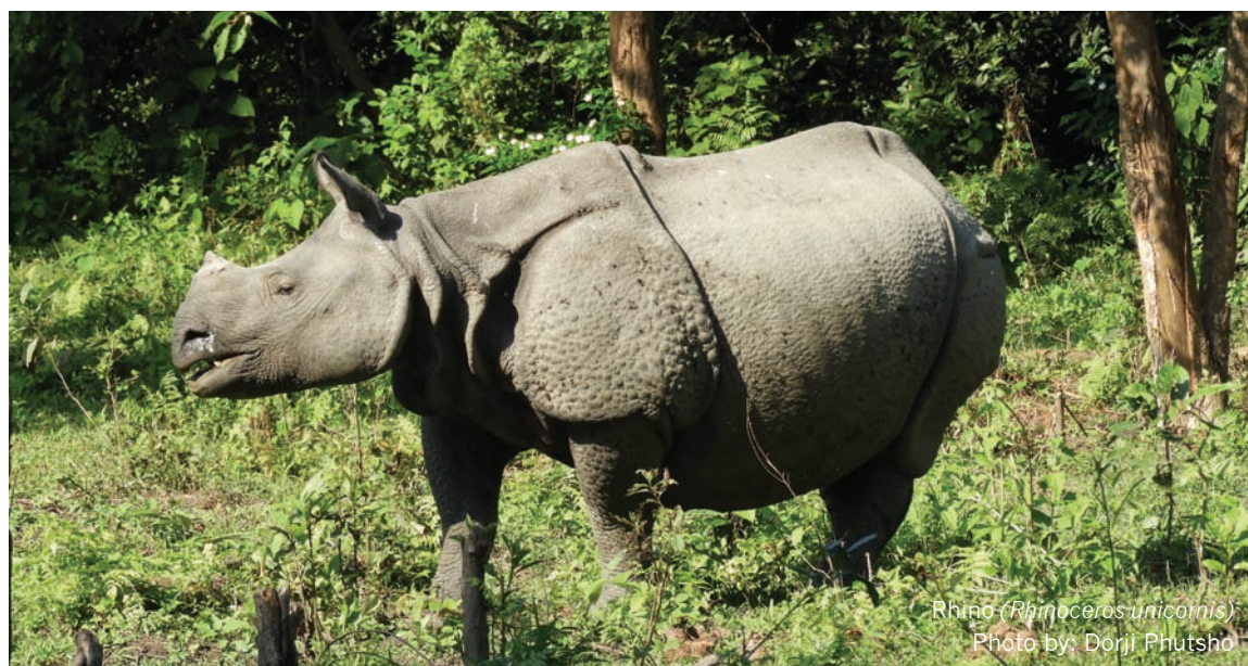
Rhino ( Rhinoceros unicornis )