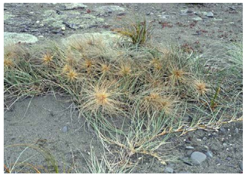
Figure 8. Spinifex sericeus.

Found throughout New Zealand, this almost-exclusively coastal species is also indigenous to India, Australia, and some Pacific Islands. Its stout, horizontal stems run for tens of metres, with tufts of silky-hairy, silverygreen leaves c. 30 cm long at the nodes, stabilising dunes by reducing wind flow and trapping sand (Fig. 8). Spinifex sericeus is dioecious, and even from a distance, in flower, male plants are easily distinguishable from female plants (Figs. 9, 10). The racemes of the male inflorescence spread out in the shape of a fan, shown in Fig. 9, with bright orange pollen on the stamens. The female inflorescence, described by Edgar & Connor (2000) as conspicuous, is spherical (Fig. 10), with a radius of c. 15 cm. Its spikelets, clustered tightly at the centre, are between 15 and 18 mm long, and shaped exactly like a miniature toheroa shell. No wonder then, that in early times, some coastal Māori tribes are said to have thought that these were indeed toheroa seeds, and that as the Spinifex spheres bowled along in the wind, they seeded the beach with toheroa. Hence, through a process of inference, they called the spheres, "māmā pīpī toheroa", mothers of baby toheroa (Source: the late Pūhipi Te Pā (Te Rarawa), Ahipara, Te Oneroa-a-Tōhe, Ninety Mile Beach). It seems to me that worldwide, such a process of close observation and reasoning has been the basis of many a theory in the long history of scientific thought.