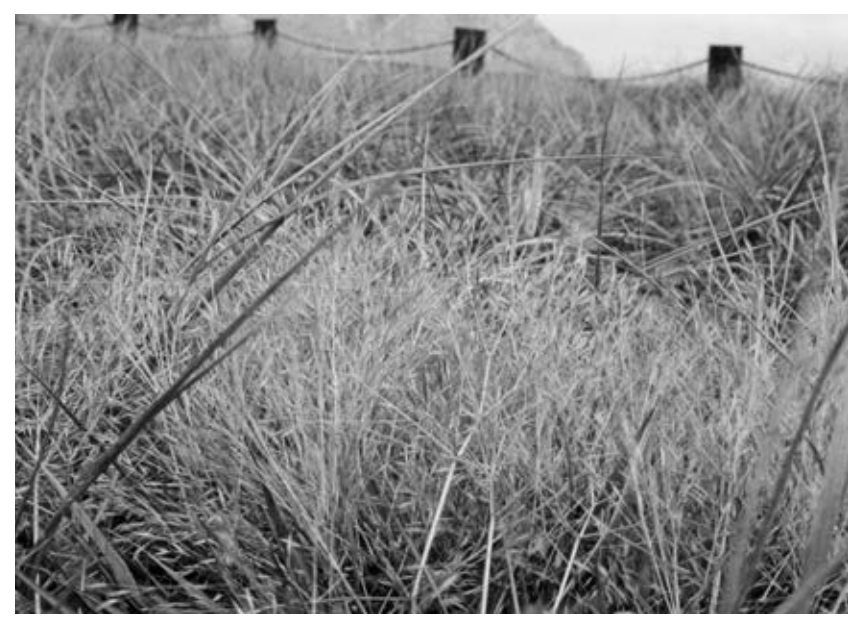
Figure 5. Lachnagrostis filiformis.

The feature that captured my attention when I first saw this dainty, indigenous grass (Fig. 5) on Wellington's west coast was its unusual, expanded, almost-spherical panicle. This can be up to 30 cm diameter, and has delicate branches of unequal length radiating from a central point, like a dandelion seedhead. Even more delicate, filiform branchlets are dotted with gingery spikelets, which, as the common name suggests, are mobile in the wind. The usually-erect culm can be up to 30 cm, and arises from tufted, light green or bluish-green leaves. A healthy plant can have more than 40 culms arranged in a circle. Indigenous, but not endemic, New Zealand wind grass can grow as an annual or perennial. Recently two plants of it were recorded naturally occurring in Makara Foreshore Reserve, after WCC weed control there.