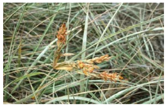
Figure 9. Male inflorescence of Spinifex sericeus.