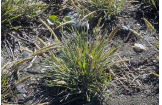
Figure 3. Trisetum antarcticum.

Trisetum antarcticum is an endemic New Zealand grass of threatened status, categorised nationally as in gradual decline. Records of it exist from the 19th century for the western and southern Wellington coast, but it is now uncommon here because of aggressive, adventive grasses invading the territory. Its natural habitat is coastal gravel, sand and bluffs, from sea level to 300m a.s.l. BotSoccers on the trip to the Carrad QEII Covenant on the western escarpment of Pukerua Bay may remember my pointing out one lone plant of it among weeds on a foreshore rockstack, such is its uncommonness. The tufts are noticeably densely compact (Fig. 3), with stiff, bluish-green, rigid leaves, smooth abaxially but adaxially ribbed and minutely hairy. The panicle is described by Edgar & Connor (2000) as "compact, dense, oblong; sometimes with spreading, lower branches" (Fig. 4). However, I have not yet seen any Wellington T. antarcticum with spreading, branched panicles. Seed from the single plant found during a botanical survey of Taputeranga Island in 2003, and from another