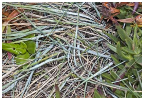
Figure 1. Elymus solandri.

Next time you're walking round the beach to Breaker Bay from Seatoun, via Dorset Point (highly recommended), look for scattered patches of this handsome, indigenous grass among the weeds at the base of the escarpment.