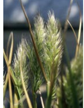
Figure 4. Panicles of Trisetum antarcticum .