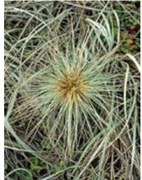
Figure 10. Female inflorescence of Spinifex sericeus.