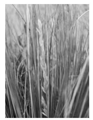
Figure 6. Panicle of Poa billardierei.

Indigenous to both New Zealand and Australia, at first glance sand tussock is often mistaken for silver tussock, Poa cita . But its erect culms and narrow "almost spike-like" panicles, with densely-packed spikelets (Edgar & Connor 2000) producing an attractive "plaited" look (Fig. 6), are markedly different from those of silver tussock. Sand tussock forms very dense clumps, usually c. 50 cm high in Wellington, on sand or shingle beaches such as Palliser Bay (Fig. 7). Its stiff, golden leaves are wiry, in-rolled, c. 1 mm wide, and sharply-pointed. In 1908, Dr Aston recorded sand tussock on Wellington's Owhariu coast