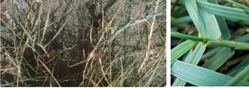
Figure 11. Elytrigia pycnantha.

Sea couch is an unwelcome immigrant. This robust, adventive, rhizomatous grass is rapidly colonising Wellington's beaches, dunes and rocky sites, forming dense swards along much of the south coast (Fig. 11). From a distance, mature plants of it can easily be mistaken for our native spinifex, being of a similar height, and somewhat similar in colour, habit, and habitat. But closer up, one can see that Elytrigia leaves are not silky-hairy but have prominent, close-set, scabrid ribs and scabrid margins (Fig. 12).