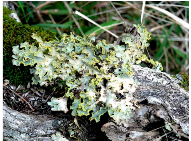
Fig. 5. Pseudocyphellaria poculifera , on fallen branch in light gap, Taraire Valley, July 2008.