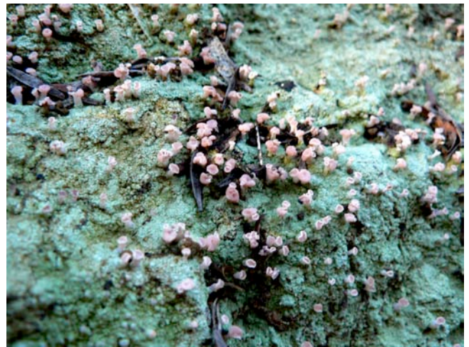
Fig. 7. Baeomyces heteromorphus , shaded roadside banks between lodge and airstrip, July 2008.