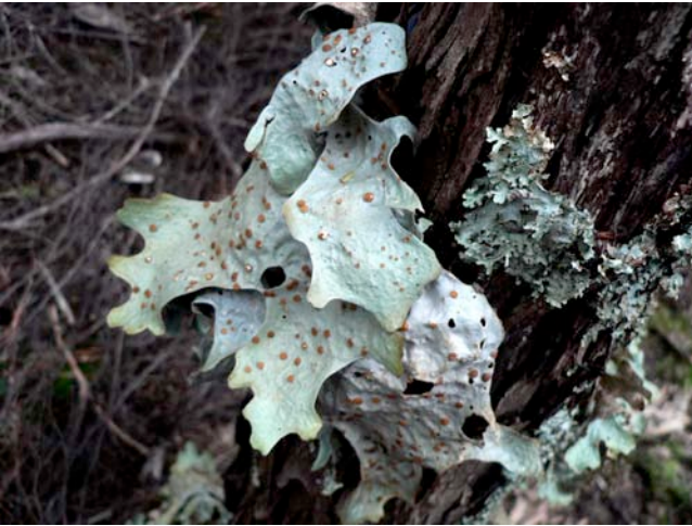
Fig. 4. Sticta , kanuka trunk, upper Taraire Valley, July 2008.