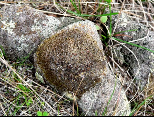
Fig. 10. Xanthoparmelia species on top of inland bluff, Ngati Rehua track, July 2008.