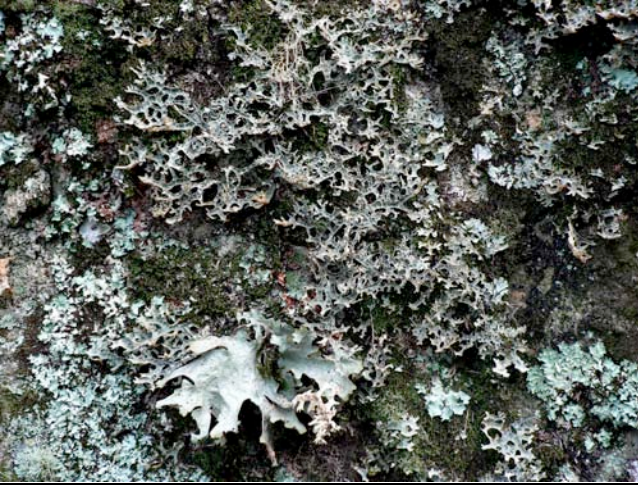
Fig. 8. Pseudocyphellaria carpoloma on shaded bluff, Ngati Rehua track, July 2008.