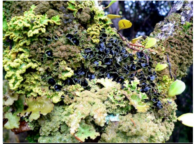
Fig. 3. Fruiting Pseudocyphellaria species on a kanuka, upper Taraire Valley, December 2008.