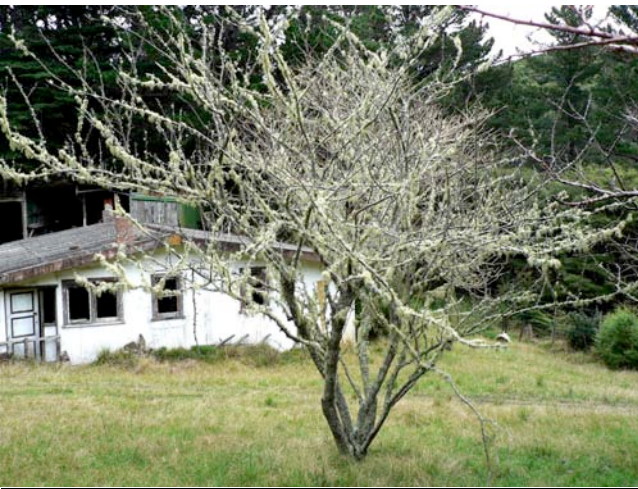
Fig. 12. Top House orchard, with plum tree festooned in lichens, July 2008.