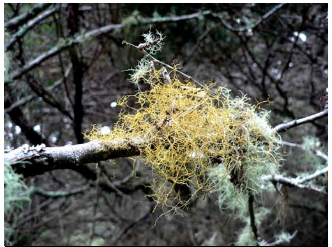
Fig. 13. Teloschistes flavicans on plum tree in Top House orchard, July 2008.