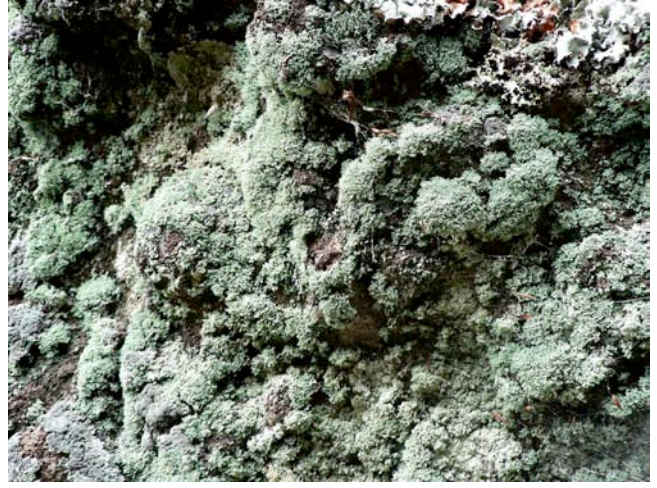
Fig. 9. Leprocaulon arbuscula on volcanic breccia, Ngati Rehua track, July 2008.