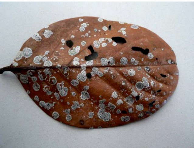
Fig. 6. Strigula delicata on fallen taraire leaf, from Taraire Valley, December 2009.