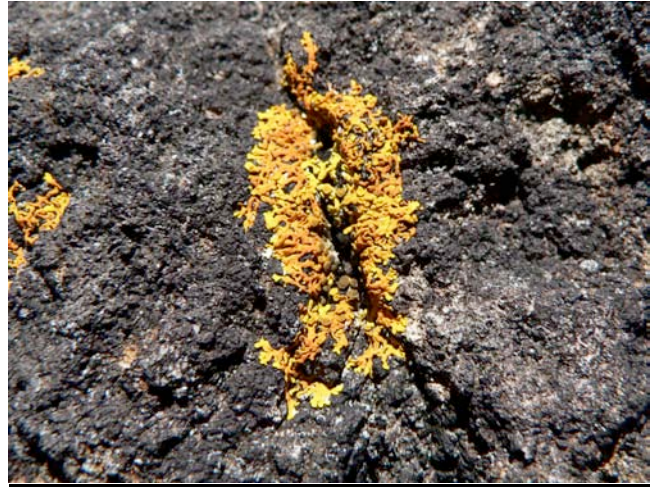
Fig. 11. Jackelixia ligulata on coastal rocks below Mt Overlook, July 2008.