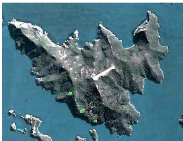
Fig. 1. Map of the island showing the quadrat sites. (created by G. Aguilar).

Over the four trips, most of the island was surveyed, with particular emphasis on the area around the lodge, the pine forest and kanuka forest between the lodge and airstrip, the airstrip, the scrub, around the airstrip, the forested gully up from Houseboat Bay, the Ngati Rehua track, Taraire Valley, Bradshaw Cove, Waitetuna Bay, track to Mt Overlook and the track from there back to the lodge. Six permanent quadrats (Fig. 1) were also set up on rocky substrates between the lodge and Taraire Valley and within Taraire Valley. Ten kanuka trees in the upper part of Taraire Valley were surveyed with horizontal quadrats (relevé). These quadrats will be monitored annually for any changes to lichen diversity or cover.