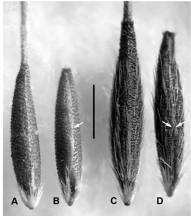
Fig. 1. A & B: Austrostipa ramosissima A. Floret, dorsal view. B. Floret, ventral view, awn shed; arrow indicates outer edge of lemma. C & D: A. verticillata C. Floret, dorsal view. D. Floret, ventral view, awn shed; arrows indicate gap between edges of lemma, caused by swelling of caryopsis. Scale bar 1 mm. (A & B from AK 257364. C & D from AK 255949.)

Lemma 2.7–4 mm long, with hairs scattered over most of surface, roughened by close-spaced, rounded to subacute tubercles ..... A. verticillata