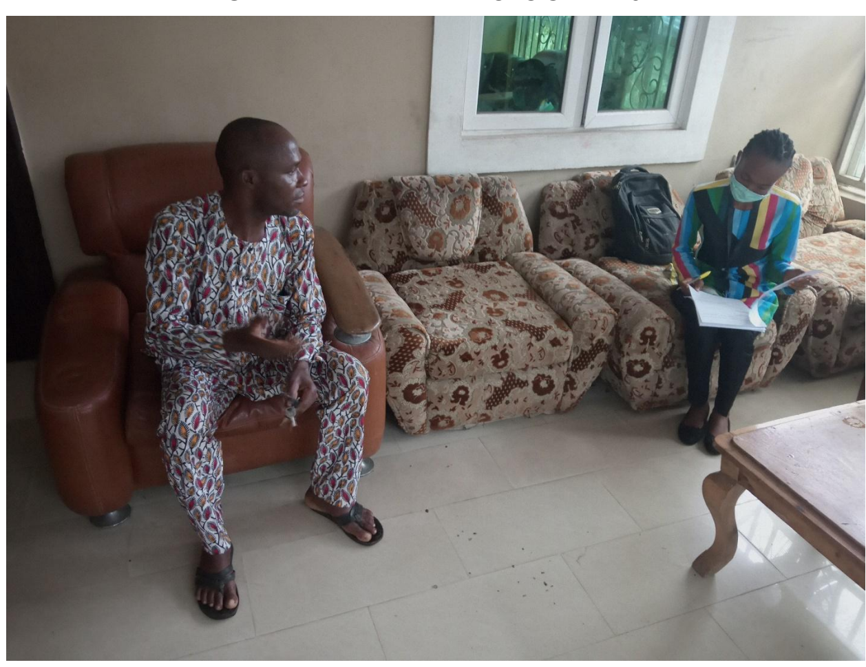
Figure 1: Interviewing the Community President General (King's representative)