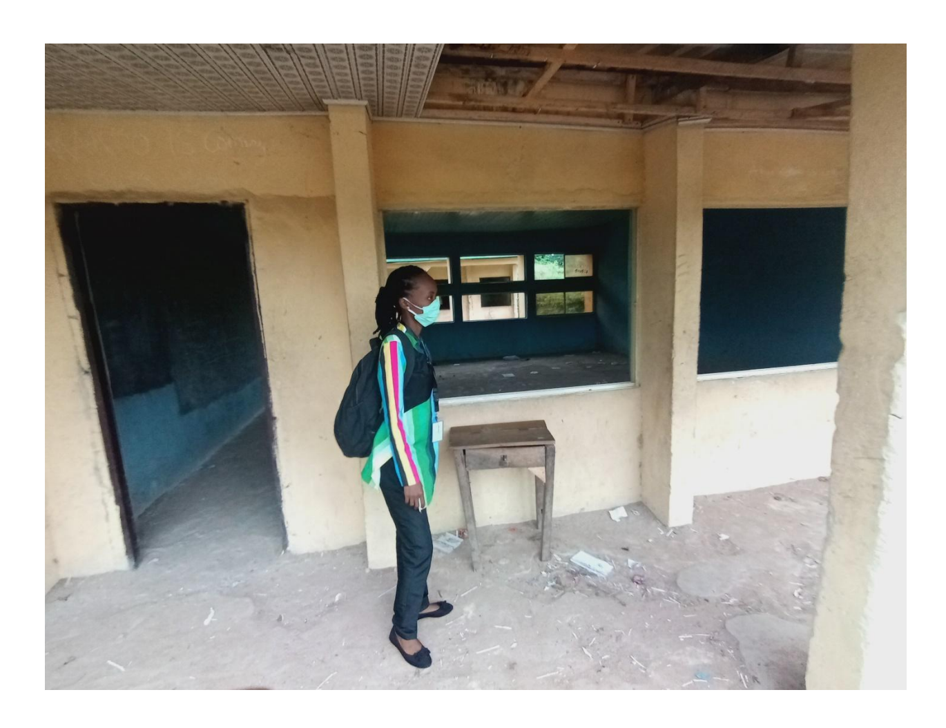
Figure 3: Vandalized classroom at Umuriam Technical School, Obowo