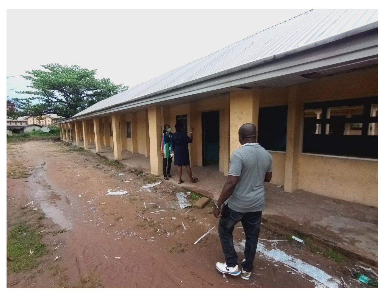
Figure 2: Renovated block of classrooms at Umuriam Technical School, Obowo