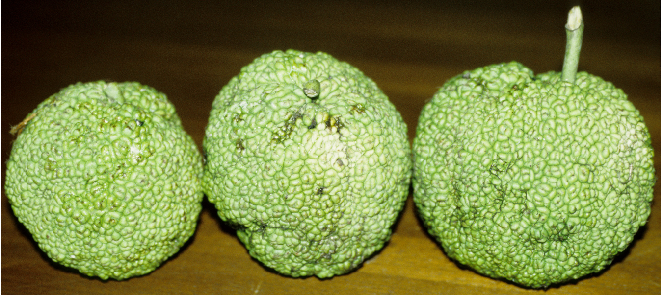
Figure 5: Osage-orange fruit showing shape and size variation. Fruit taken from area with both male and female trees.