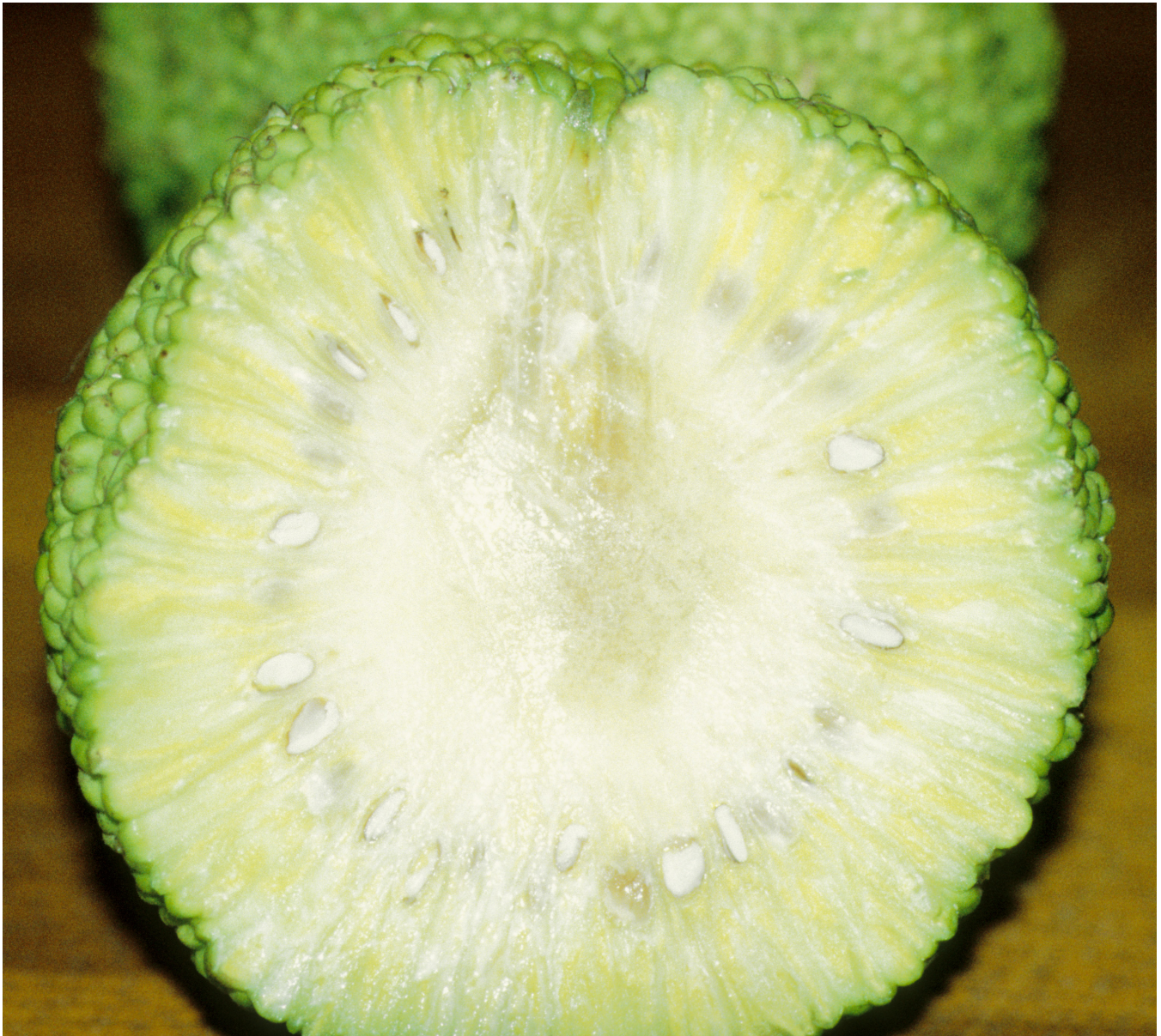
Figure 6: Osage-orange fruit cut in half showing seeds. Fruit taken from area with both male and female trees.