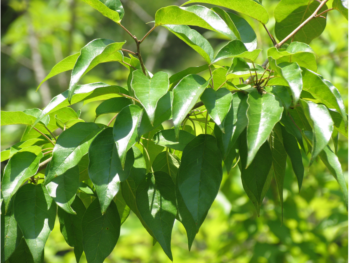
Figure 3: Osage-orange leaves.