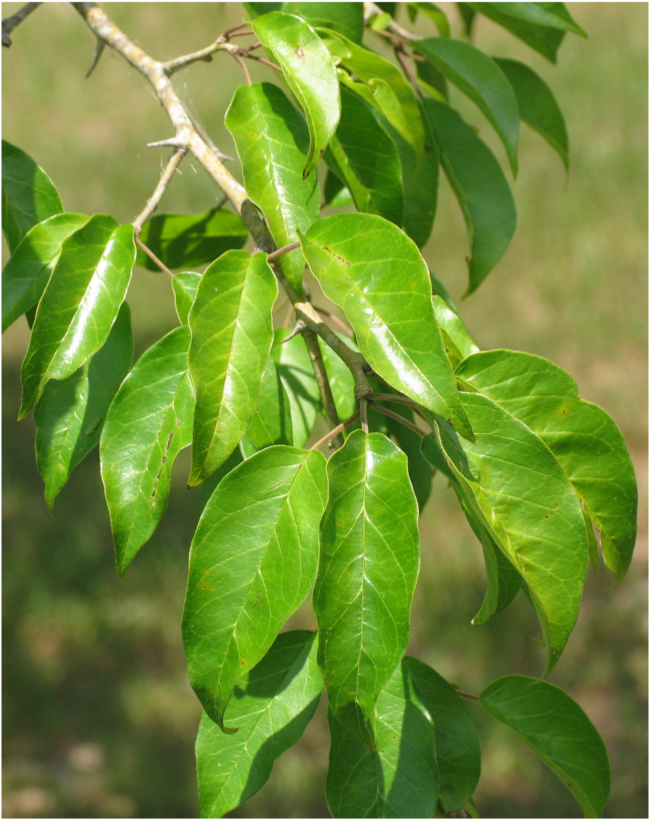
Figure 4: Osage-orange leaves, zig-zag twig form, and thorns.