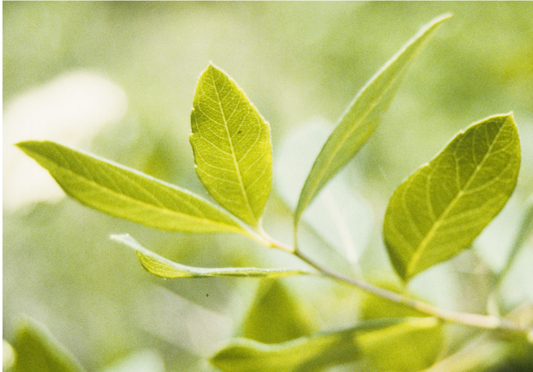
Leaves.