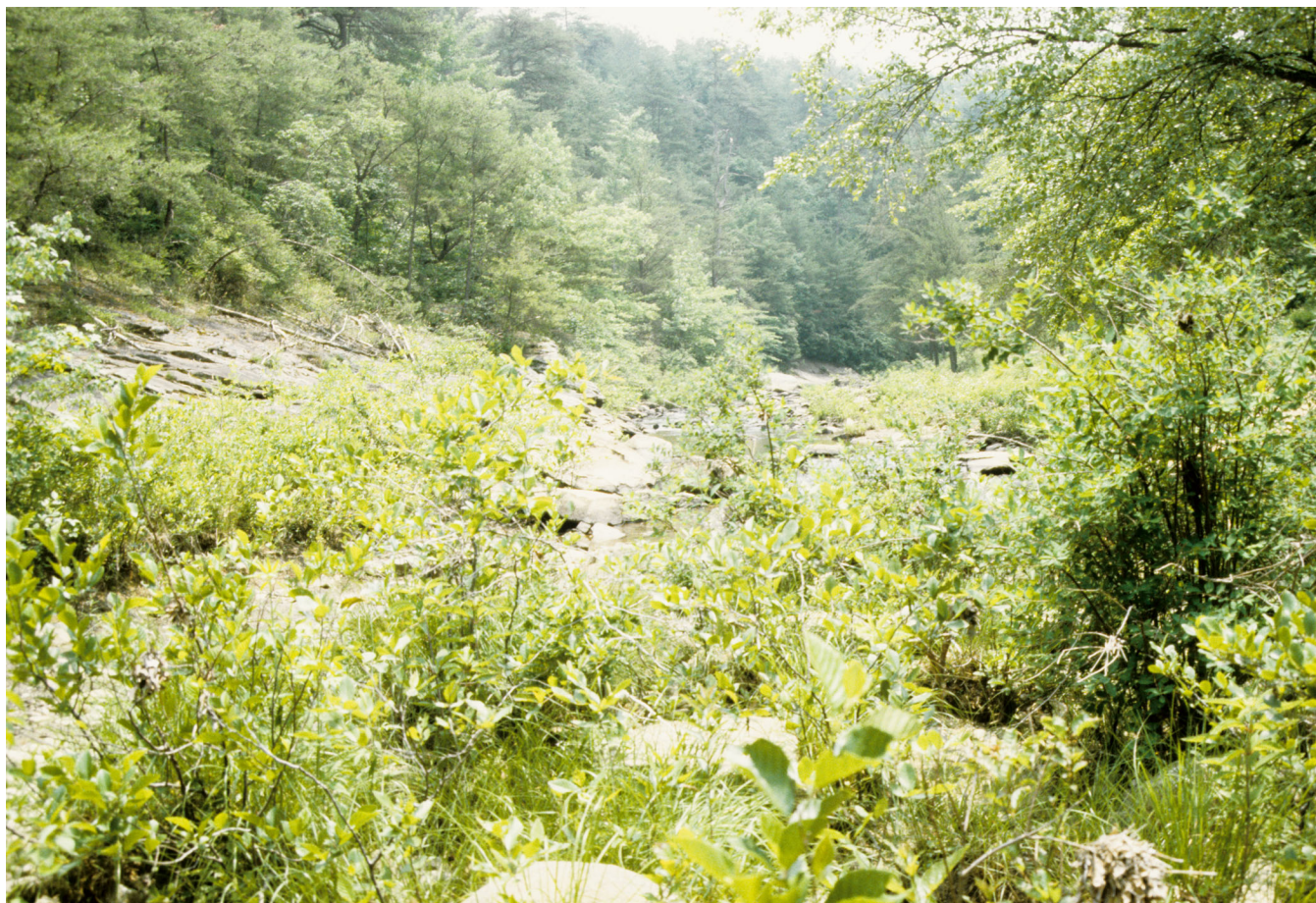
Habitat view.