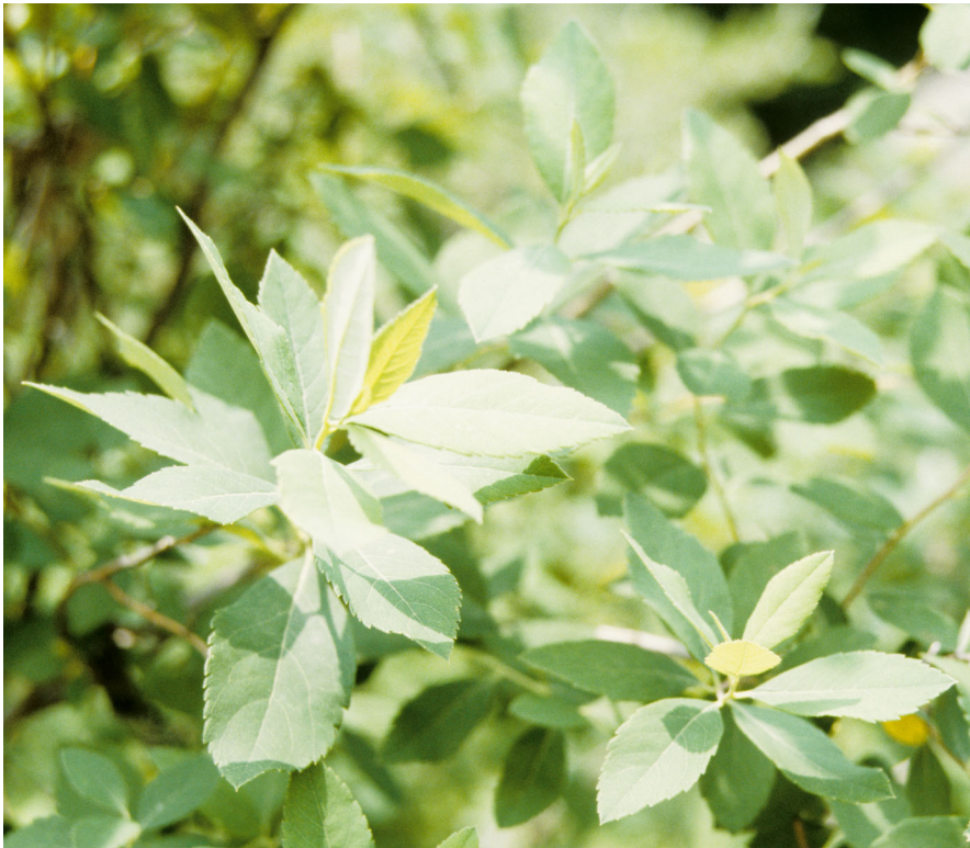
Shoots and foliage.