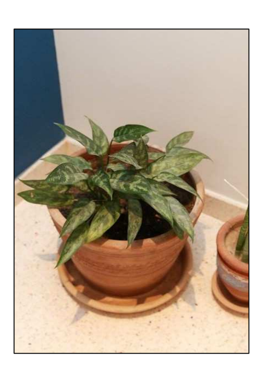
P-01 "Chinese evergreen" (Aglaonema commutatum)

The Chinese evergreen is from the Aglaonema genus which also branches out to many hybrid varieties. This plant can be maintained within low light conditions. If the plant is placed in high light conditions, it is suggested to dry down the potting mix to ½ to ¾ of the way out before watering. In contrast, in a low light condition it is suggested to allow the soil to dry out completely in between watering. It should not be overwatered. The soil to be used could either perlite or sand to improve the drainage.