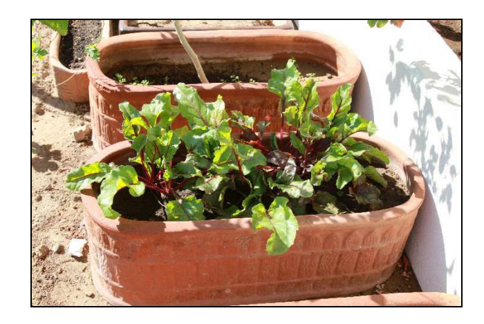
"Eggplant" (Solanum melongena)

The Roselle plant is a tall tropical, red and green shrub that is an excellent addition to the garden for its colorful bloom. It a short-day plant that usually grows tropical and subtropical conditions. The small leaves can be a good addition to fresh salads. You can also make use of the leaves to make a jam or a refreshing tea. The mature Roselle plant are can resist dry conditions but watering should be required during dry periods to maintain the soil moisture to avoid the wilting of the leaves.