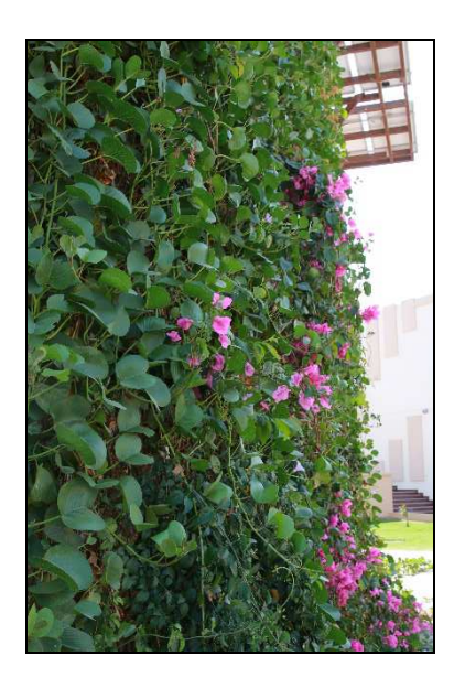
"Bougainvillea" (Bougainvillea spp.)

The Jasmine is a popular plant I warmer climates for its exotic fragrance. It is also noted for its herbal properties. The plant have a variety of species as a vine, a bush and some are evergreen. The bush type is considered a good landscape specimen with different scented blooms. The plant is sensitive to dryness in which humidity plays and important role in the surroundings. The plant should be watered only when the top half inch of the potting mix is dry allowing it to be moist at times but not soggy.