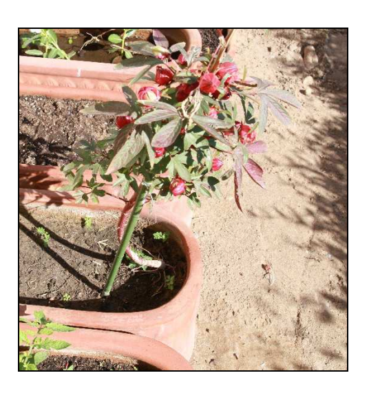
"Roselle" (Hibiscus sabdariffa)

The Roselle plant is a tall tropical, red and green shrub that is an excellent addition to the garden for its colorful bloom. It a short-day plant that usually grows tropical and subtropical conditions. The small leaves can be a good addition to fresh salads. You can also make use of the leaves to make a jam or a refreshing tea. The mature Roselle plant are can resist dry conditions but watering should be required during dry periods to maintain the soil moisture to avoid the wilting of the leaves.