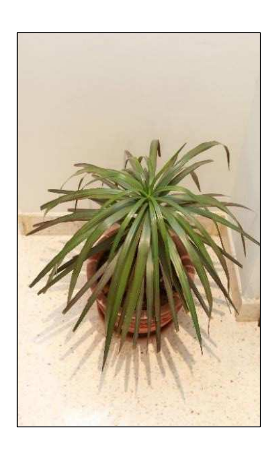
P-03"Dragon tree" (Dracaena marginata)

The Dragon tree came from a large species of the genus Dracaena with many distinct variations. This variations involves the leaf colors, leaf sizes and even the trunk types. It is advised to keep the soil moist at all times for this plant. It should also be watered moderately during growth season and less during winter season. Areas with bright conditions is suitable for the plant. Exposure to direct sunlight might damage its leaves.