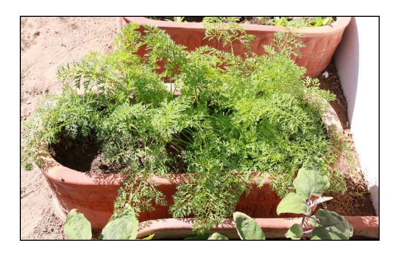
"Parsley" (Petroselinum crispum)

a perennial vegetable that is usually cultivated as an annual. The plant can be differentiated in size, shape and color of the fruits. Eggplants survive in tropical and subtropical areas in which it requires high temperatures. Frequent watering of the plant is necessary. A supply of moisture should be monitors but do not make the soil soggy. It is also suggested that the use of drip systems are ideal for the plant.