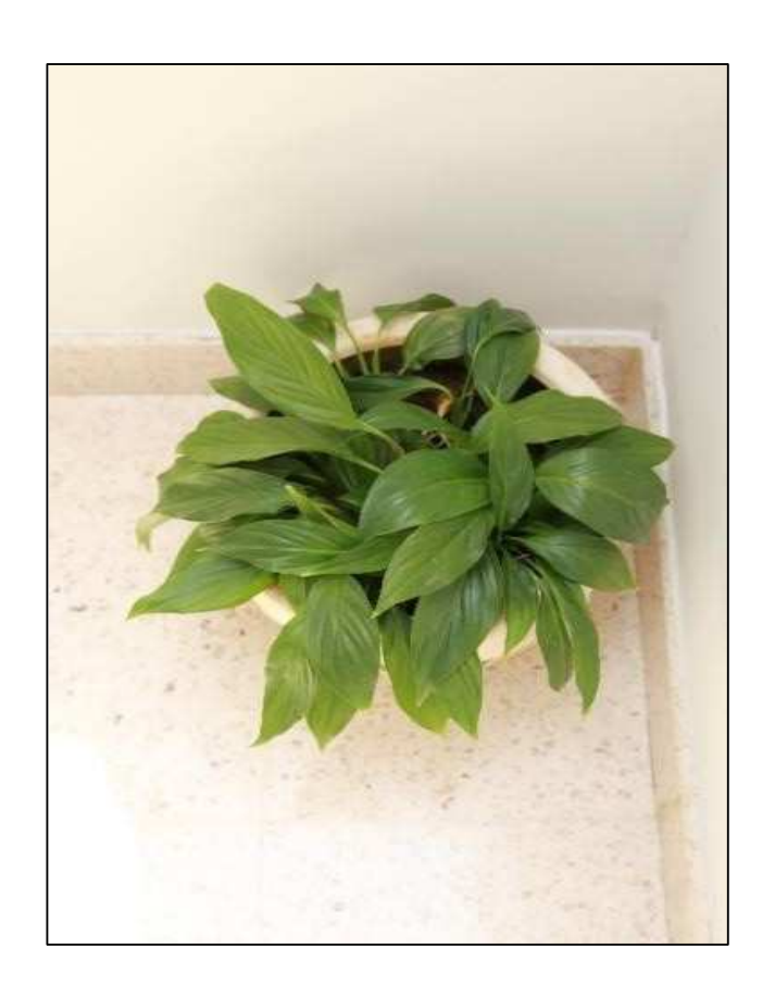
P-05 "Aglaonema" (Aglaonema Modestum)

Aglaonema modestum is one of the members of the Aglaonema genus which is a foliage type plant. It has a lance-shaped and waxy green leaves. This plant is best indoors, since it has grown a useful foliage rather than flowers. It is recommended to water the plant moderately in its active growth stage but allowing the 2-3 centimeters of the soil to dry in between the waterings.