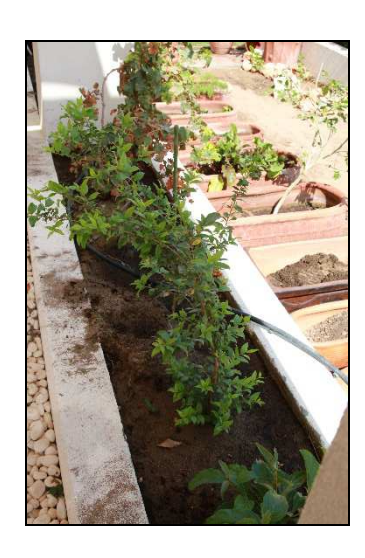
"Jasmine" (Jasminum polyanthum)

The Jasmine is a popular plant I warmer climates for its exotic fragrance. It is also noted for its herbal properties. The plant have a variety of species as a vine, a bush and some are evergreen. The bush type is considered a good landscape specimen with different scented blooms. The plant is sensitive to dryness in which humidity plays and important role in the surroundings. The plant should be watered only when the top half inch of the potting mix is dry allowing it to be moist at times but not soggy.