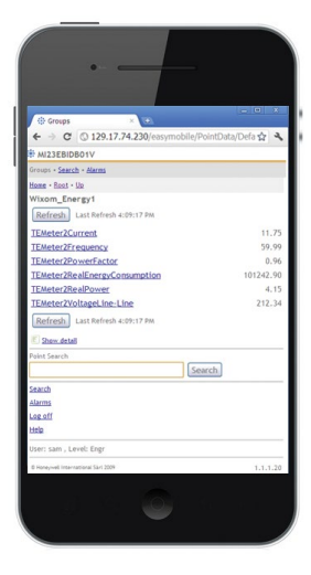
Honeywell EasyMobile Application