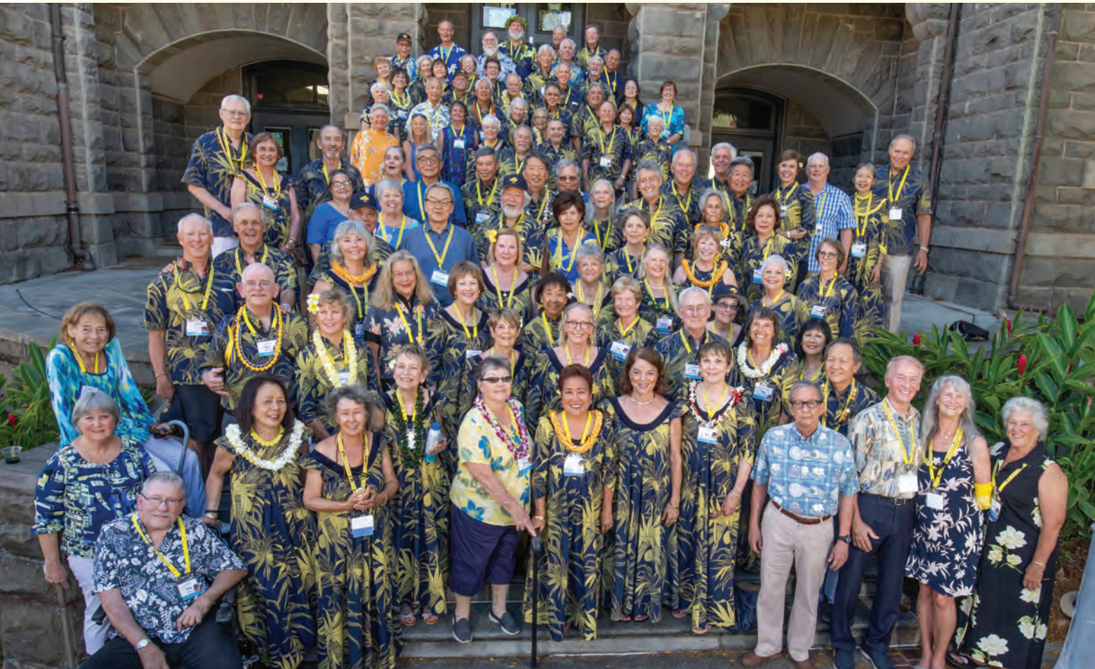
CLASS OF 1964 - 55TH REUNION