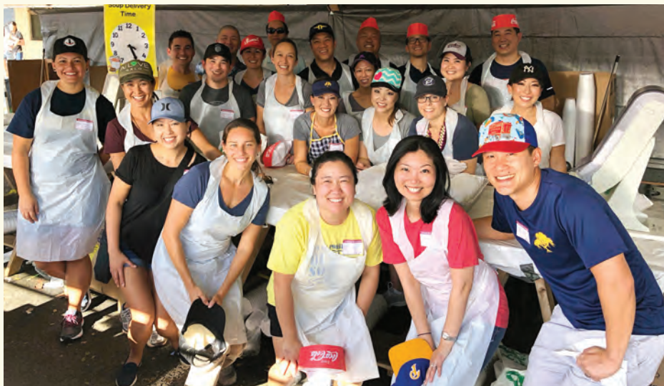
Class of '97 came together at Carnival to serve it up at the Portuguese Bean Soup booth!

Any classmates announcing their marriage, move or name change – please make sure you update your name and contact information on the Punahou website and send us a picture and an update.