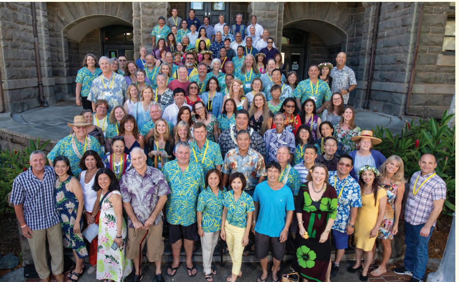
CLASS OF 1979 - 40TH REUNION