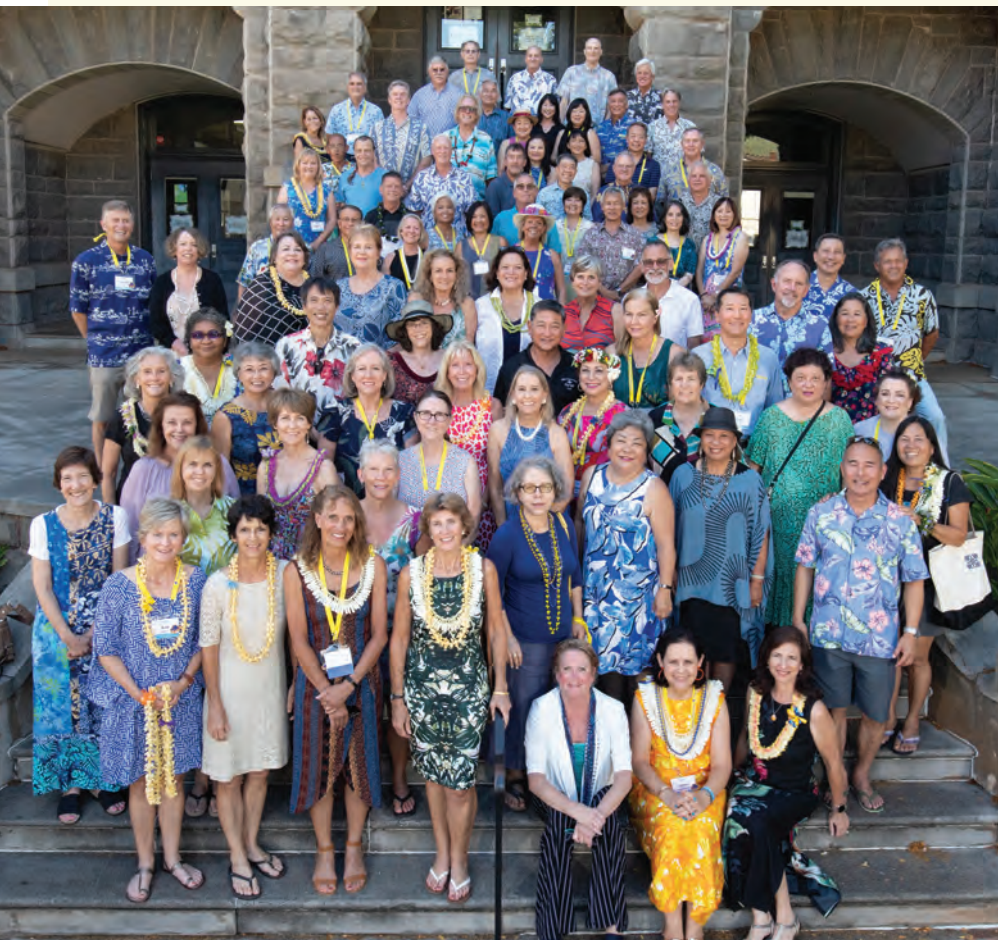
CLASS OF 1974 - 45TH REUNION