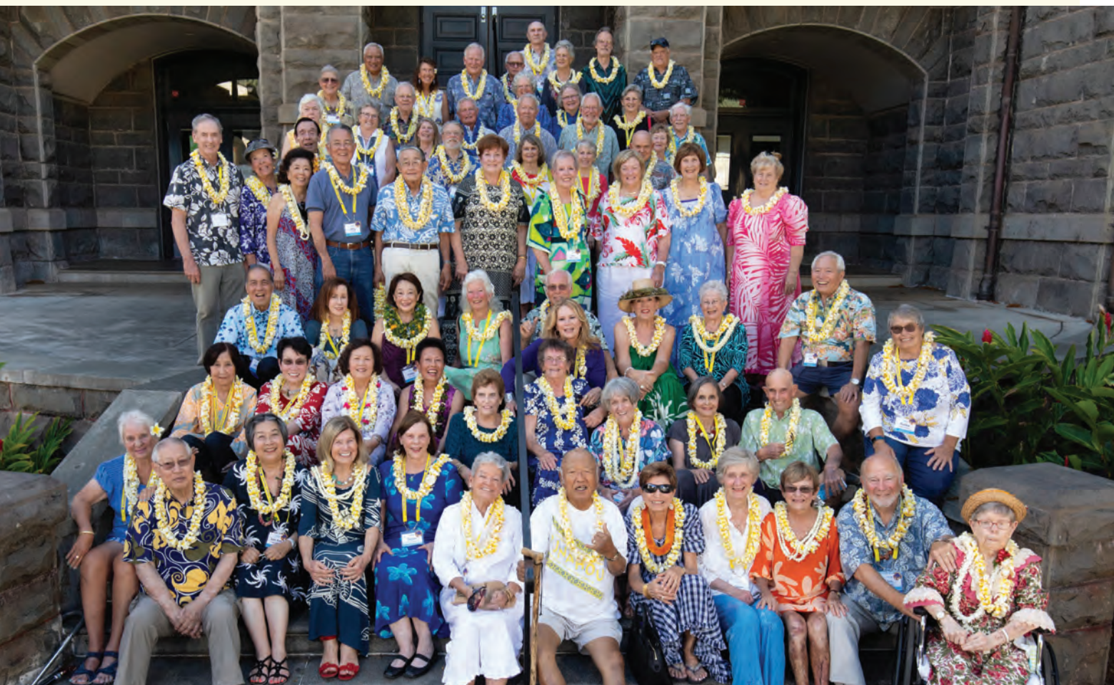
CLASS OF 1959 - 60TH REUNION