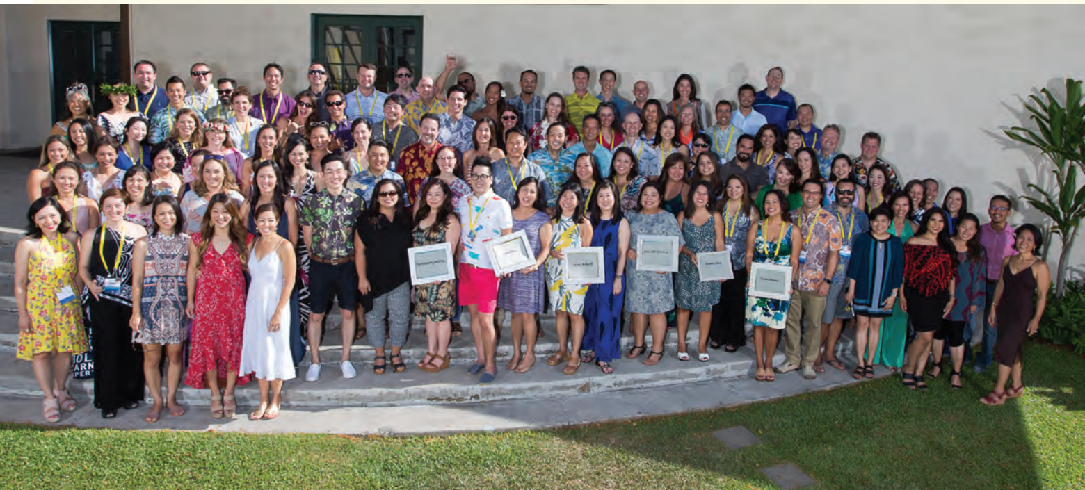
CLASS OF 1994 - 25TH REUNION