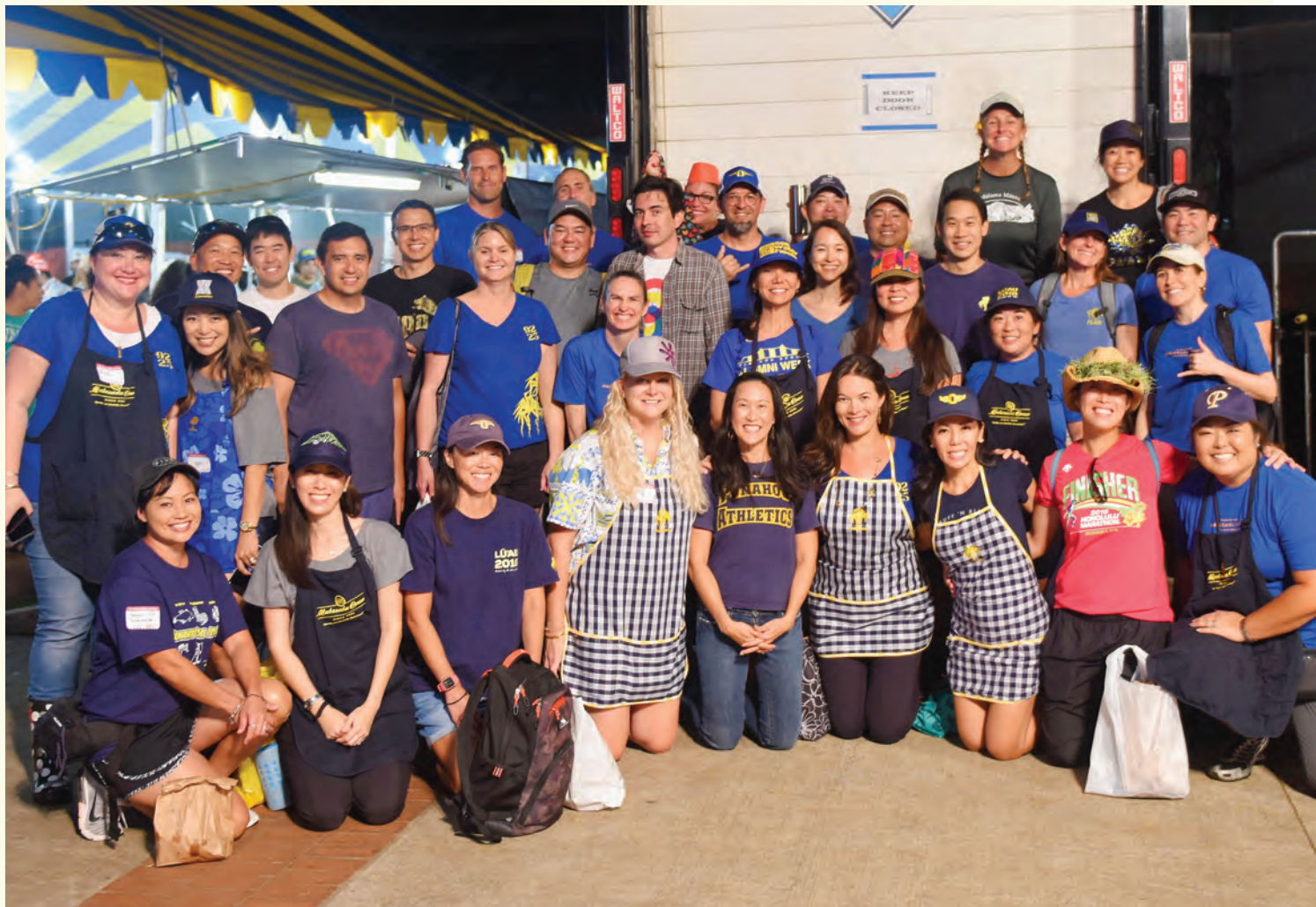
Class of '92 had a great turnout for their Malasada crew!