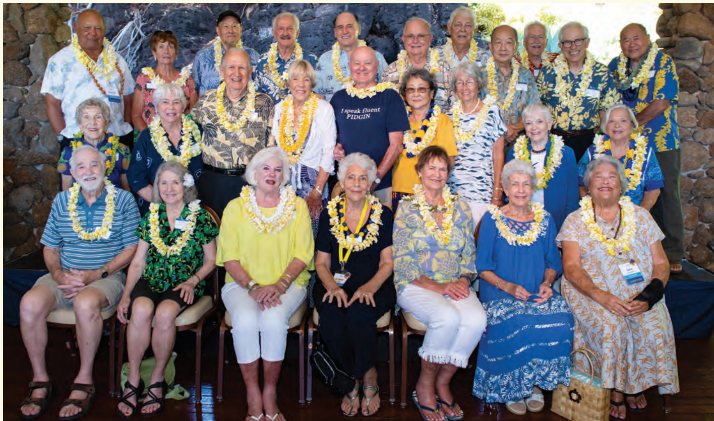
CLASS OF 1954 - 65TH REUNION