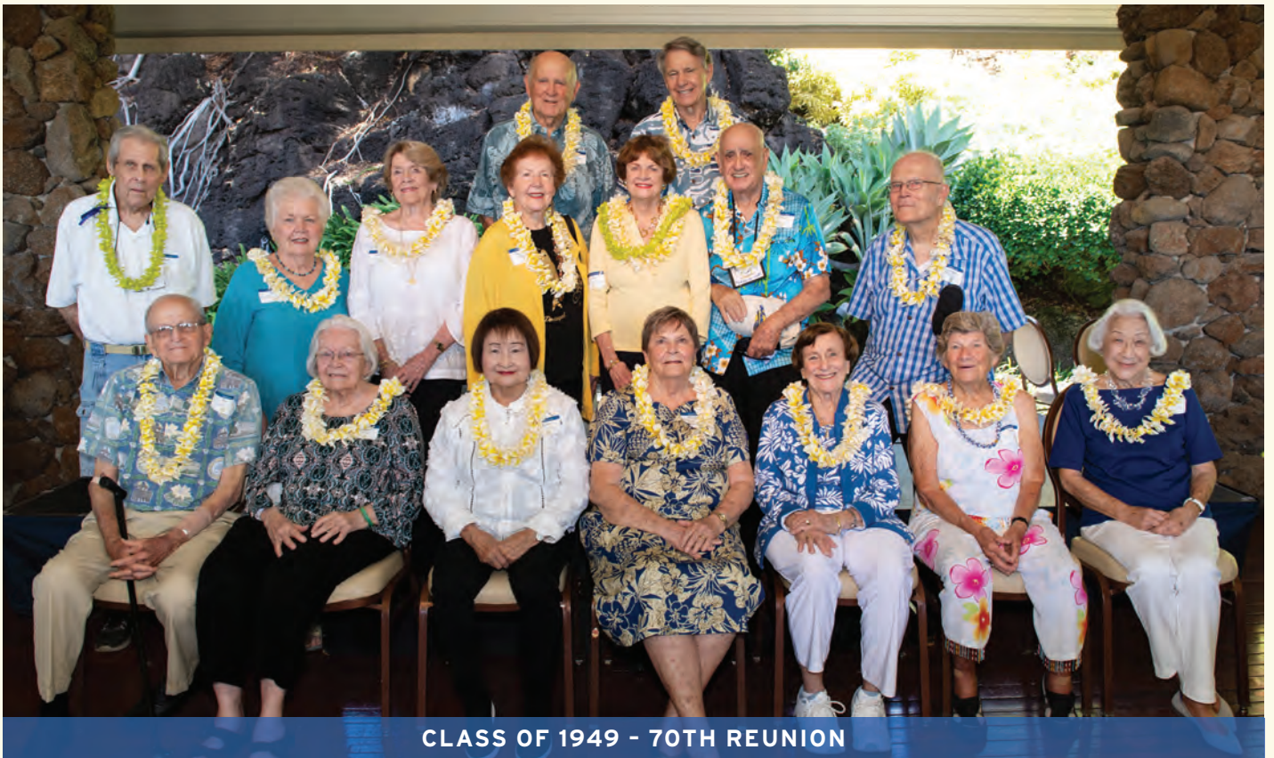
CLASS OF 1949 - 70TH REUNION