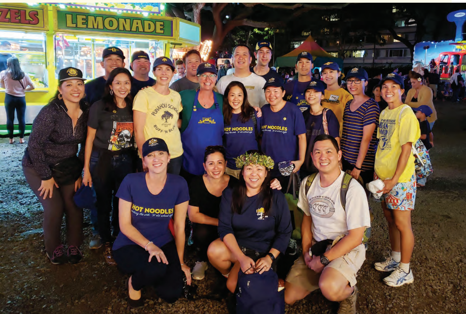
Class of '91 together again at Carnival 2019 after their Hot Noodles booth shift.

Please let us know if there is anything you would like to share in the next Bulletin! Until then, let the 30th Reunion planning begin!