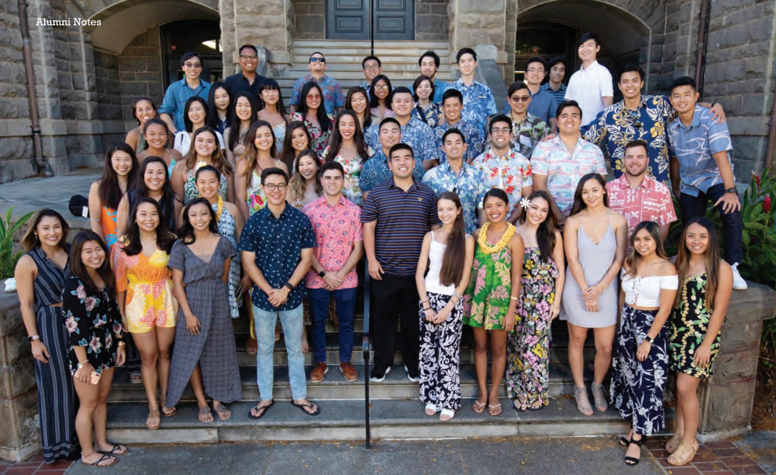
CLASS OF 2014 - 5TH REUNION