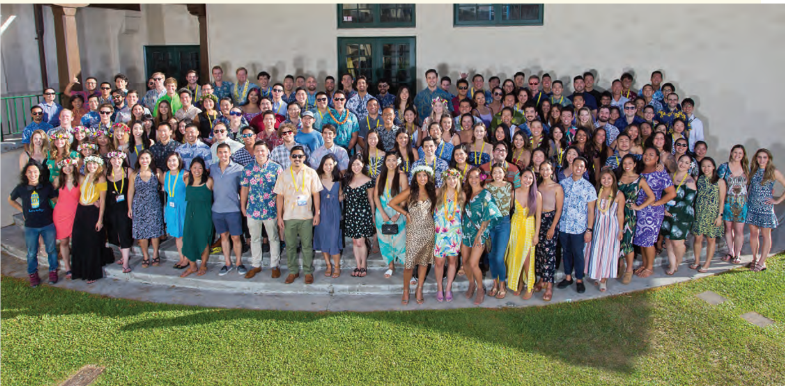
CLASS OF 2009 - 10TH REUNION