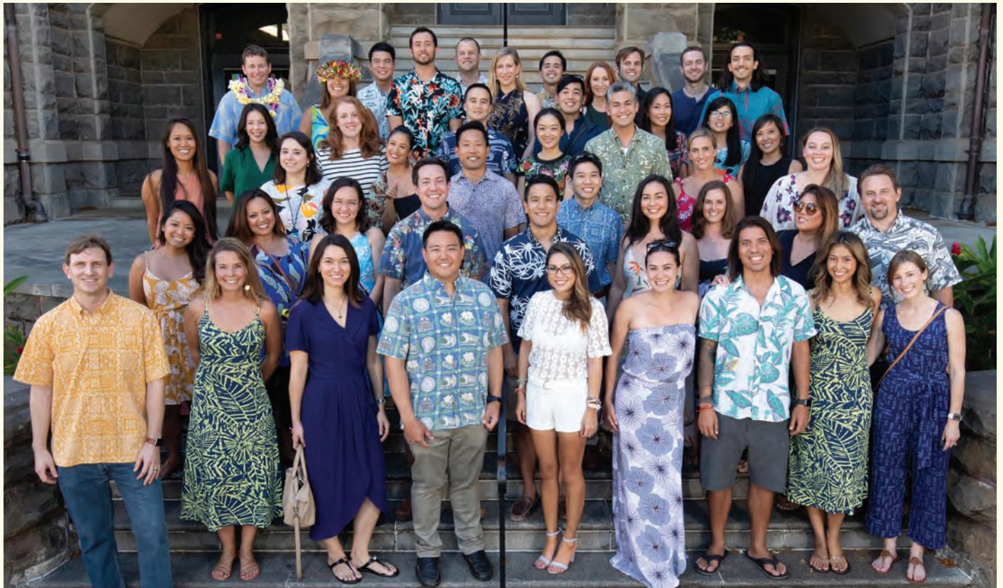
CLASS OF 2004 - 15TH REUNION