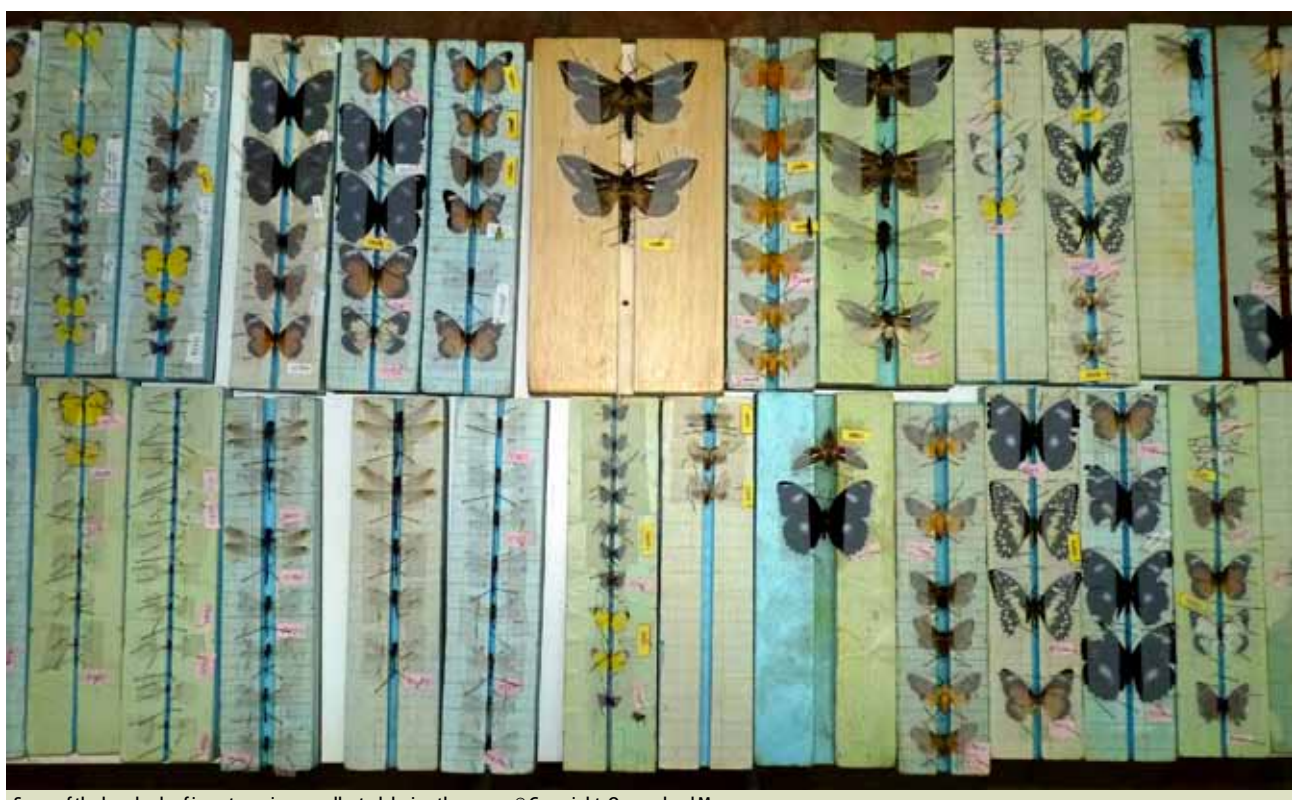
Some of the hundreds of insect specimens collected during the survey

Appendix A provides complete and up-to-date species lists for each reserve. Names in brown bold text are putative new species. Species marked with an asterisk (*) have not been recorded previously. Those without an asterisk have been recorded previously and were identified again during this survey. Species known from previous records but not recorded during this survey are marked with a blue square. Table 4 provides a summary of the number of new records and putative new species for each reserve. Table 5 provides a summary of the number of species recorded in each reserve by taxonomic group.