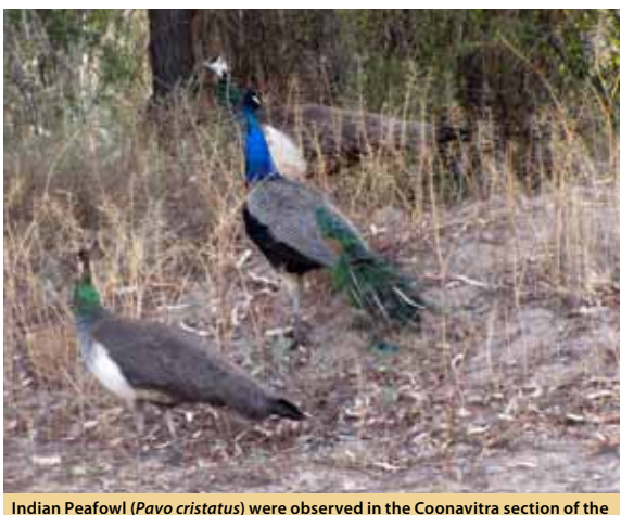
ndian Peafowl ( Pavo cristatus ) were observed in the Coonavitra section of the aroo-Darling National Park

Exotic animals recorded in the Toorale reserves included European Cattle ( Bos taurus ), Goat ( Capra hircus ), Sheep ( Ovis aries ), Fox ( Vulpes vulpes ), Rabbit ( Oryctolagus cuniculus ), Brown Hare ( Lepus capensis ), House Mouse ( Mus musculus ),