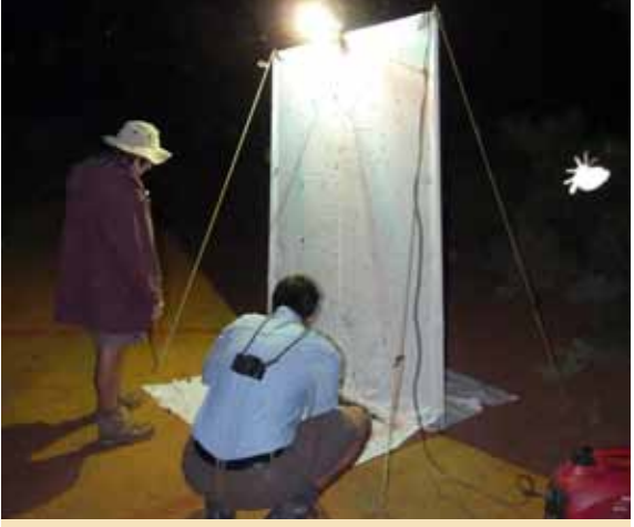
A mercury vapour light trap, used to catch nocturnal flying insects