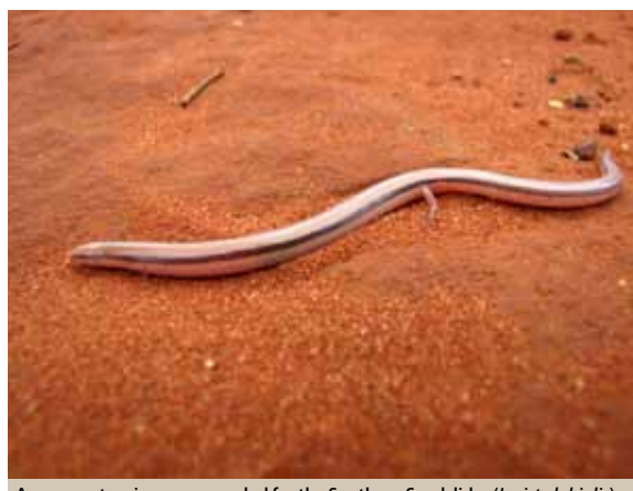
A range extension was recorded for the Southern Sandslider ( Lerista labialis ) at Toorale National Park

Extreme weather conditions prevented access to large areas of the reserves. As much work as possible was done and some areas were surveyed with reasonably high intensity. However, the catastrophic fire conditions meant animals were relatively inactive during the very hot and dry conditions, significantly affecting the number of animals seen. Conversely, where access was possible floods provided very good opportunities to locate frogs and several additional species were found.