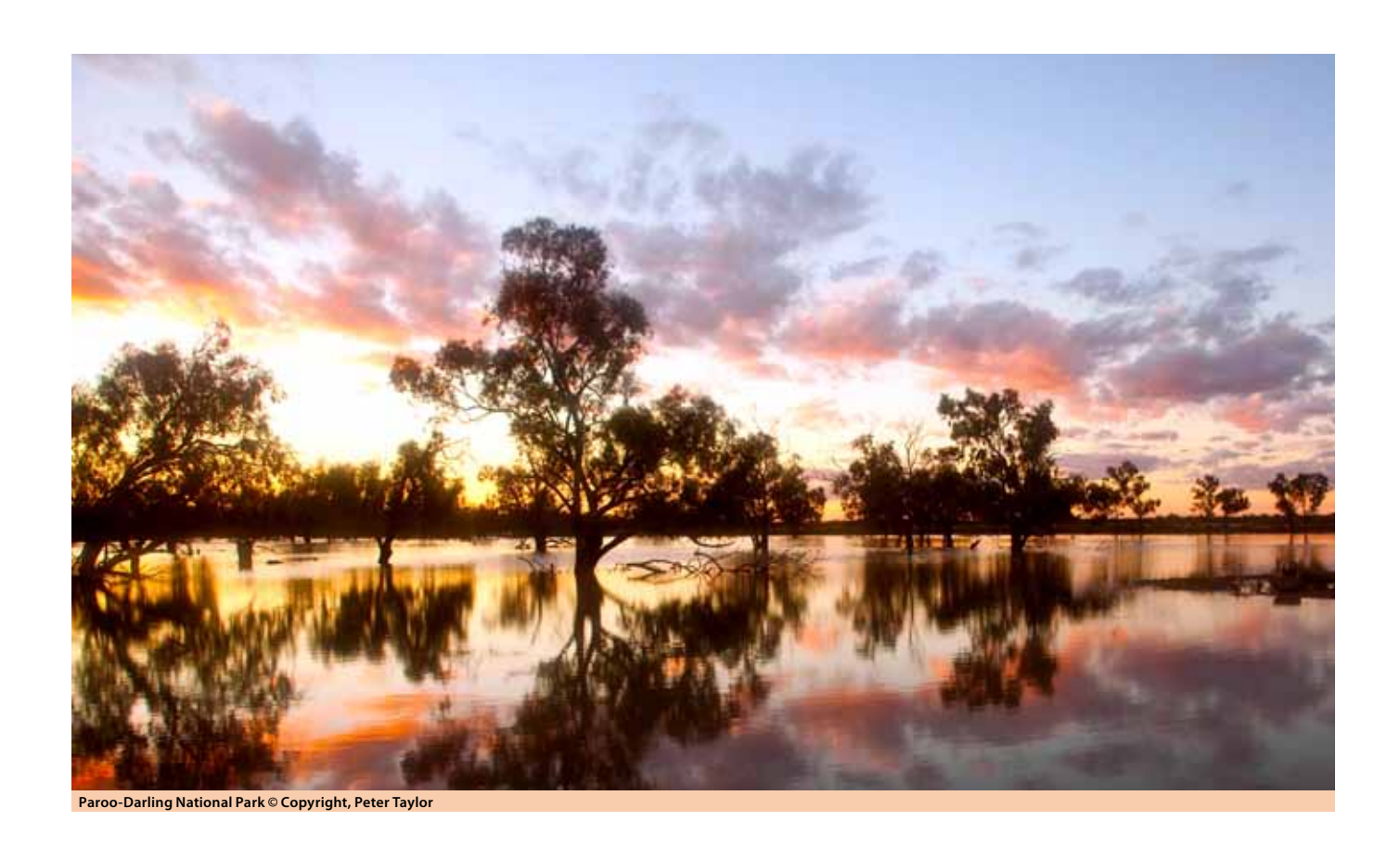
North-western NSW and southern Qld 2009–2010