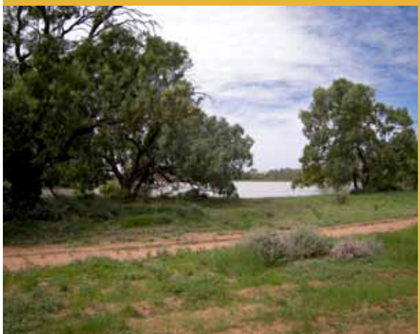
Toorale National Park

30,866 ha (national park) and 54,385 ha (conservation area)