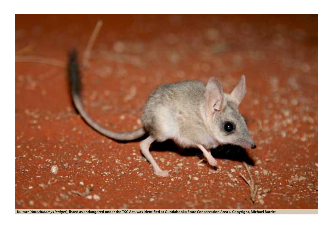
13 Chapman, A. D. 2009, Numbers of Living Species in Australia and the World , 2<sup>nd</sup> edn, Australian Biological Resources Study, Canberra, 80pp.

Kultarr (Antechinomys laniger) and the Little Pied Bat (Chalinolobus picatus) were recorded in Gundabooka National Park; these are listed respectively as endangered and vulnerable under the TSC Act. The Little Pied Bat was also recorded in the Coonavitra section of Paroo-Darling National Park. The Red-tailed Black Cockatoo (Calyptorhynchus banksii samueli), Major Mitchell's