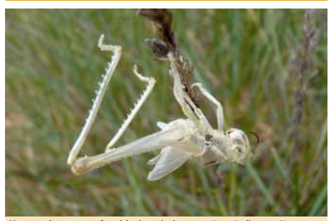
Many grasshoppers were found dead attached to vegetation at Ledknapper Nature Reserve, probably due to fungal attack