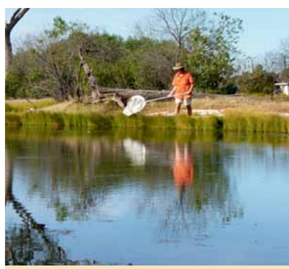
Many dragonflies and damselflies were collected using a net from an open bore at Ledknapper National Park

A number of taxonomic groups were identified as targets for study. Table 2 shows the target groups surveyed and the specialists who undertook the fieldwork.