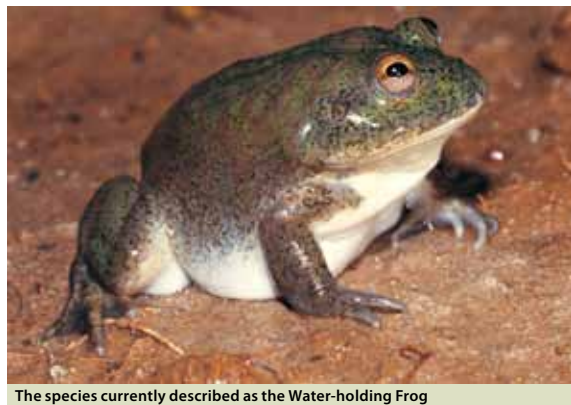
The species currently described as the Water-holding Frog (Cyclorana platycephala) might actually be two species

The following putative new invertebrate species were documented during the study: 1 scarab beetle ( Onthophagus n. sp. NSW1) collected from Culgoa Floodplain National Park and Ledknapper Nature Reserve; 1 cicada ( Tamasa n. sp. BushBlitz) collected from Ledknapper Nature Reserve; 6 true