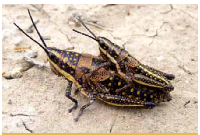
The central race of the Blistered Pyrgomorph ( Monistria pustulifera ) is one of four to be described

Twelve species and five genera of damselflies and dragonflies were recorded from adults and larvae collected by sweep netting and dip netting; all were new records for the reserves. The Blue Skimmer (Orthetrum caledonicum) dragonfly and the Wandering Ringtail (Austrolestes leda) damselfly were the most abundant. The Aurora Bluetail (Ischnura aurora) damselfly and the Red and Blue Damsel (Xanthagrion erythroneurum) were abundant as larvae but no adults were collected. The species collected were typical of inland semi-arid environments. As they depend on water, these species are often very mobile and are able to fly long distances between temporary water sources.