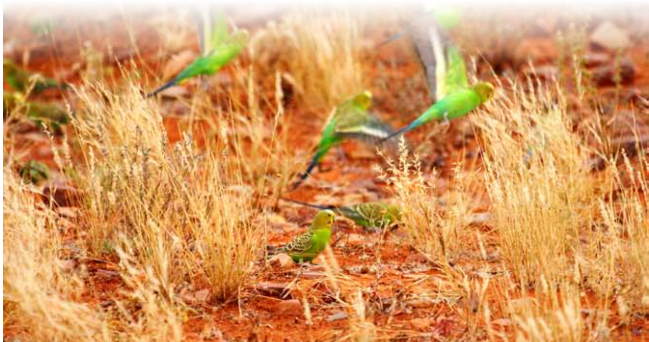
Flying budgerigars ( Melopsittacus undulatus ), At A Glance Pty Ltd © Copyright, Department of the Environment

Twenty-three weeds were documented in Ginghet Nature Reserve and 11 in Mount Grenfell Historic Site, all new records for these reserves. Hairy Carpet Weed ( Glinus lotoides ) was a new record for Gundabooka National Park. Four of the weeds recorded during this study are listed under the Noxious Weeds Act 1993 of New South Wales.