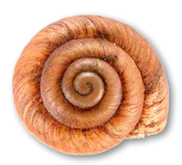
At some sites there appeared to be localised extinction of the widespread Dubbo Woodland Snail ( Galadistes alleni ), with only bleached shells observed

Western New South Wales is a hostile environment for molluscs due to the local climate, habitat alteration through land clearance and the impact of stock and feral animals. At some sites there appeared to be localised extinction of the widespread Dubbo Woodland Snail ( Galadistes alleni ), with only bleached shells eroding out of topsoil observed. This was most apparent in the Coonavitra addition to Paroo-Darling National Park. It is possible that this species still exists where intact woodland remains. The Dubbo Woodland Snail is present in Gundabooka National Park,