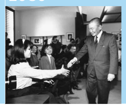
Prime Minister Noboru Takeshita