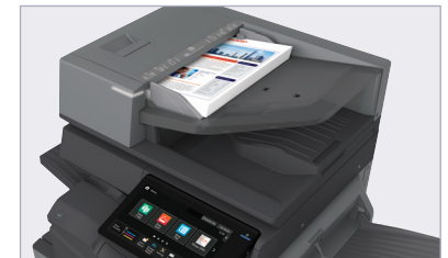
High capacity 300-sheet DSPF scans documents at up to 280 images per minute.