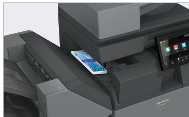
New Inner Folding Unit option offers a variety of fold patterns, including tri-fold, z-fold and others.