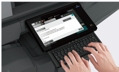
Built-in retractable keyboard simplifies email address and subject line entries.