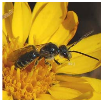
Sweat Bee ( Halictus sp.)