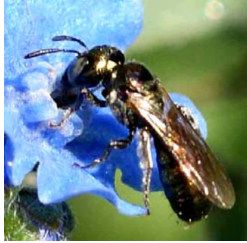
Small Carpenter Bee ( Ceratina sp.)