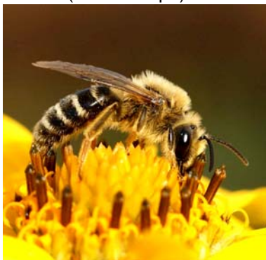
Mining Bee (M) ( Andrena sg Callandrena )