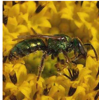
Green Sweat Bee ( Augochlorella sp.)