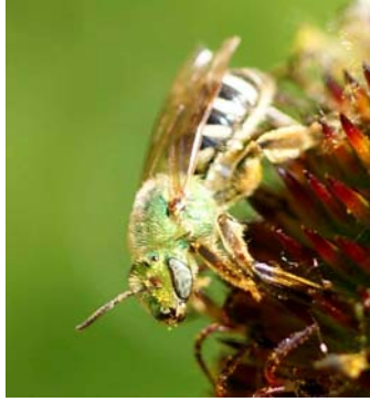
Metallic Green Bee (F) ( Agapostemon coloradinus or virescens )