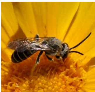
Sweat Bee (M) ( Halictus rubicundus )