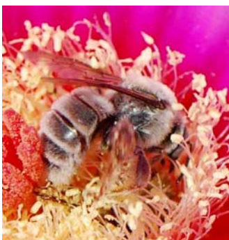
Cactus Bee ( Diadasia sp.)