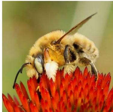
Leaf Cutter Bee (M) ( Megachile sg Xanthosarus )