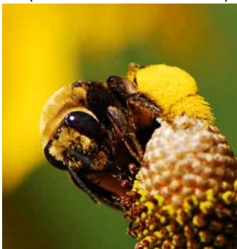
Long-Horned Bee (F) ( Svastra sp.)