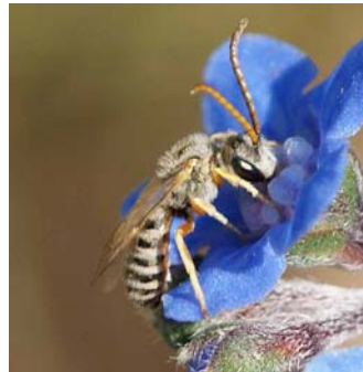
Sweat Bee (M) ( Halictus confusus arapahonum )