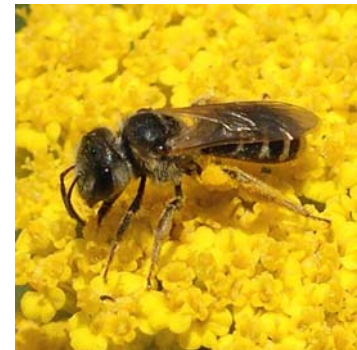
Sweat Bee (F) ( Halictus ligatus )