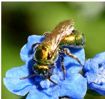
Green Sweat Bee ( Augochlorini tribe)