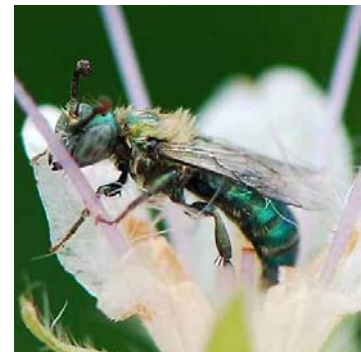
Mason Bee ( Hoplitis fulgida )