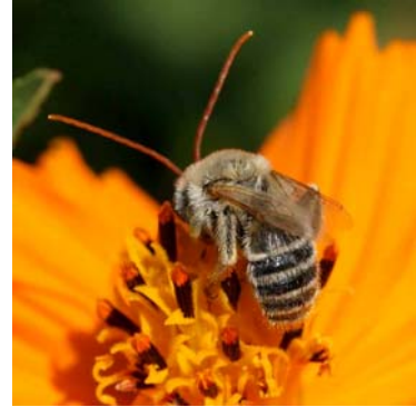
Long-Horned Bee (M) ( Melissodes sp.)