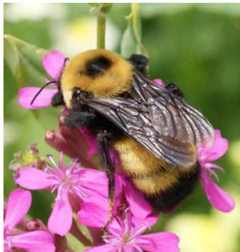
Black & Gold Bumble Bee ( Bombus nevadensis )