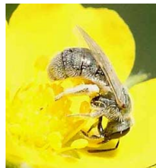
Sweat Bee ( Lasioglossum sp.)

Colletidae Family: Plasterer and Masked Bees →