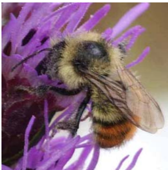
Bumble Bee ( Bombus centralis )