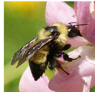
Southern Plains Bumble Bee ( Bombus fraternus )