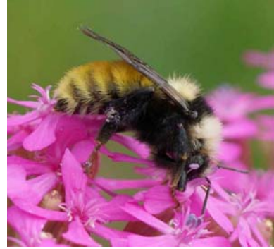
Bumble Bee ( Bombus appositus )