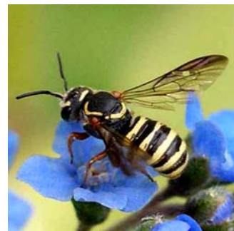
Cuckoo Bee ( Stelis sp.)