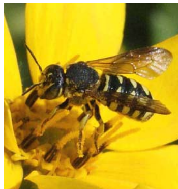
Resin Bee ( Dianthidium sp.)