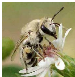
Cellophane Bee ( Colletes sp.)

Colletidae Family: Plasterer and Masked Bees →