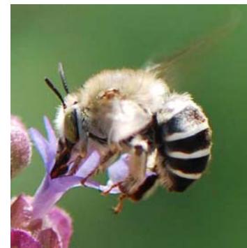
Digger Bee ( Anthophora sp.)