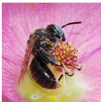
Globemallow Bee ( Diadasia sp.)