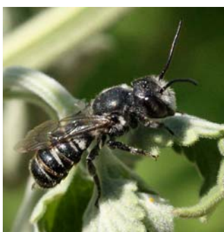
Leaf Cutter Bee (M) ( Megachile sg Chelostomoides )