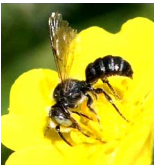
Mason Bee ( Hoplitis sp.)