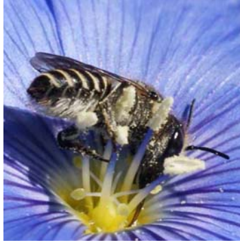
Leaf Cutter Bee ( Megachile sp.)