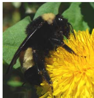
American Bumble Bee ( Bombus pensylvanicus )