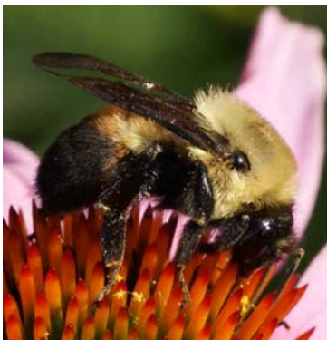
Brown Belted Bumble Bee ( Bombus griseocollis )