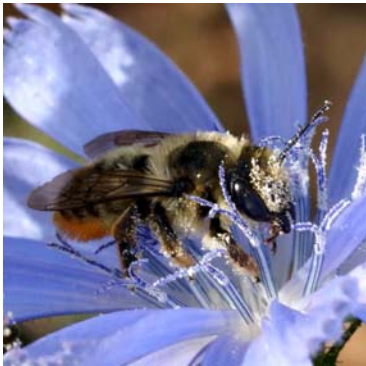
Leaf Cutter Bee ( Megachile sg Xanthosarus )