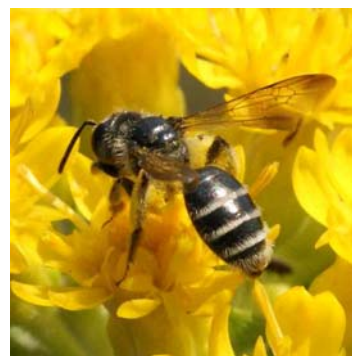
Mining Bee ( Andrena sg Cnemidandrena )