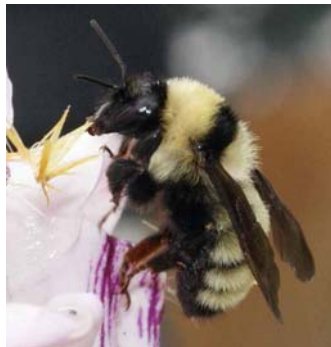
Golden Northern Bumble Bee ( Bombus fervidus )