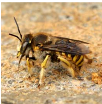
Wool Carder Bee ( Anthidium manicatum )