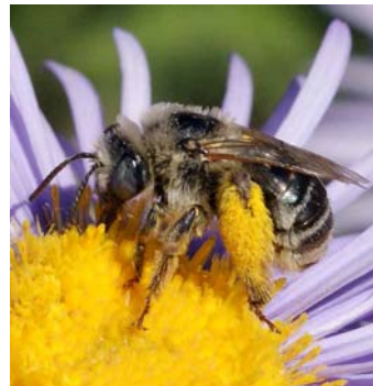
Long-Horned Bee (F) ( Melissodes sp.)