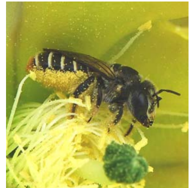
Leaf Cutter Bee ( Lithurgus apicalis )