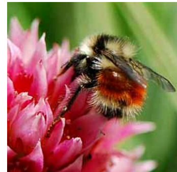
Mountain Bumble Bee ( Bombus sylvicola )