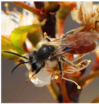
Mining Bee with red abdomen ( Andrena sp.)