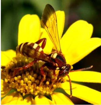
Cuckoo Bee ( Nomada sp.)