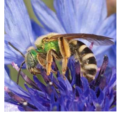
Metallic Green Bee ( Agapostemon sp.)