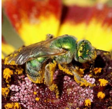
Metallic Green Bee (F) ( Agapostemon angelicus or texanus )