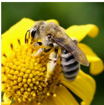
Mining Bee (F) ( Andrena sp.)