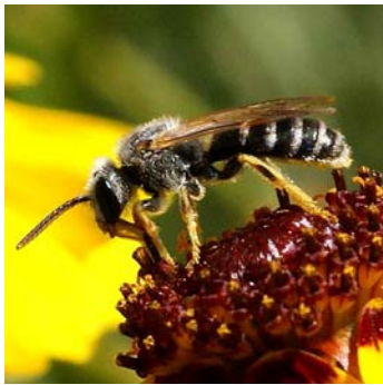
Sweat Bee ( Halictus sp.)