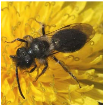
Black Mining Bee ( Andrena sp.)