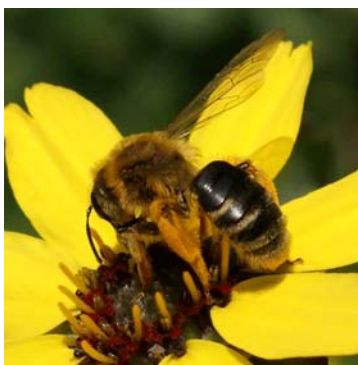
Mining Bee (F) ( Andrena helianthi )