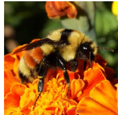
Hunt's Bumble Bee ( Bombus huntii )