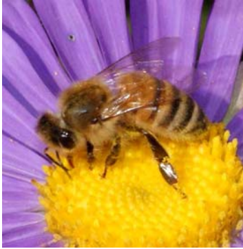
Honey Bee ( Apis mellifera )