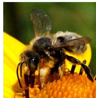
Leaf Cutter Bee (M) ( Megachile sp.)