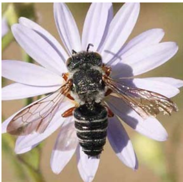
Cuckoo Bee ( Coelioxys sp.)