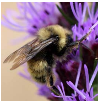
Western Bumble Bee ( Bombus occidentalis )