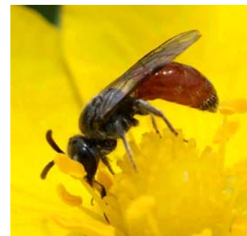
Sweat Bee ( Sphecodes sp.)