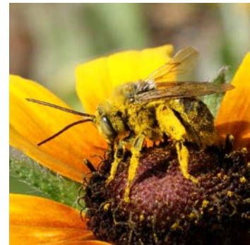
Long-Horned Bee (M) ( Svastra sp.)