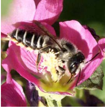
Leaf Cutter Bee (F) ( Megachile montivaga )