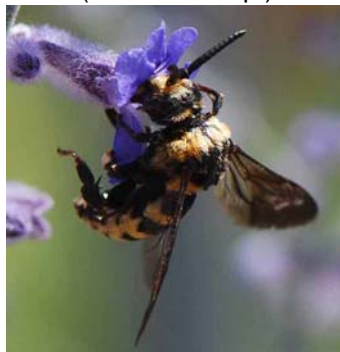
Cuckoo Bee ( Xeromelecta interrupta )