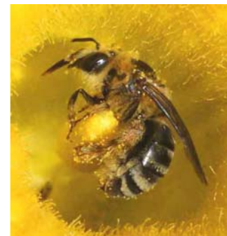
Squash Bee ( Peponapis pruinosa )