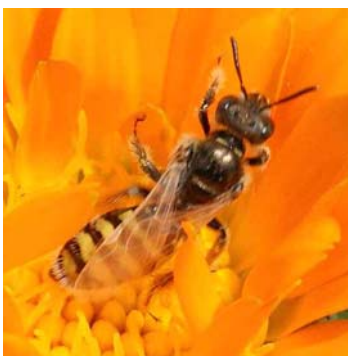
Mining Bee ( Perdita sp.)