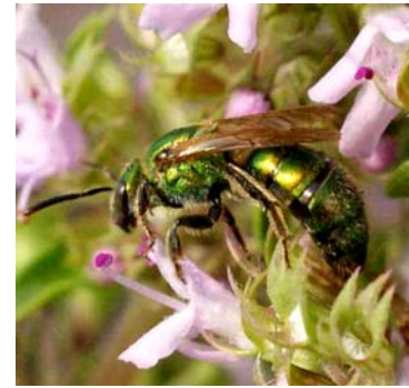
Green Sweat Bee ( Augochlorini tribe)