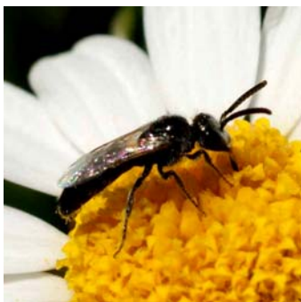
Sweat Bee ( Lasioglossum sp.)