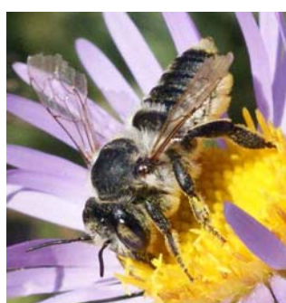
Leaf Cutter Bee (F) ( Megachile parallela )