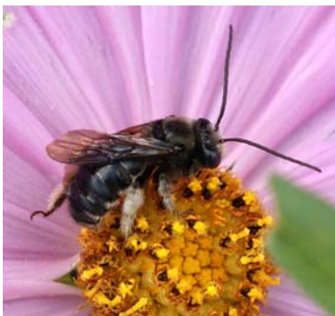
Black Long-Horned Bee (M) ( Melissodes bimaculata )