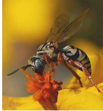
Cuckoo Bee ( Triepeolus sp.)