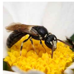
Masked Bee ( Hylaeus sp.)