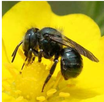
Mason Bee ( Osmia sp.)