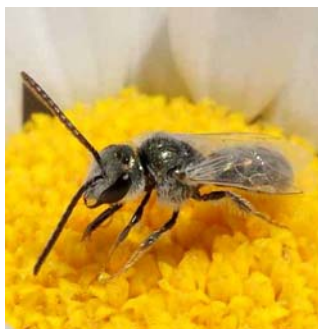
Sweat Bee (M) ( Lasioglossum semicaeruleum )