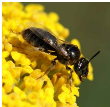
Mining Bee ( Pseudopanurgus sp.)

A close up of the head of Andrena showing the grooves on the inside of the eyes. This is a distinctive trait for this genus.