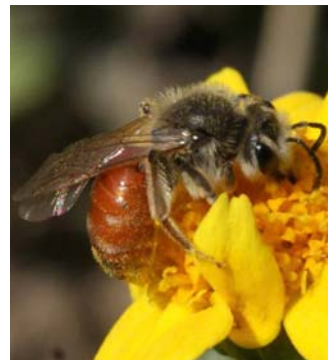
Mining Bee with red abdomen ( Andrena sp.)