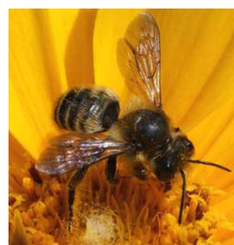
Leaf Cutter Bee (M) ( Megachile frugida )