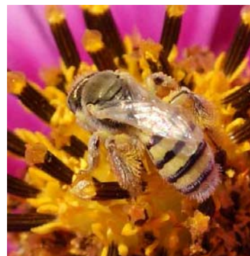
Mining Bee ( Perdita sg Cockerellia )