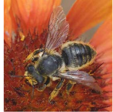
Leaf Cutter Bee ( Megachile perihirta )