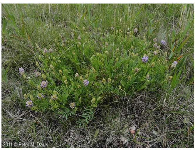
Prairie Milk Vetch

Statewide Wetland Indicator Status: • UPL