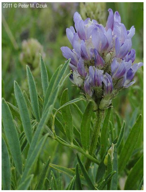
Community of plants

human benefits of Astragalus species, members of Astragalus have been used in Chinese medicine for a variety of conditions.