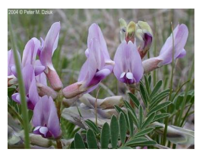
Ground Plum

Canada Milk Vetch ( Astragalus canadensis ) is more common that Prairie Milk Vetch in Minnesota and found all across the state. The flower clusters are longer, up to six inches, and are white to yellow-green in color. Leaflets have an elliptical shape and are wider, at least ½ inch wide and one and ¼ inch long. Fruit of Canada Milk Vetch is smooth compared to the hairy pods of Prairie Milk Vetch.