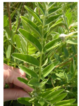
Canada Milk Vetch leaves

Ground Plum (Astragalus crassicarpus) can also resemble Prairie Milk Vetch, however the purplish flowers do not cluster as tightly and are individually ¾ inch long with two smaller lower petals. Leaflets are much smaller, up to ½ inch long and less than ¼ inch wide, in groups of 15-29. Once the plant fruits, the purple to reddish-purple plum-like pods are distinctive.