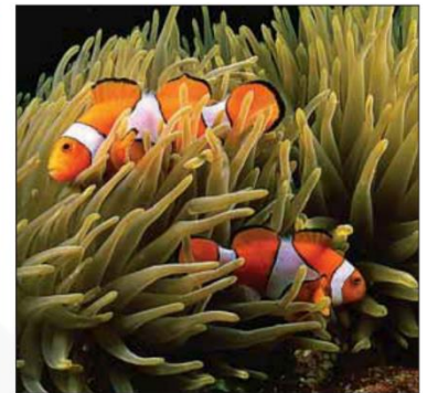
Figure 3. Oxpeckers on rhinoceros and clownfish between tentacles of sea anemone