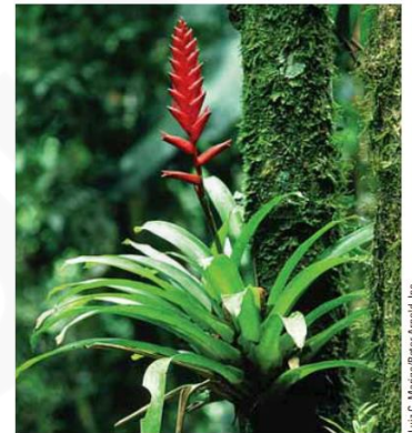
Figure 1. Bromeliad an epiphyte.

II. Interspecific Competition – The most common interaction between species is competition for limited resources. While fighting for resources does occur, most competition involves the ability of one species to become more efficient than another species in acquiring the essential resources.