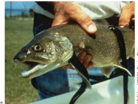
Figure 4. Mistletoe infested tree (right-side tree) and sea lampreys