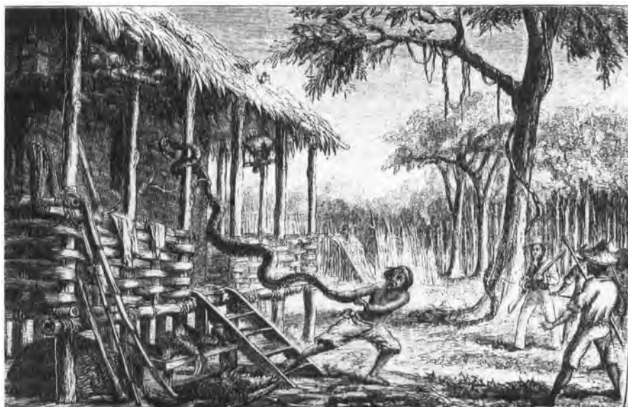
Illustration from Wallace's Malay Archipelago showing the capture of the snake from the roof of Wallace's hut: the skin is in the Society.

In an era when the 'Trail-Crisp Award' is well established, it is intriguing to see that we hold the original dies for the Trail and the Crisp Awards when both were separate. There are voting boxes, too, with the cork balls which were dropped into 'yes' or 'no' trays through an aperture in the side. I have catalogued seventeen inkwells, in crystal glass or pewter, and have re-discovered the Society's flag.