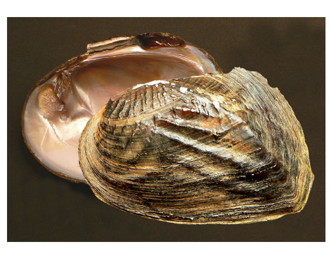
Bankclimber Plectomerus dombeyanus was also called white-eye mussel in the past and was one of the species that was taken for pearls in the 1909 pearl rush.