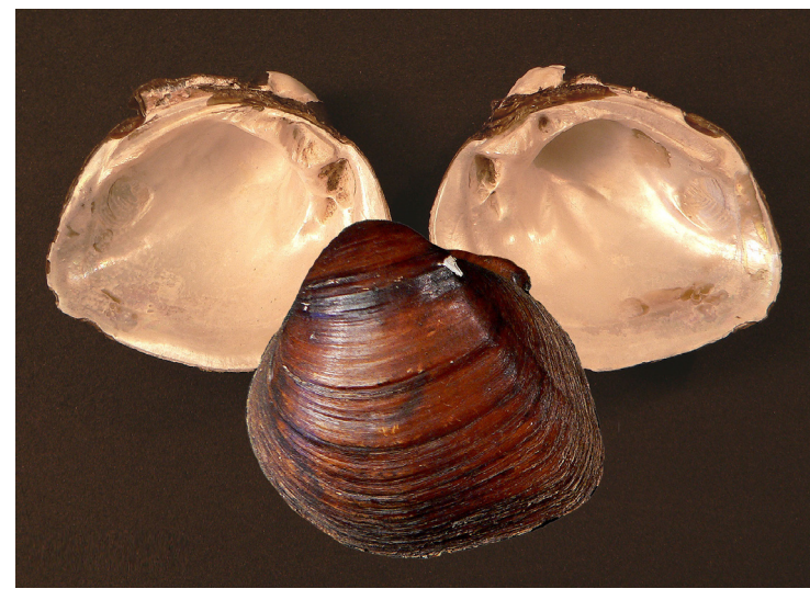
Louisiana pigtoe Pleurobema riddellii has not been reported in the Big Cypress since 1984 and is very rare elsewhere in Texas.