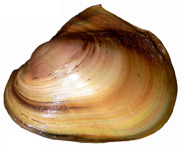
Fragile papershell Leptodea fragilis tolerates a wide array of different habitat types. The winglike structure over its back is called an ala.