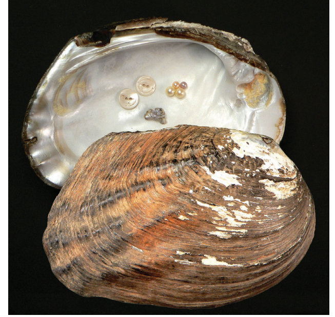
Washboard Megalonaias nervosa with mother-of-pearl buttons and freshwater spherical and baroque pearls.