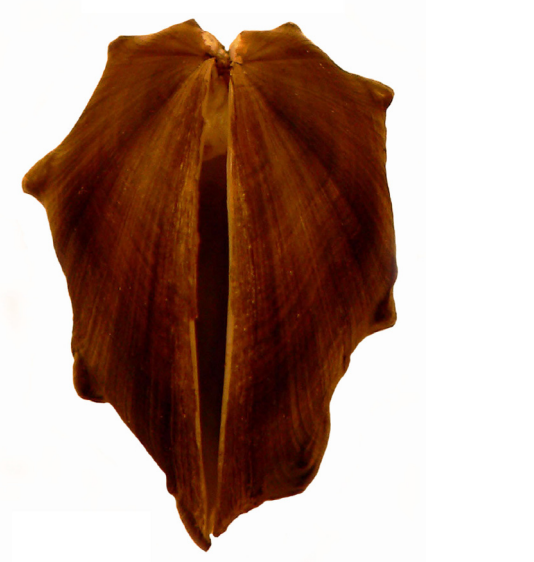
Threehorn wartyback Obliquaria reflexa is one of several area mussels with pustules on its shell, but the only species with pustules that alternate from side to side.