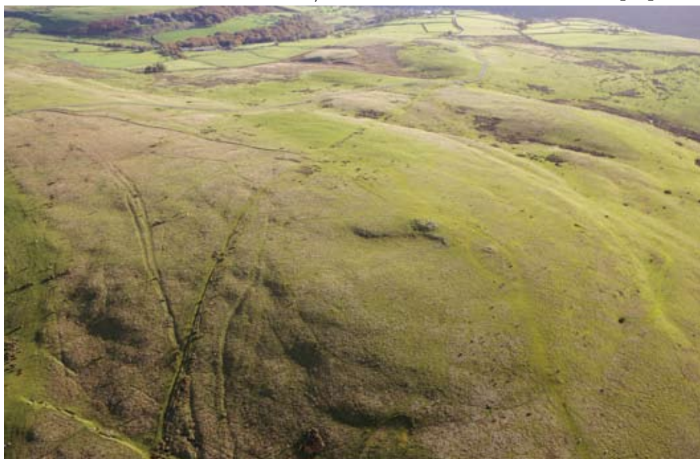
An aerial view of Pen Carnbugail from the north-west — Carn Bugail (4) is the prominent mound right of centre

Please be sure that you have stout footwear and suitable clothing before you set out on your walk. You may find a compass useful for determining general directions when walking between the individual sites. Remember to follow The Countryside Code.