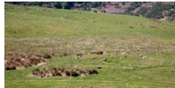
The stones that now lie flat around this Early Bronze Age ring cairn (5) would originally have stood upright

This site also belongs to the Early Bronze Age (2000–1450 BC). At first, Bronze Age people buried their dead with a few offerings to take to the other world — a beaker, some flint tools and, possibly, a bronze or copper dagger. Later, from about 1700 BC, they began to cremate their dead and bury