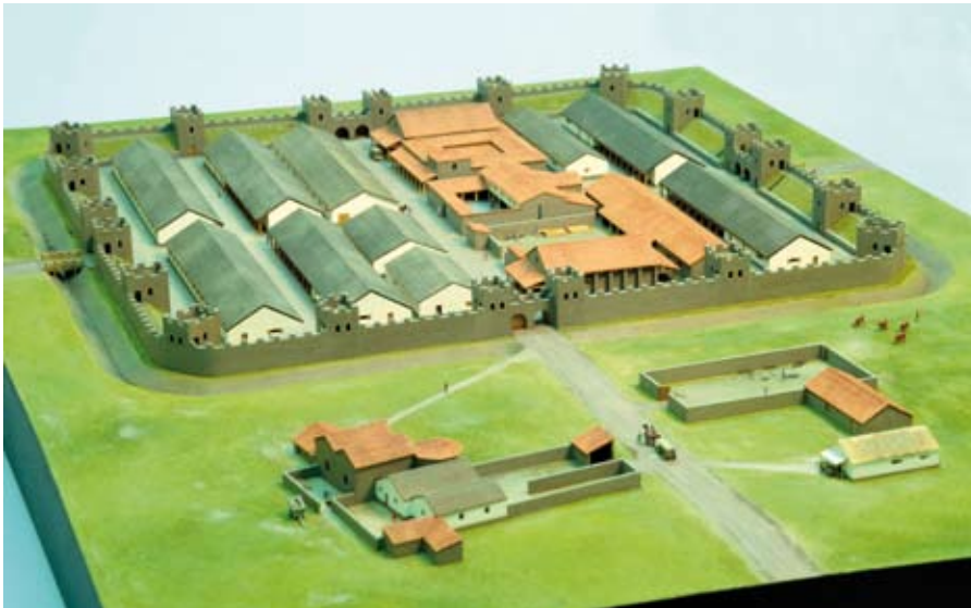
A model of the Roman fort at Gelligaer as it might have appeared in the early second century AD

(SO 106032) is a splendid ring-cairn (1) dating to the Early Bronze Age (2000–1450 BC).