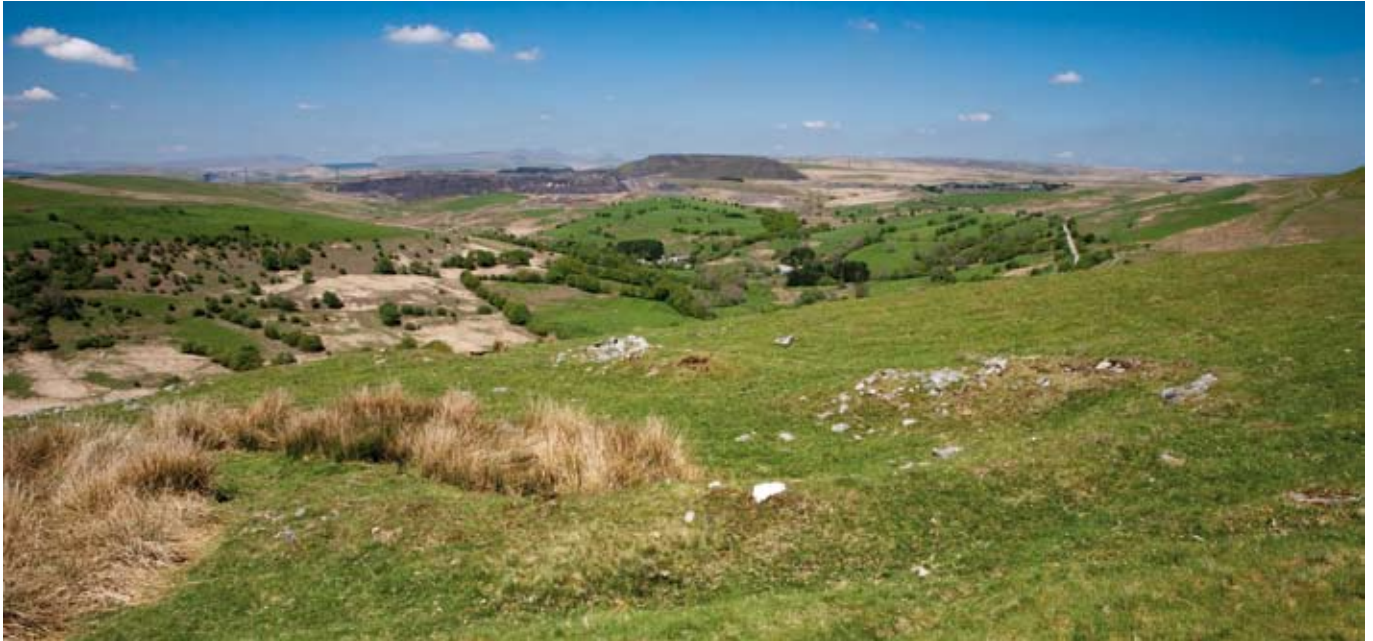
The larger of the two platforms (7) that form part of the deserted late medieval settlement known as Dinas Noddfa; this was the site of a house with stone and turf walls

(5) about 36 feet (11m) across with large stones sticking out of it (SO 099034).