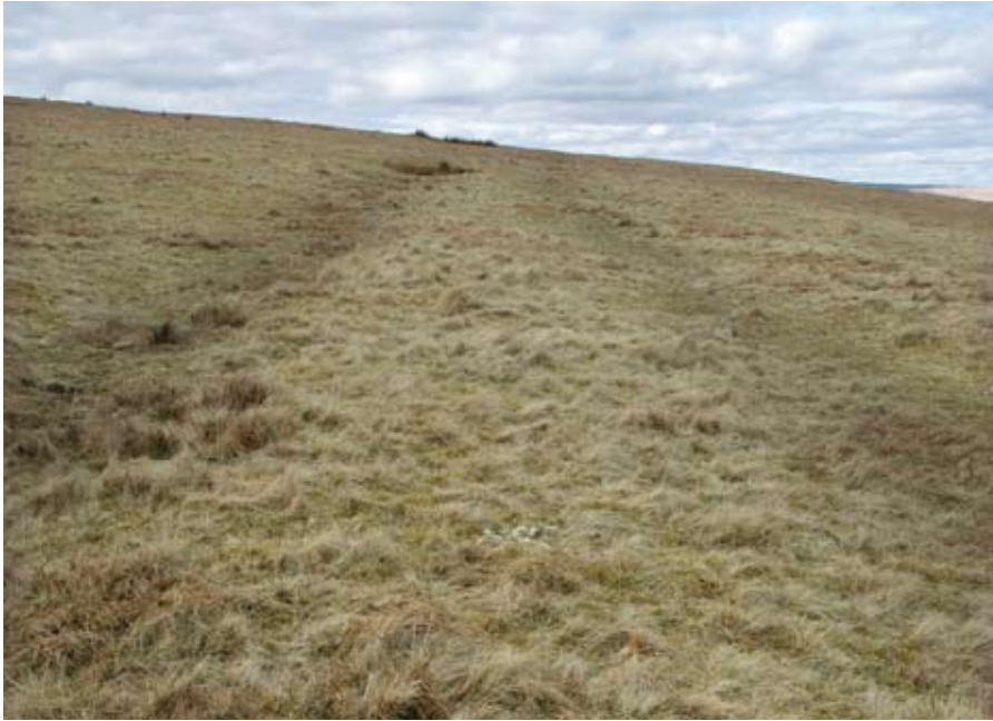
The Roman road (3) that runs along the eastern side of Pen Carnbugail linked the forts at Gelligaer and Penydarren; the flanking ditches have been darkened for emphasis