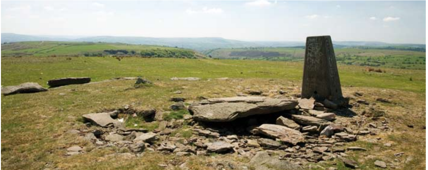
The climb to Carn Bugail (4) is rewarded with splendid views over the surrounding countryside

the way from Brecon to Cardiff, linking the forts at Penydaren, Gelligaer and Caerphilly on its way. Gelligaer fort lies some 4 miles (7km) to the south (ST 134971) and can be reached by following the modern road that runs along the ridge.