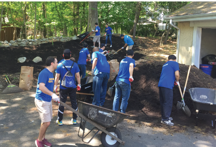
Thanks to volunteers from Samsung for tackling a landscaping project at one of our group homes.