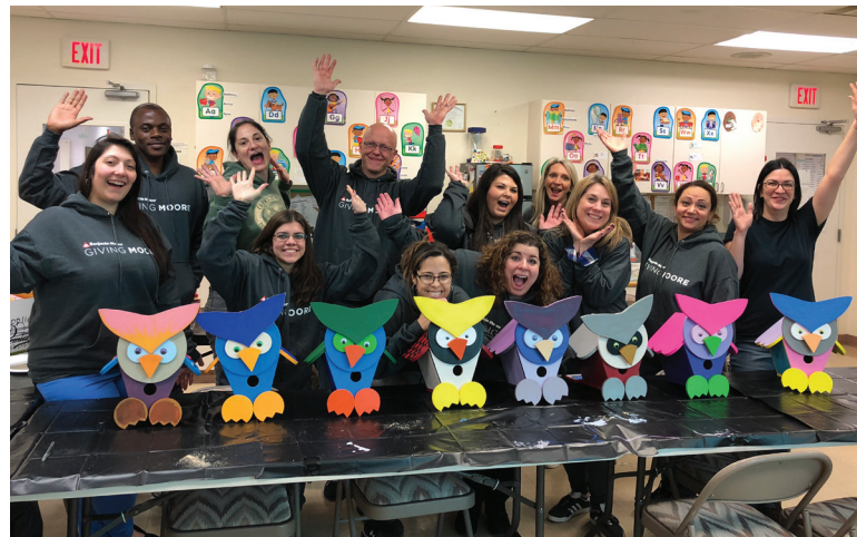
Volunteers from Benjamin Moore did a great job decorating crafts for the children in our care.