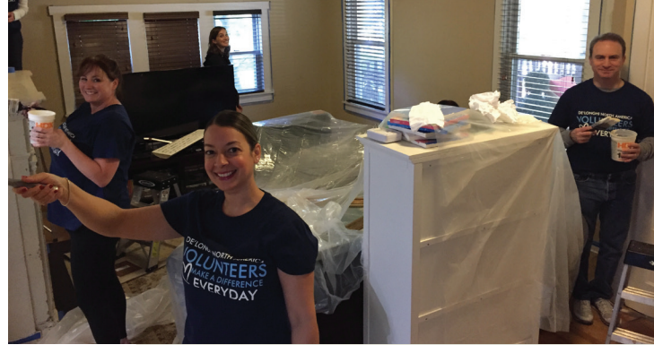
Volunteers from Delonghi help us keep our group homes looking good.

For a complete list of annual gifts, please visit www.cafsnj.org