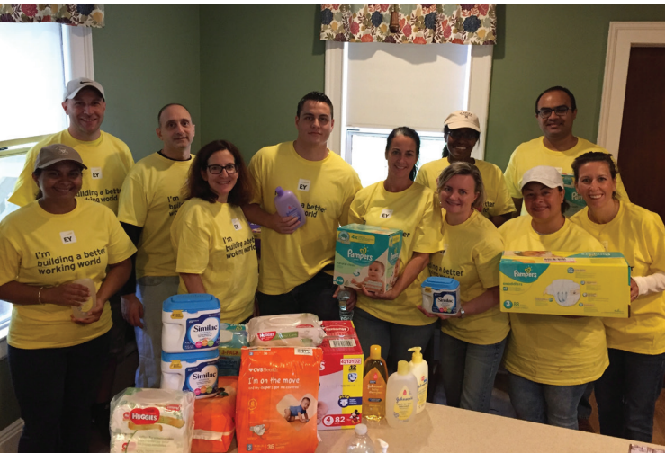
Ernst Young volunteers collected diapers and other essentials for our Baby Basics program.