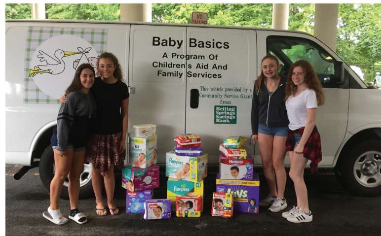
Thanks to Girl Scout Troop 517 for running a drive to benefit low-income families served by Baby Basics.