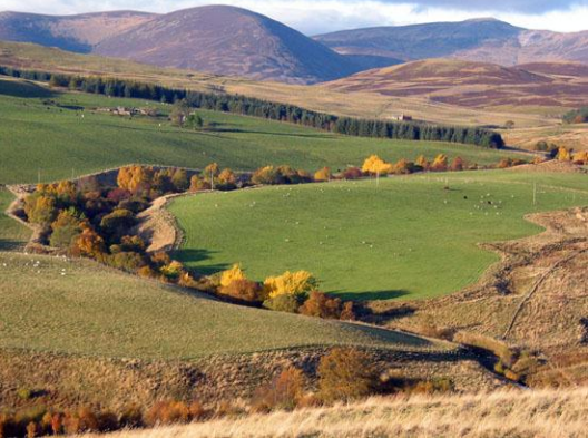
Riparian woodland and a number of evenly dispersed 18th century farms across these elevated slopes