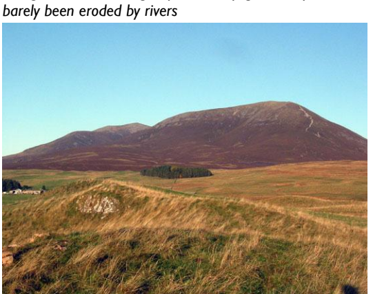
Moorland plateau and then the hills rise immediately from the elevated Glen Fender