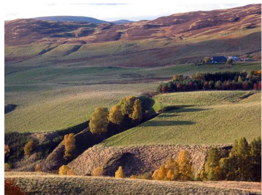
The gentle south facing slopes of deep glacial deposits have barely been eroded by rivers

The elevated, improved field system and strong integrity of the 18/19<sup>th</sup> century pattern and form of the farm steadings are only the most recent manifestation of a long settled area, where people have taken advantage of the south facing, gentle slopes of deep, well drained deposits.