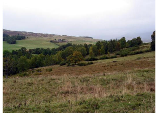
North facing slopes are less enclosed, with rough grazing and scattered birch woodland