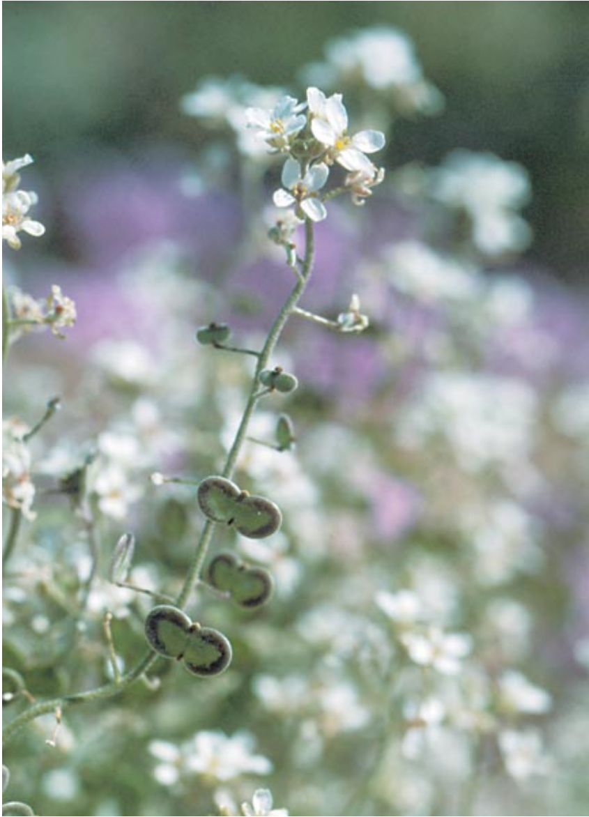
FIG. 8. Dimorphanthea pinnatifida , dunes, April 1998.