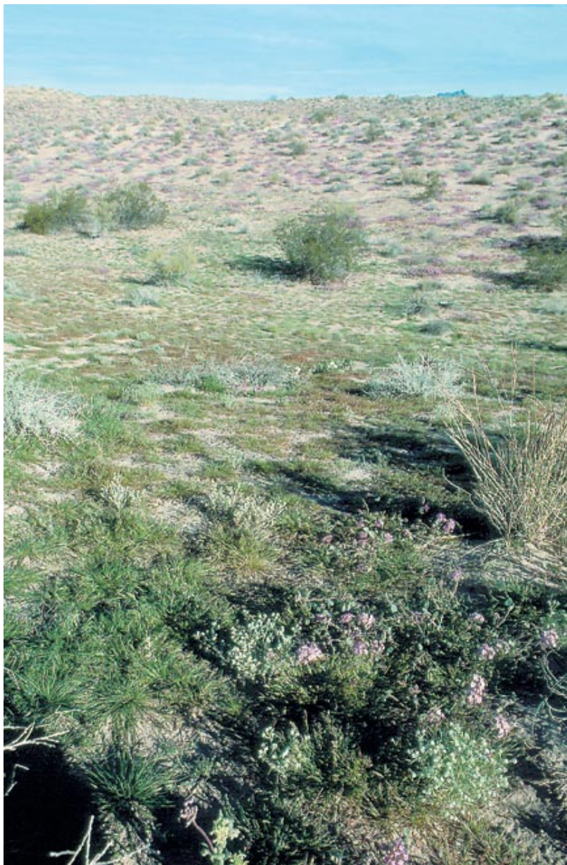
FIG. 6. Northeast side of Mohawk Dunes looking northwest. Schismus in left foreground, Abroonia (lavender-pink flowers), Pleuraphis in right foreground, dune swale in mid-distance, and dune slope in background with Larrea and Abroonia . April 1998.