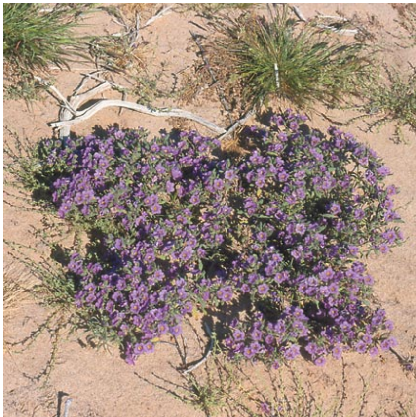
FIG 11. Nama hispidum with Schismus above and Pectocarya heterocarpa below, April 1998.