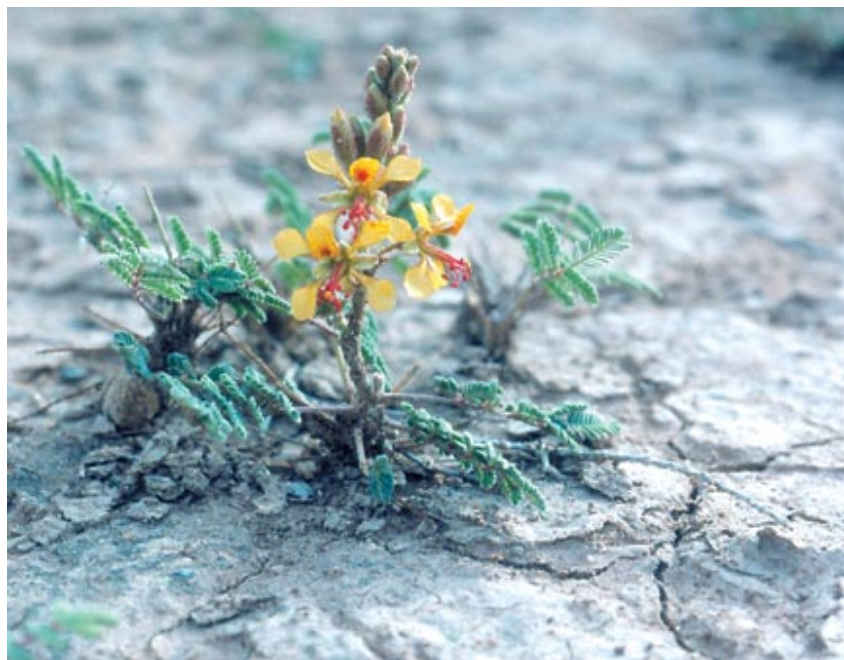
Fig 9. Hoffmannseggia glauca , on the playa, June 1994.