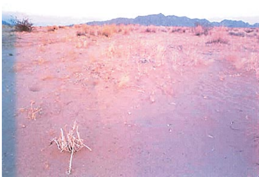
FIG. 4. Same view as Fig. 3, but during a drought year, 12 March 2002. The skeleton in foreground is the same Oenothera deltoides shown in Fig. 3 left foreground.