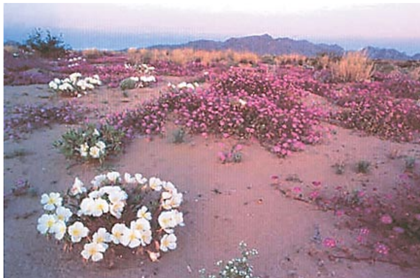
FIG. 3. Mohawk Dunes, during a "wet spring," 28 February 1998. Oenothera deltoides (white flowers) Abronia villosa (lavender-pink flowers), and Pleuraphis rigida (background). Looking eastward, Mohawk Mountains in background.