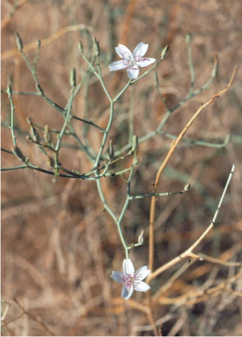
FIG 7. Stephanomeria schottii , dunes, early morning, May 8, 1999.