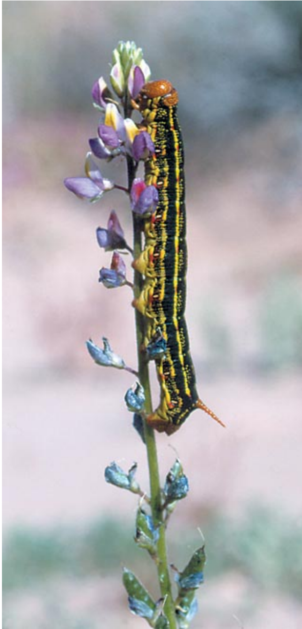
FIG 10. Hyles lineata eating Lupinus arizonicus , April 1998.