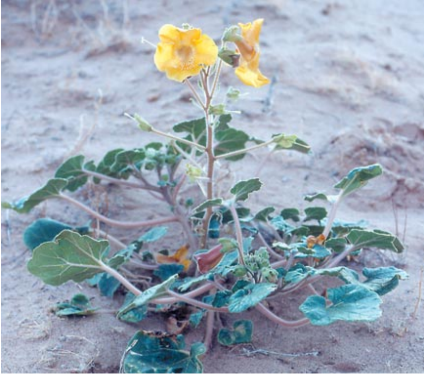
FIG 13. Proboscidea altheaefolia , dunes, August 1996.

and sand flats. Felger 98-84 & Evans; Felger 96-158 & Turner.