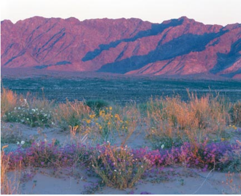
FIG. 5. Northern part of Mohawk Dunes looking eastward towards Mohawk Mountains, April 1998. Abronia villosa (foreground) and Mentzelia multiflora (center foreground).