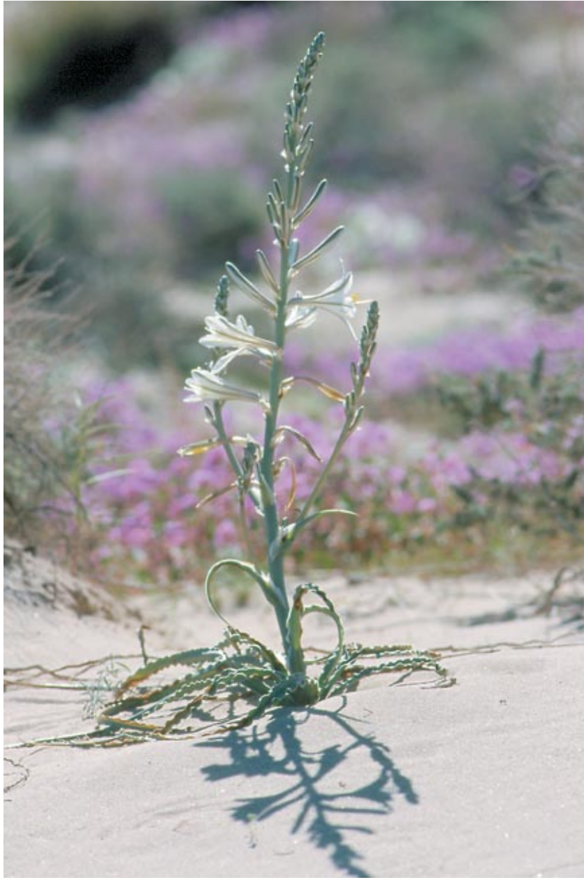
FIG 12. Hesperocallis undulata , flowers ca. 6–7 cm long, April 1998; note the lower leaves in a basal rosette close to the sand.