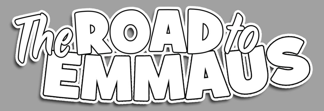
Luke 24:13-35 (Mark 16:12-13)