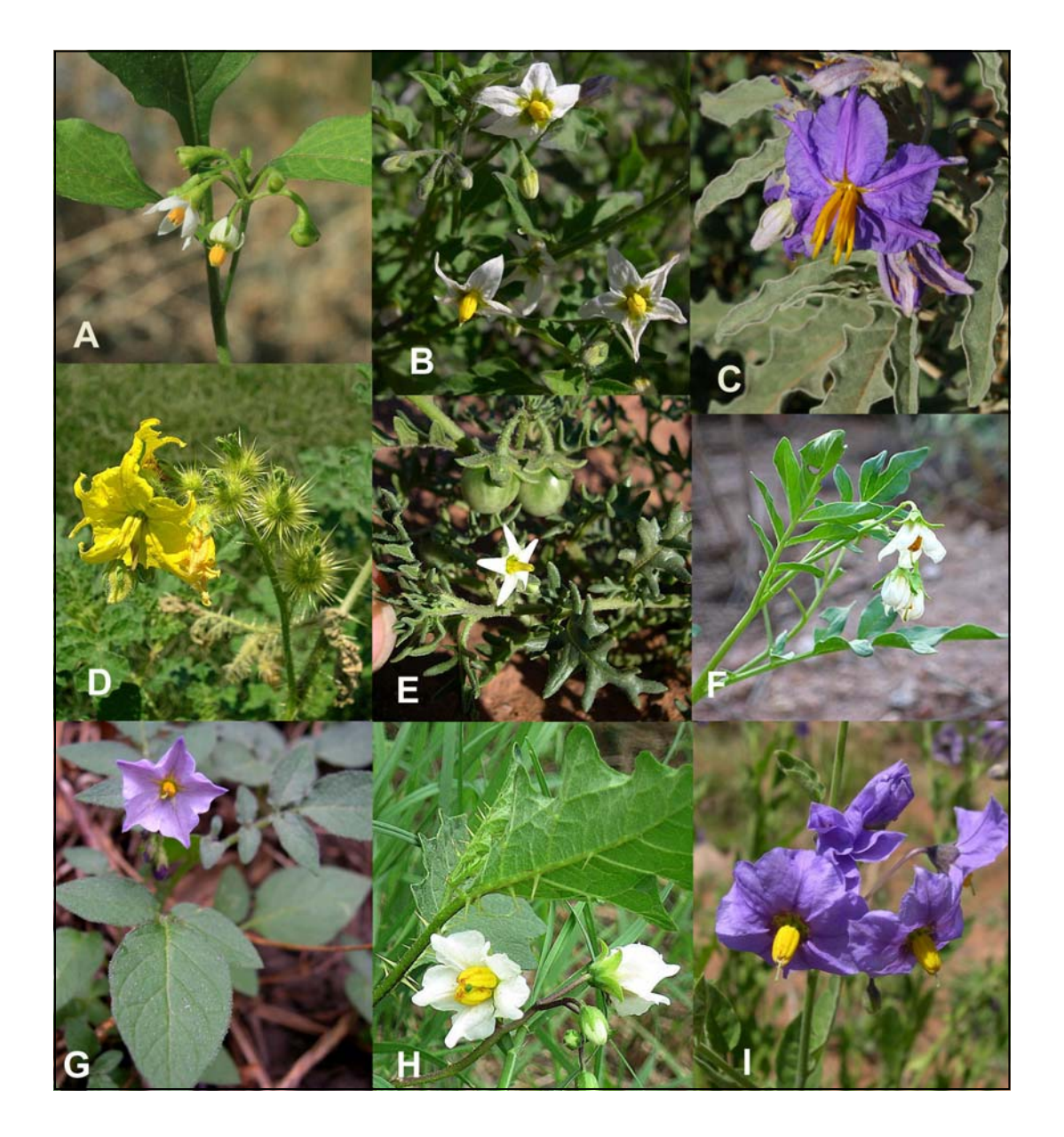
Solanaceae Figure 3. Solanum species in flower. (A) Solanum americanum ; (B) Solanum douglasii ; (C) Solanum elaeagnifolium ; (D) Solanum rostratum ; (E) Solanum triflorum ; (F) Solanum jamesii ; (G) Solanum stoloniferum ; (H) Solanum carolinense ; (I) Solanum xanti.