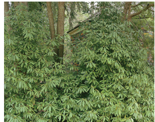
Illicium lanceolatum shrub