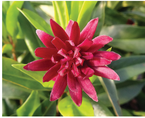
Illicium mexicanum 'Aztec Fire'