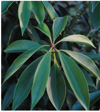
Close up of Illicium lanceolatum leaves