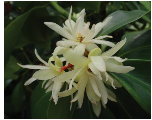
Illicium anisatum 'Murasaki-no-sato' flowers

that blends well into the landscaped garden. However, when grown in full sun, plants are much more compact. Hardy to zone 7 and protect from winter winds.