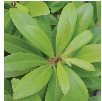
Illicium parviflorum 'Florida Sunshine'

We hope that you will be as enchanted by this genus as we have been while preparing for the sale.