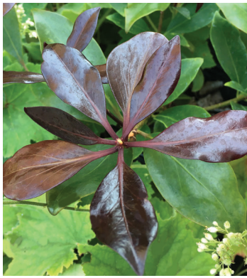
Illicium anisatum 'Murasaki-no-sato' foliage