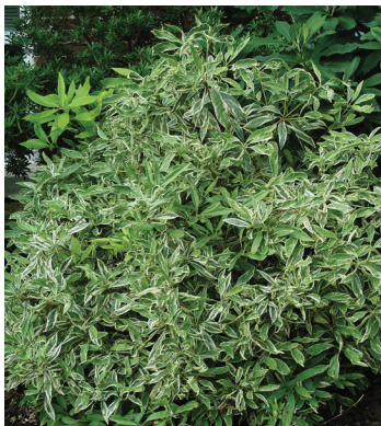
Illicium floridanum 'Thayer'