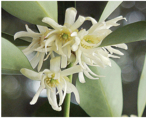
Illicium anisatum