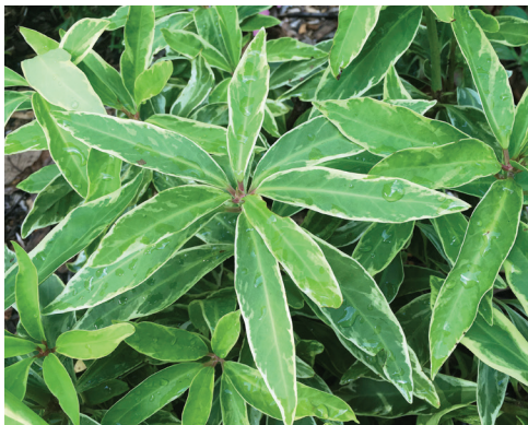
Illicium floridanum 'Pink Frost' foliage