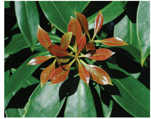
Illicium henryi foliage

Latin Name Common Name Mature Size Light Soil Pot Size, Plant Size Price