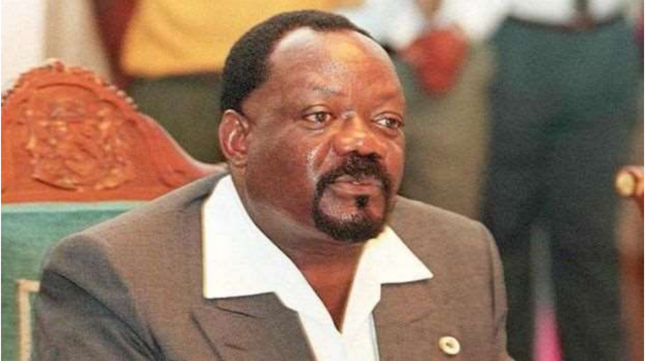
The civil war came to an end following the killing of rebel leader Jonas Savimbi