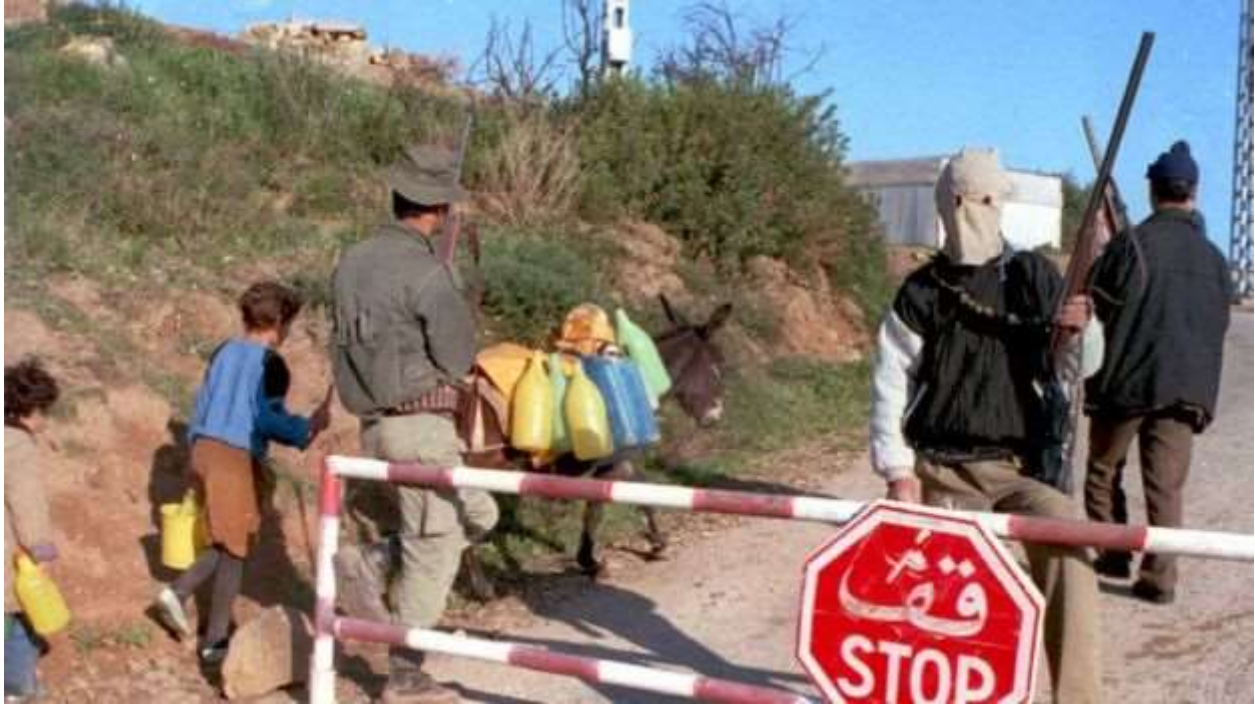
Villagers took to arming themselves during the 1990s insurrection by Islamists