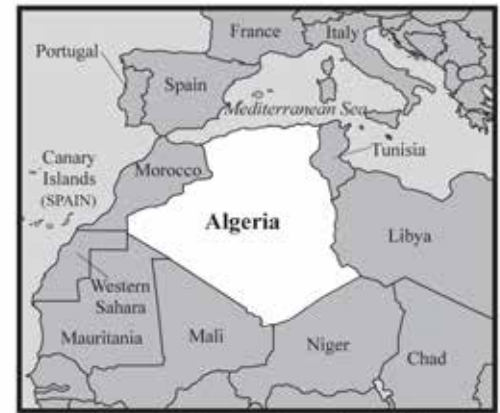
Boundary representations are not necessarily authoritative.