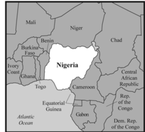
Boundary representations are not necessarily authoritative.