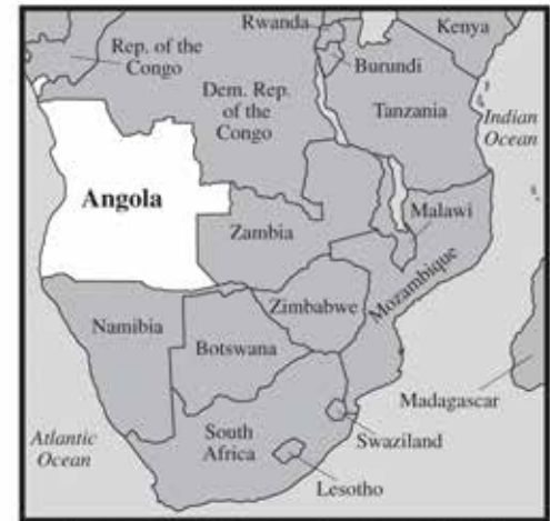
Boundary representations are not necessarily authoritative.