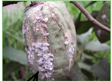
Cacao fruit infested with mealy bugs.