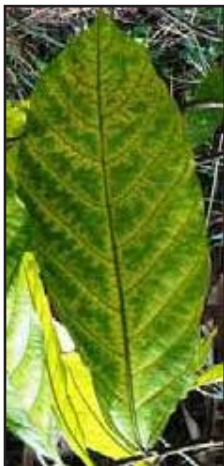
Chlorosis or yellow clearing along the major veins creating a fern-like pattern