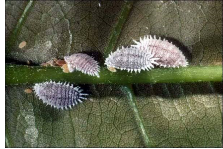
Adult female mealy bugs

The mealybug also excretes amounts of honeydew into the plant where sooty molds grow and build up on the leaves, fruits and other parts of the plant. The molds can cover so much area that it can interfere with the plants normal photosynthetic activity.