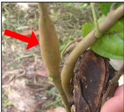
Swelling of the stem