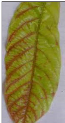
Red vein bonding in young leaves