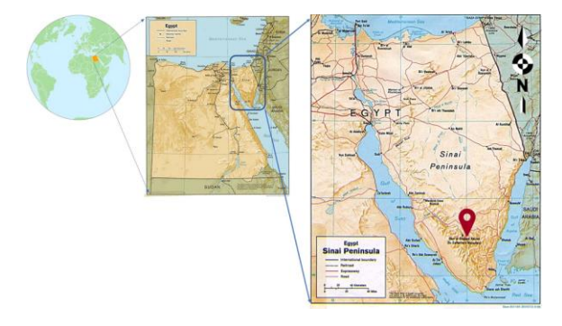
Figure (1): Map shows the geographical distribution of Phlomis aurea in Egypt.

(Täckholm, 1974; Boulos, 2002). Phlomis aurea Decne is a wild golden-woolly perennial species; it is a rare and endangered endemic species restricted to the high altitudes in the southern Sinai Peninsula (Fig. 1) (Boulos, 2008), especially in Saint Catharine and Mousa mountains (El-Hadidi and Hosni, 2000).