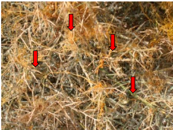
Figure (5): Usnea hirta epiphyte on Alhagi maurorum .