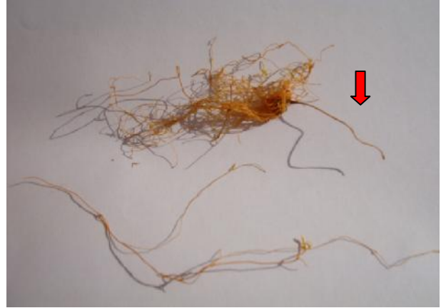
Figure (6): Usnea hirta . The red arrow indicates to the base branch.