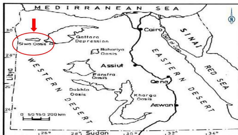
Figure (1): Egypt map. The red arrow indicates to Siwa Oasis. (Abd El-Ghani and Fawzy, 2006).

The oases are the most prominent features of the Western Desert of Egypt. They are green patches within the surrounding sterile desert. Siwa Oasis is one of the most common inhabited Egyptian Oases (Fig. 1). It is located in the northern part of the Western Desert (25° 18' - 26° 05' E, 29° 05' - 29° 20' N), and 70 km east of the Libyan frontier and 305 km south of the Mediterranean coast. At Siwa, the main sources of water are naturally flowing springs (some hot springs).