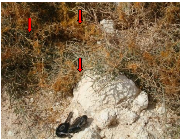
Figure (4): Usnea hirta with the vegetation community of Alhagi maurorum .