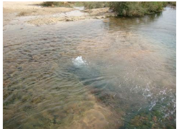
Figure (8): The hot spring at Ain Quraychat, Siwa Oasis.

Color. All descriptions given in the identification manual keys of fruticose lichens by Goward (1999) and Rosentreter et al. , (2007) were carefully mentioned.