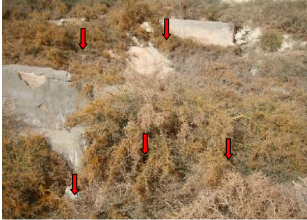
Figure (3): General view of Usnea hirta with the vegetation community of Alhagi maurorum .