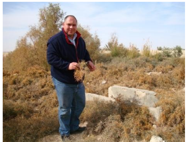
Figure (7): The author at the studied area, 10 February 2012.