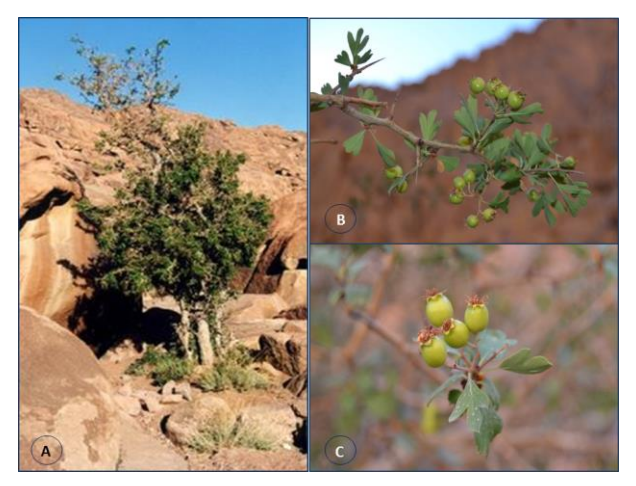
Figure (2): a) Crataegus sinaica tree, b) a branch Crataegus sinaica bears fruits, c) immature fruit of Crataegus sinaica .