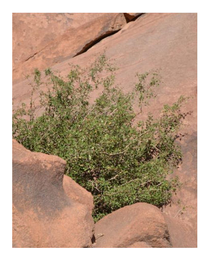
Figure (1a): Crataegus sinaica is restricted to mountainous Saint Catherine, South Sinai.