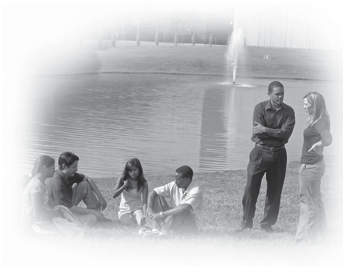
Students enjoy a relaxing time at the pond in front of the Student Services and Classroom Building.