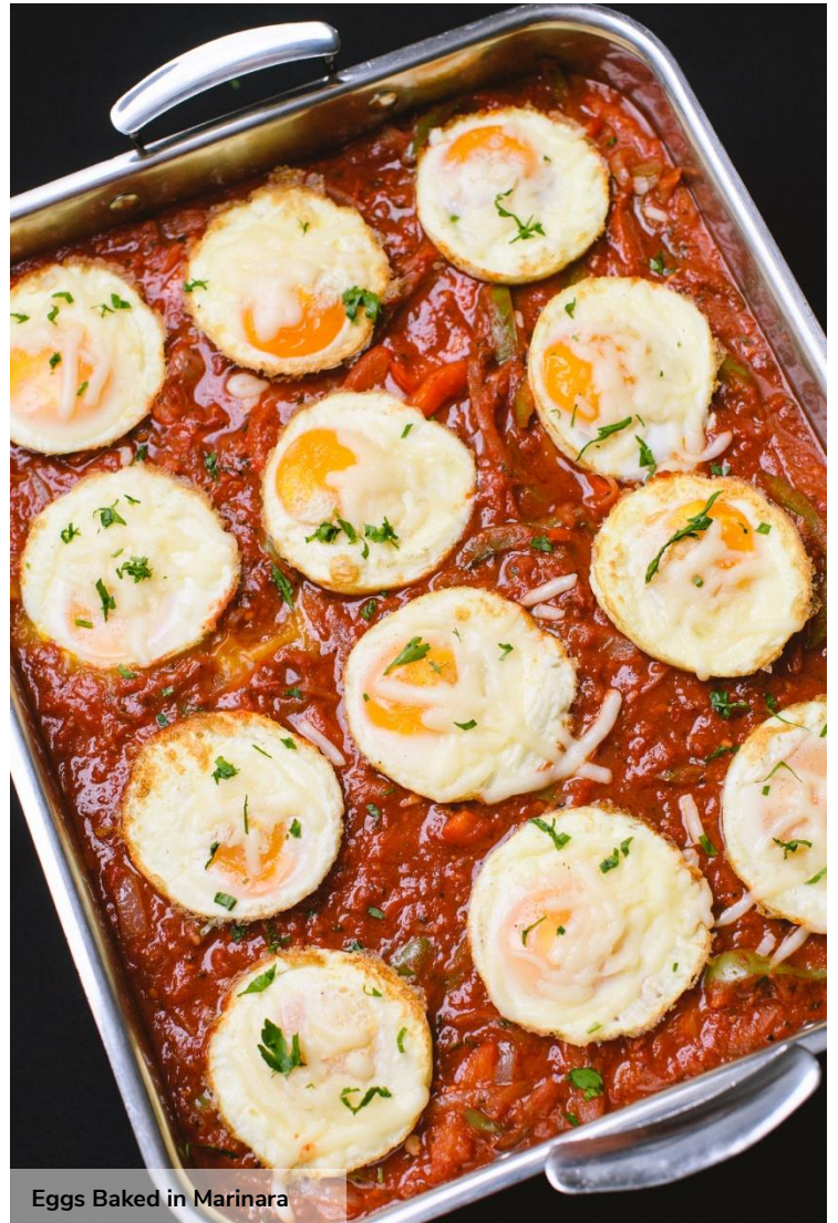
Eggs Baked in Marinara

Eggs, Bacon, Monterey Jack, Cheddar, Tomato, Spinach 8 slices; serves 4 guests