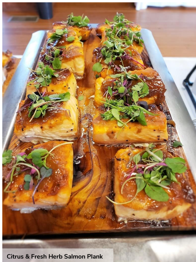
Citrus & Fresh Herb Salmon Plank

Crostini with a trio of Bruschetta toppings on the side: Portabella Mushroom, Tomato & Basil, and Grilled Vegetable