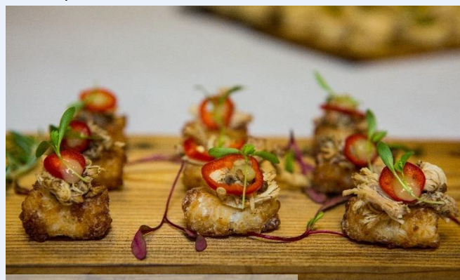
Crispy Rice Cake with Chicken Adobo