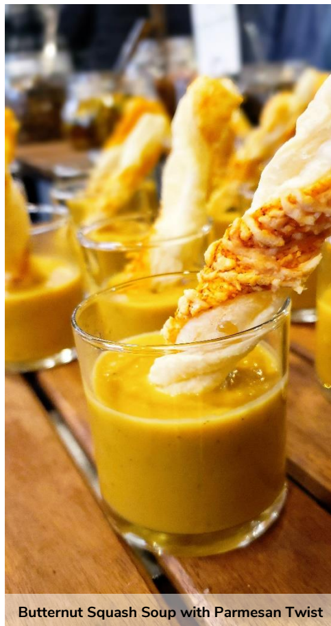
Butternut Squash Soup with Parmesan Twist