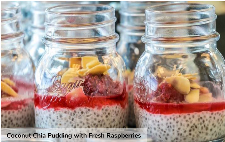
Coconut Chia Pudding with Fresh Raspberries

Hot Steel Cut Oatmeal $5.50 per person (V) With Brown Sugar, Honey, Dried Cranberries, toasted Almonds. Minimum 15.