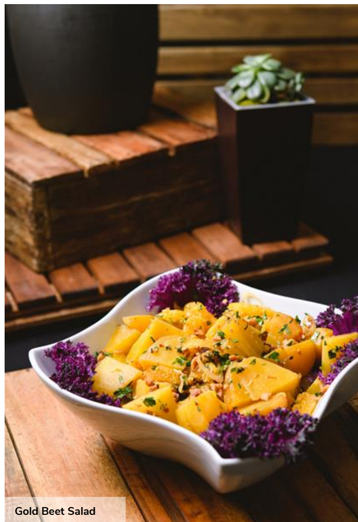
Gold Beet Salad

Chopped Romaine, Genoa Salami, Black Forest Ham, shredded Mozzarella, Pepperoncini, Kalamata Olives, Artichoke Hearts, Heirloom Cherry Tomatoes, and Red Onion with Basil Vinaigrette