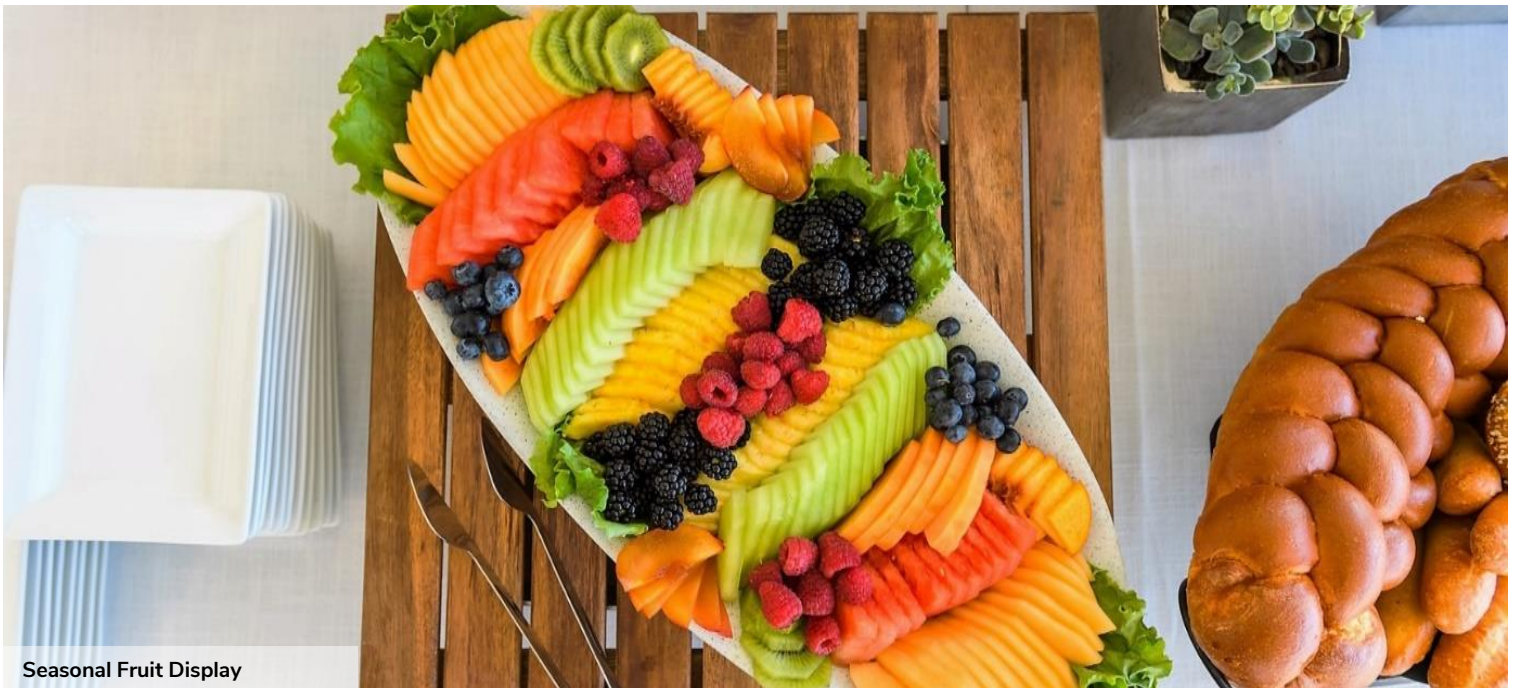
Seasonal Fruit Display

An Assortment of FAGE Greek Yogurt; flavors may include Pomegranate, Cherry, Strawberry, Blueberry, Honey