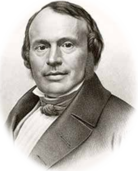
Dr. Louis Agassiz