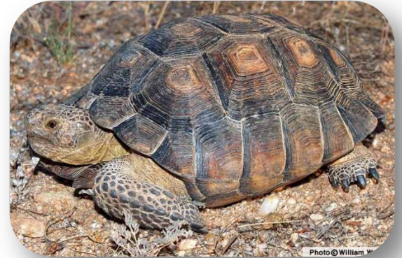
Gopherus agassizii (Desert Tortoise)