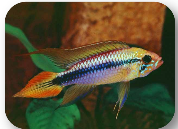
Apistogramma agassizii (Agassiz's dwarf cichlid)