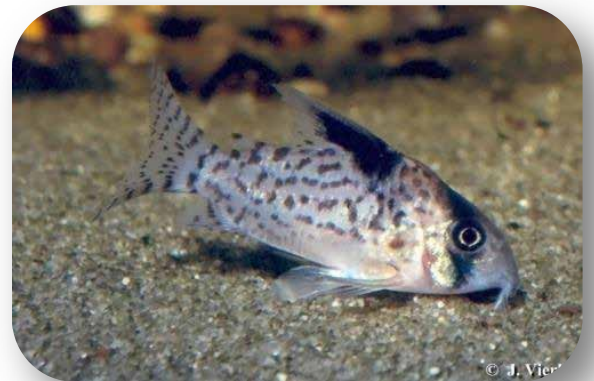
Corydoras agassizii (Agassiz's cory cat)

The species we are familiar with in our hobby are Corydoras agassizii and Apistogramma agassizii . I actually have a small school at home of C. agassizii , but DRAS members, especially the cichlid orientated ones, would be most familiar with A. agassizii , a species that has been in the aquarium hobby since 1909 when they were first imported to Germany. They were first described in 1875 and were first gathered by Dr. Agassiz during his aforementioned expedition to the Amazon in 1865 – 1866.