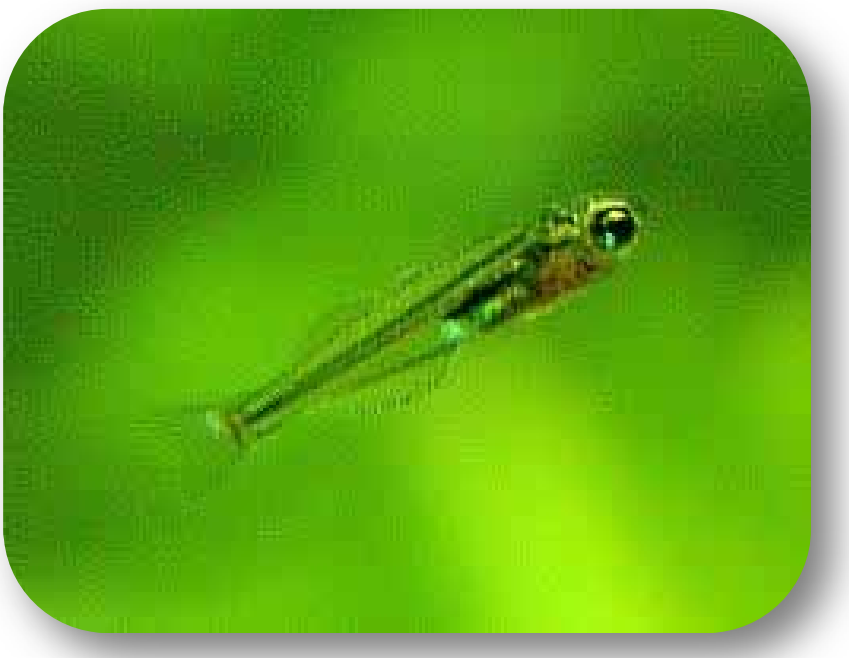
Melanotaenia boesemani fry

When the fry hatch, they will have a yolk sac that will provide nourishment and sustenance for the first two days. It should be noted that the depletion of the yolk sac is when the fry will return to the surface in search of food.