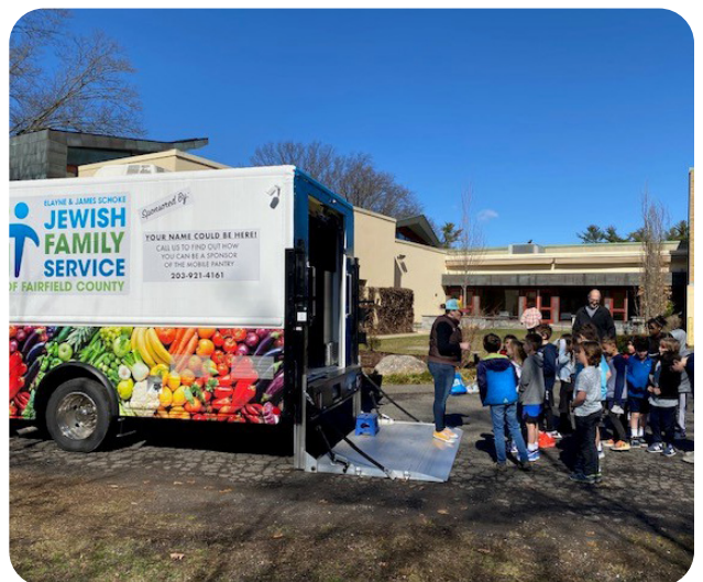
JFS Mobile Pantry