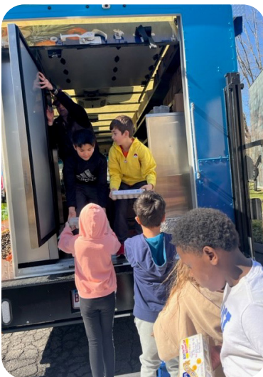
3rd grade stocking the truck