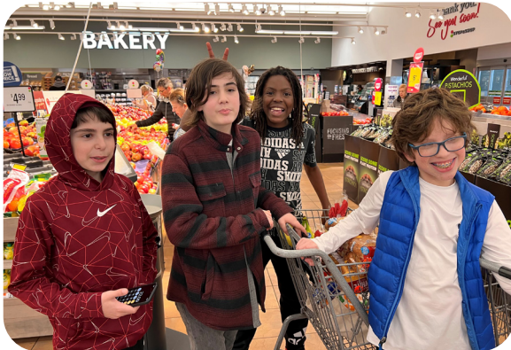
6th grade shopping for food for the mobile food pantry