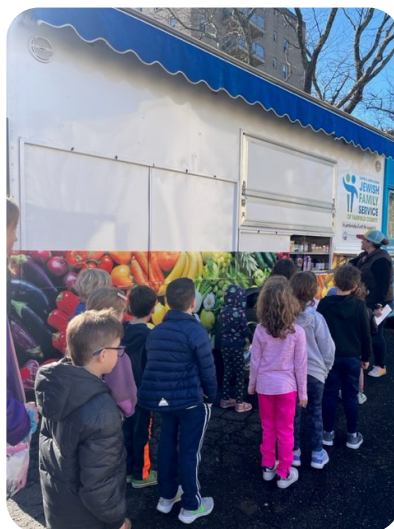
1st grade learning how the truck works