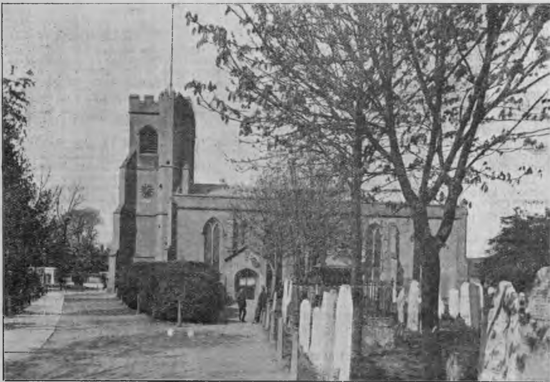
ST. MARY'S CHURCH, WALTHAMSTOW, ESSEX.