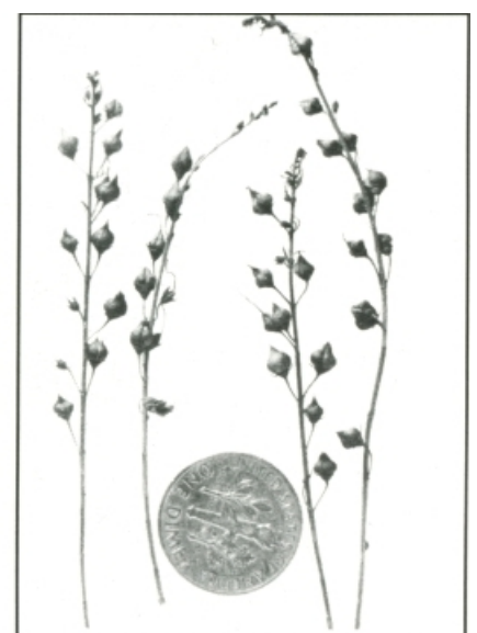
Fig. 3. Seed capsules of Seymeria cassioides.

Black-senna flowers are solitary in leaf axils, stalked, ephemeral (lasting only one day) and produced from August through October. The calyx is glabrous and consists of five narrow sepals united at their bases. The externally glabrous corolla (hairy in S. pectinata ) consists of five bright yellow petals which are united into a short cylindrical base and expanded into five nearly equal, rounded lobes. Corollas are marked with reddish-brown lines internally. Four stamens are attached to the corolla tube at the position where the corolla lobes begin to diverge. The filaments are glabrous (filaments in S. pectinata are hairy). The pistil extends past the anthers and the superior ovary eventually develops into a 2-locular glabrous capsule ( S. pectinata's capsule is hairy). At maturity, the shiny brown capsule is ca. 3-5 mm wide (Fig. 3) and contains about 75 seeds. Seeds are wingless ( S. pectinata seed are winged), ridged and furrowed, ca. 0.6 to 0.7 mm long (Gwynn et al. 1978; Radford et al. 1964; Godfrey and Wooten 1981). Seeds ripen in October-November and are released to overwinter on the ground where they germinate epigeously the following spring (Fitzgerald et al. 1975; Laird and Wolfe 1973; Mann et al. 1969; Mann et al. 1971; Mann and Musselman 1979; Musselman and Mann 1978).