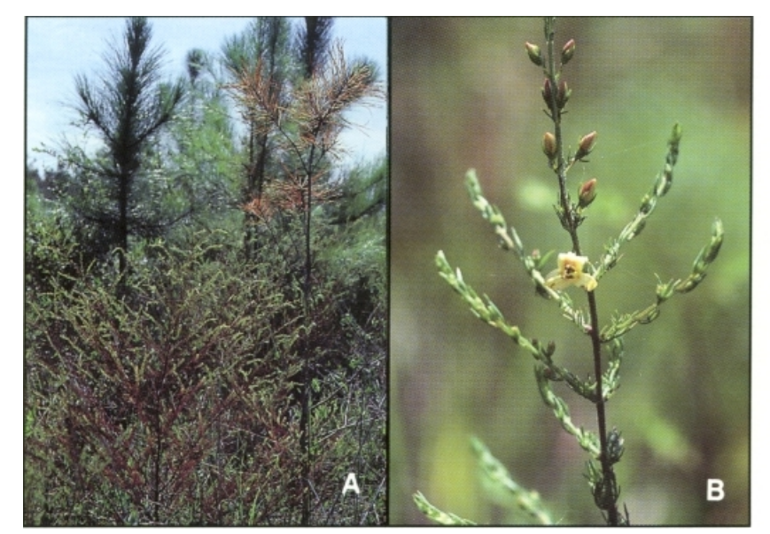
Fig. 2. Seymeria cassioldes. A) Large plant near a seriously damaged 6-year-old slash pine. B) Close-up of foliage, flower buds and a single yellow flower.