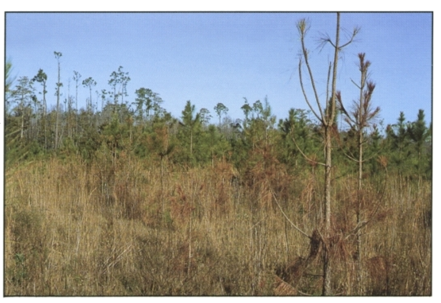
Fig. 5. Six-year-old slash pine badly damaged by Seymeria cassioides; Washington Co., Florida Note stunted growth, chlorotic foliage, tufting of needles at stem terminals and tree mortality

Georgia (Fitzgerald and Terrell 1975), and damage on older slash pines has been observed in Florida (Fig. 5).