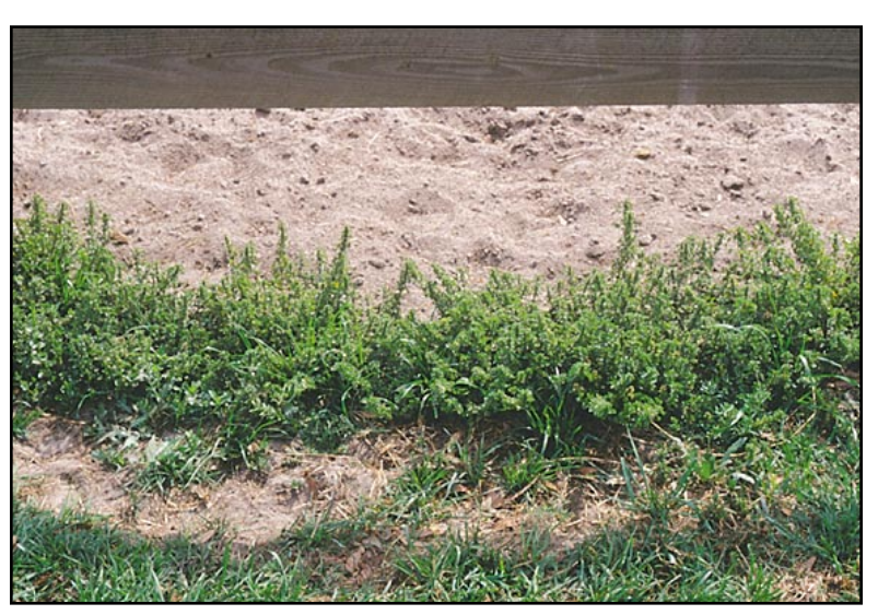
Figure 2. Urtica chamaedryoides under wooden fence of horse corral. Erect and sprawling stems.

Urtica dioica L., stinging nettle, is native to the Old World, but has naturalized throughout much of temperate America (Gleason and Cronquist 1991). This perennial plant is listed in Wunderlin (1998) for Alachua County, but Woodland (1982) shows U. dioica as ranging from Canada south only to northern Georgia. However, Jones and Coile (1988) show the species from two counties in Georgia, a northern county (Habersham) and the other bordering on Florida (Lowndes Co., where Valdosta is located). This species is utilized by man as a food, for fiber, as a wool dye, as a source for chlorophyll and medicinally, with over 23,000 ha cultivated in Germany by 1918 (Mitich 1992). When checking the database AGRICOLA for abstracts, numerous foreign language articles in eastern Europe indicate that U. dioica is a weed of fields, pastures and waste places and