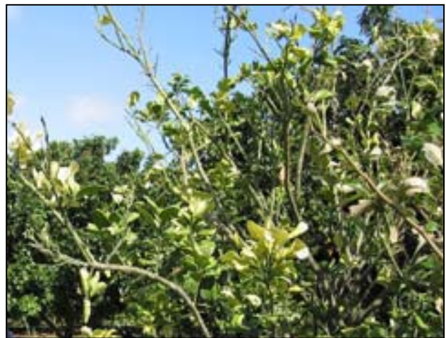
Fig. 8. Yellow shoots and defoliation caused by citrus greening infection.