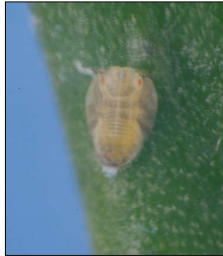
Fig. 2. Asian citrus psyllid nymph