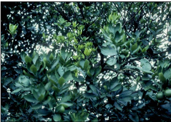
Fig. 3. Citrus greening in grapefruit, showing sectoring. Note smaller leaves on one branch of the tree.