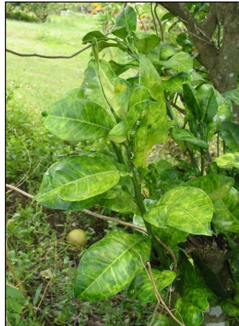
Fig. 4. Citrus greening mottle in pummelo.