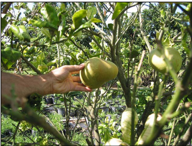
Fig. 7. Lopsided pummelo.