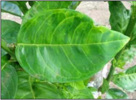
Fig. 5. Early symptoms of citrus greening mottle in sweet orange.