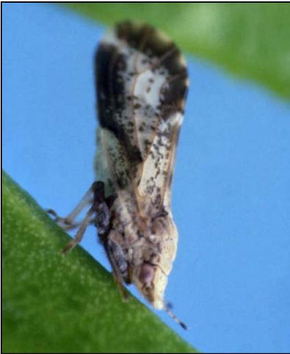
Fig. 1 . Asian citrus psyllid adult