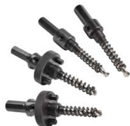
Part Numbers 106202 , 106209

Arbors include HSS pilot bit, ejector spring and 4 mm allen wrench.