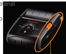
Damage-resistance material Rubber over-molding