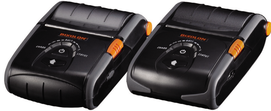
SPP-R200 (Without MSR)