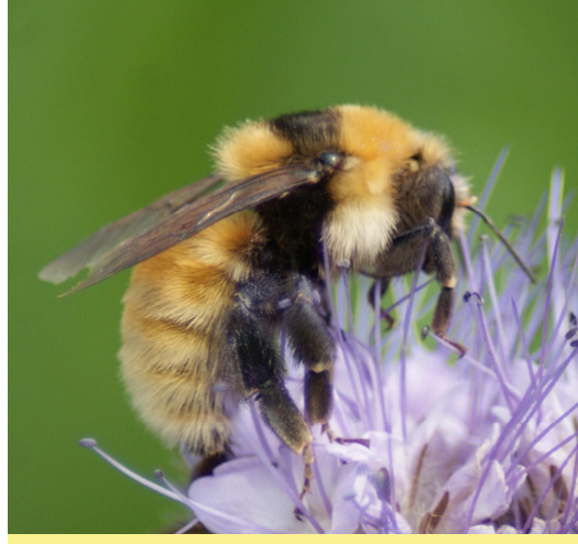
Great yellow bumblebee ( Bombus distinguendus )

A new three year project was launched in 2010 to help the Great yellow bumblebee (Bombus distinguendus). In partnership with the Caithness Biodiversity Group and Bumblebee Conservation Trust, eleven local farmers have each sown quarter hectare plots of a short-term pollen and nectar mix containing seven species, mainly agricultural legumes. Sowing was carried out in May and June, and the mix will remain in situ for three years,