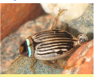
Hygrotus nigrolineatus