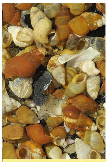
Mud snail (Hydrobiidae) shells

Hydrobids are common benthic organisms that reside within intertidal and shallow waters and prefer soft substrates.