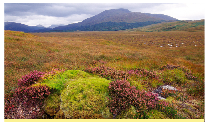
Above: Claish Moss Below: Corwall Port