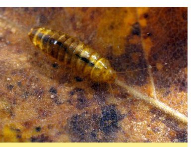
Prionocyphon serricornis

Biological Association for their project 'Is the Upland summer mayfly ( Ameletus inopinatus ) in hot water?' Over the summer they have sampled watercourses with historic records of Ameletus and have identified the lower altitudinal limit in five key populations.