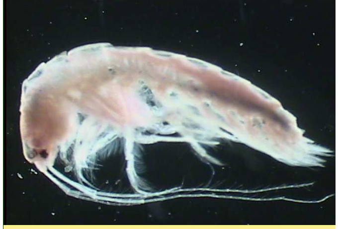
Byblis gaimardi

A number of the UK species from offshore marine waters are poorly known and are only rarely recorded. Marine survey work carried out in 2010 by SEPA and Marine Scotland Science has revealed new records of some of these species.