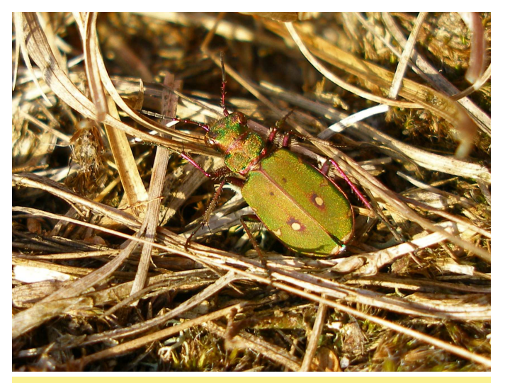
Green tiger beettle (Cicindela campestris)

on any small invertebrates they can catch including spiders, caterpillars and ants.