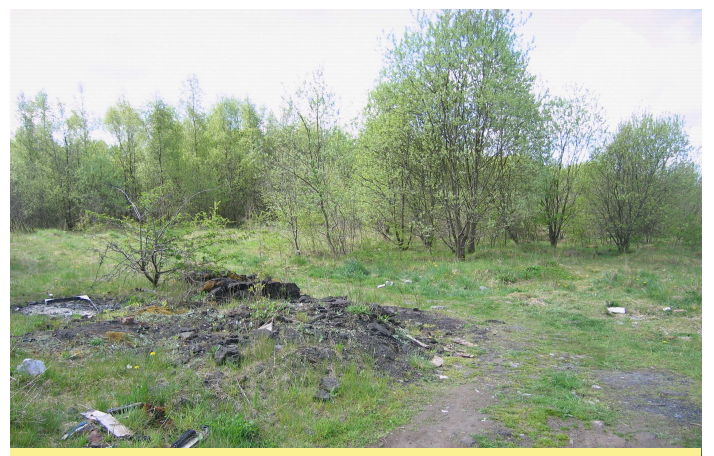
Prime invertebrate habitat! Distillery brownfield site

The industrial revolution in Britain during the 18<sup>th</sup> Century transformed the scenery of our towns and countryside. In Central Scotland, Falkirk was at the heart of this revolution and many heavy engineering works and iron founders were based there. With the demise of these industries across Falkirk, their former premises have been left derelict. Many of these ex-industrial sites have since been reclaimed by nature through natural succession.