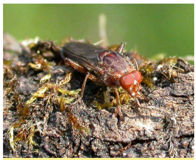
Male Aspen hoverfly ( Hammerschmidtia ferruginea )

The David Livingstone Centre is surrounded by wildflower meadows and located next to Bothwell Castle Grounds Site of Special Scientific Interest (SSSI) which is designated for ancient woodland and its invertebrate assemblage. These habitats offer excellent opportunities for invertebrate enthusiasts to take part in mini-beast hunts, and potentially contribute to surveys.