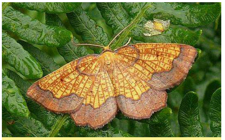
Male Dark bordered beauty moth ( Epione vespertaria )