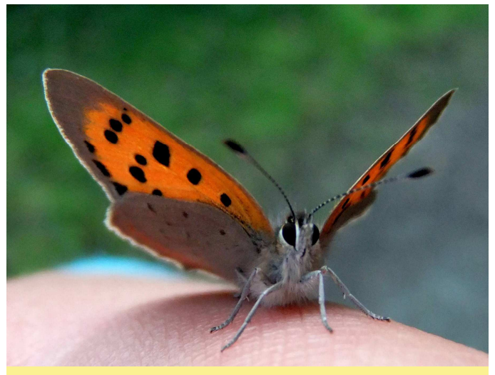
Small copper butterfly ( Lycaena phlaeas ) at Bridgeness scrapyard brownfield site

A current project by BTCV Natural Talent apprentice Suzie Bairner is looking at wildlife (particularly invertebrates) and wildflowers at the brownfield sites in Falkirk with Buglife - The Invertebrate Conservation Trust. The project aims to use the Vacant and Derelict land register to identify brownfield sites with open mosaic habitat and conservation interest. Buglife are working