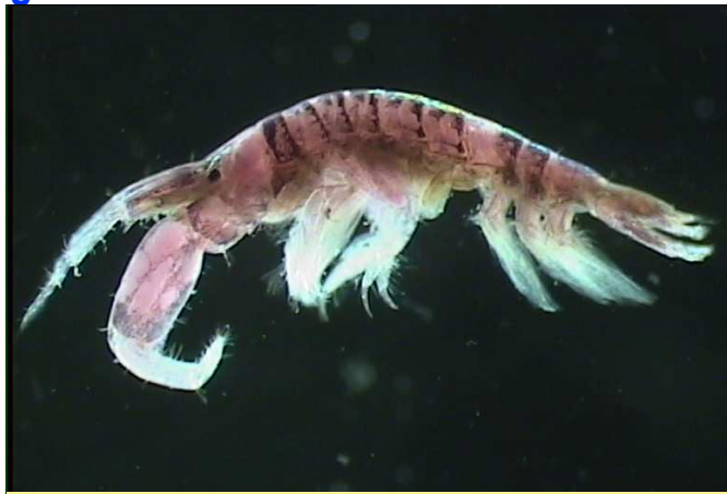
Monocorophium sextonae

In the Firth of Clyde, an area in which amphipods have been well studied for over 100 years, two unusual species were observed in the 2010 surveys: Unciola planipes known in this area from