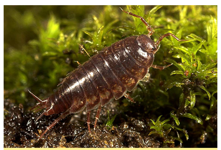
New woodlouse for Scotland, Oritoniscus flavus

The only likely confusion would be with dark, juvenile Striped woodlice ( Philoscia muscorum ), which also move quickly, or possibly with larger Pygmy woodlice ( Trichoniscus species ), but these are still smaller than O. favus and are a paler pink colour. Striped woodlice have a dark head and a dark stripe running along their back. Striped and Pygmy woodlice are both very common species and are likely to be found alongside O. flavus meaning it should be possible to make these comparisons in the field.