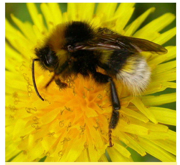
Gypsy cuckoo-bumblebee ( Bombus bohemicus )