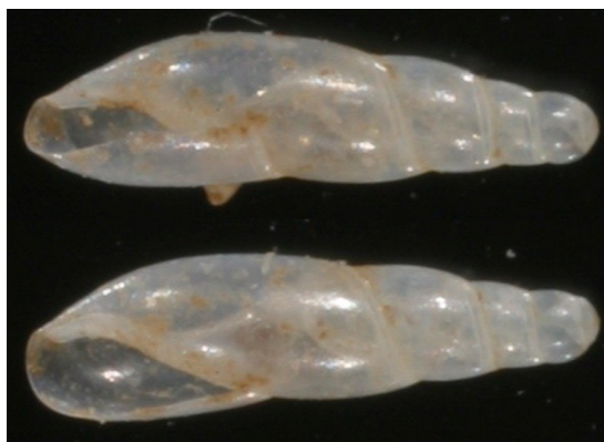
Blind agate snail ( Ceciliodes acicula )

Because of its subterranean habitat, this species is often found only as an empty shell. When the snail is alive the shell is transparent and when empty for