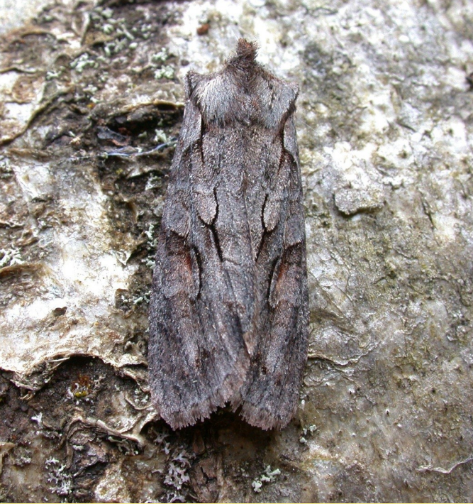
Conformist ( Lithophane furcifera )

The Scottish Highlands, in particular Badenoch and Strathspey, is a popular destination for moth enthusiasts who live south of the border due to the presence of several local specialities.