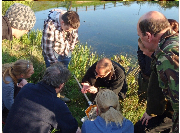
TOP TO BOTTOM: Male smooth newt ( Lissotriton vulgaris ); Water scorpion ( Nepa cinerea ); Workshop field session