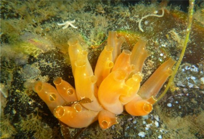
Yellow-ringed sea squirt ( Ciona intestinalis )

Sea squirts or tunicates are a group of marine filter-feeding sac-like invertebrates with two siphons (one incurrent and one excurrent). Despite the simple appearance of the adults, they are in fact closely related to vertebrates with a free-swimming larval stage that has a tail and primitive spinal chord called a notochord. Sea squirts are members of the subphylum Tunicata within the phylum Chordata, which contains all vertebrates and as well as the Lancelet (subphylum Cephalochordata) which was mentioned in the last edition of Scottish Invertebrate News, Volume 2, Issue 2.