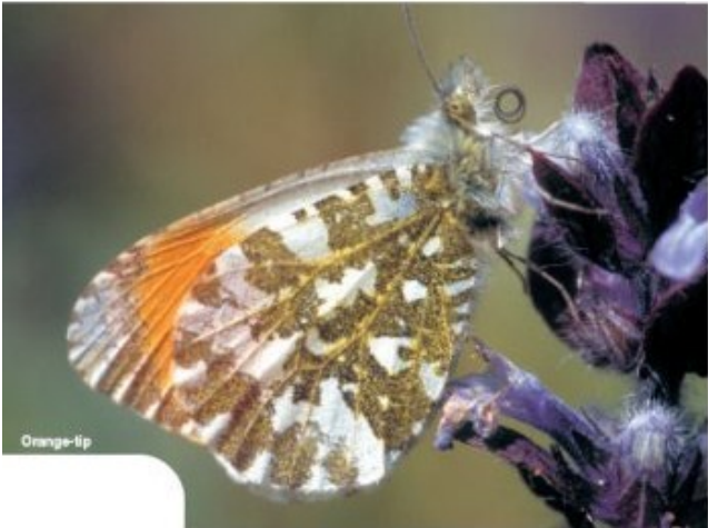
New Butterfly and day-flying moths of Glasgow leaflet © Butterfly Conservation

The very popular 'Butterflies and day-flying moths of Glasgow' leaflet has been reprinted with a few important changes to bring it up to date.