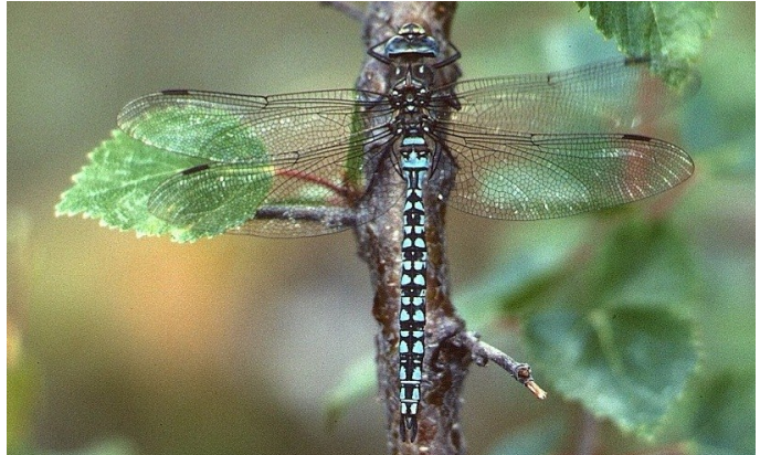
Azure hawker ( Aeshna caerulea )

Azure hawker ( Aeshna caerulea ) were found at several sites this year. The small shallow bog pools where they breed had plenty of water after many dried out in the past two years. However, many of the larvae seen were in their first year and they have another two years to survive before emergence. A new breeding site was found and good numbers of adults were seen in new areas in the north.