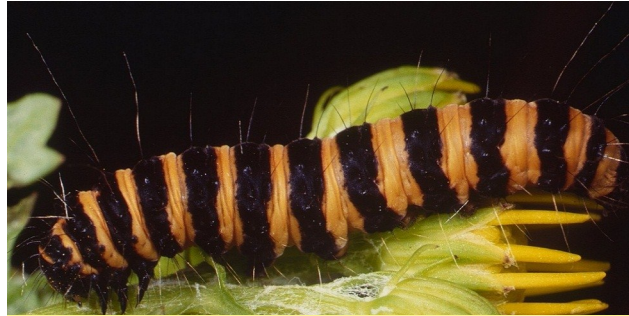
Cinnabar moth caterpillar ( Tyria jacobaeae)

By entering your photograph in the Competition, you grant the Competition organisers a free non-exclusive license to use the image in their corporate promotion, publicity and publications, and in any promotional material connected to this competition. However, the copyright remains with