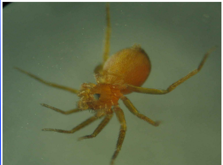
Pink prowler ( Oonops domesticus )