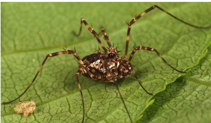
Crowned harvestman ( Megabunus diadema)

For the first time in many years there will be a meeting of Arachnologists in Scotland, to be held at Perth Museum on Saturday 25 th August 2012.