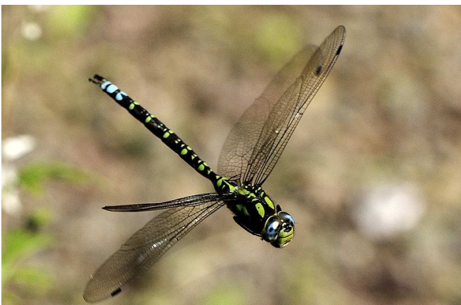
Southern hawker ( Aeshna cyanea ) © Wolfgang Theofel