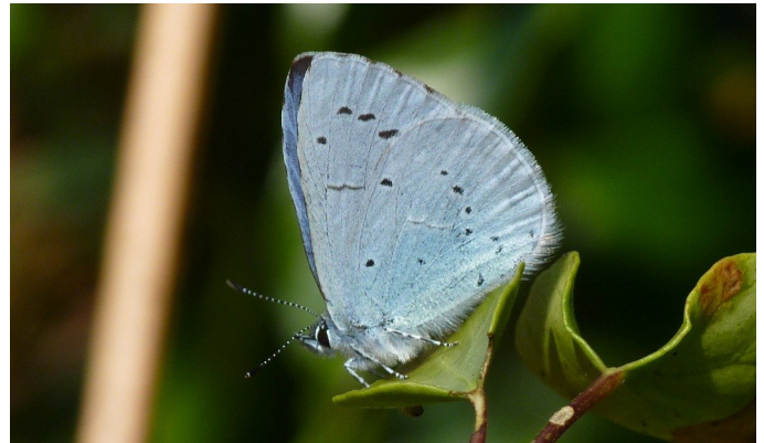
Holly blue ( Celastrina argiolas ) A species spreading through central Scotland

The leaflet can be obtained from Butterfly Conservation Tel: 01786 447753 or e-mail: Scotland@butterfly-conservation.org or from Glasgow City Council Tel: 0141 287 5665/7026 or e-mail: carol.macleam@glasgow.gov.uk