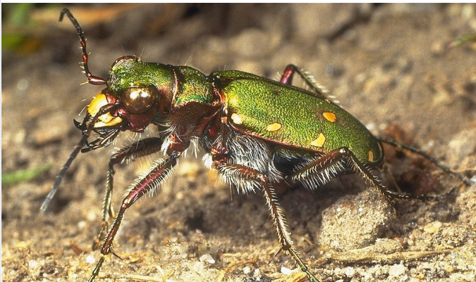
Green tiger beetle ( Cicindela campestris )

This year we will be back at Roughcastle with more habitat creation and management across the site. We will be creating a bee bank, planting 3,000 plug plants and also clearing and thinning