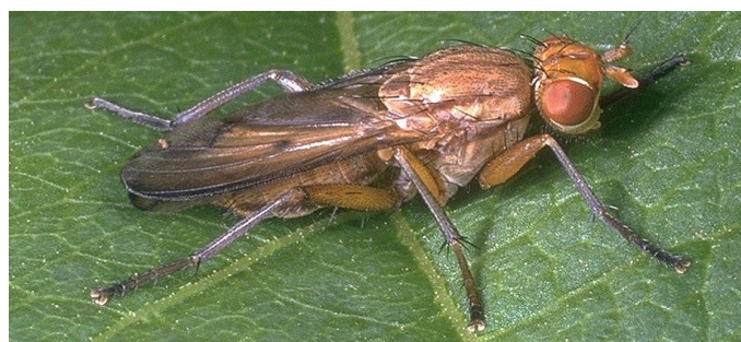
Snail-killing flies ( Tetanocera spp) have been found at Taynish