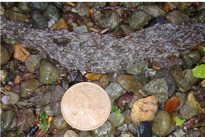
'Army' of Dark-winged fungus gnat larvae ( Sciara militaris )

A chance mention of a local phenomenon to a council employee resulted in the discovery of a mysterious occurrence in Leadhills, South Lanarkshire being reported to the local Ranger Service. It looks eerie from a distance – like a very slowly moving snake skin! Up close these long, thin columns are actually made up of hundreds of tiny grey larvae known as “army