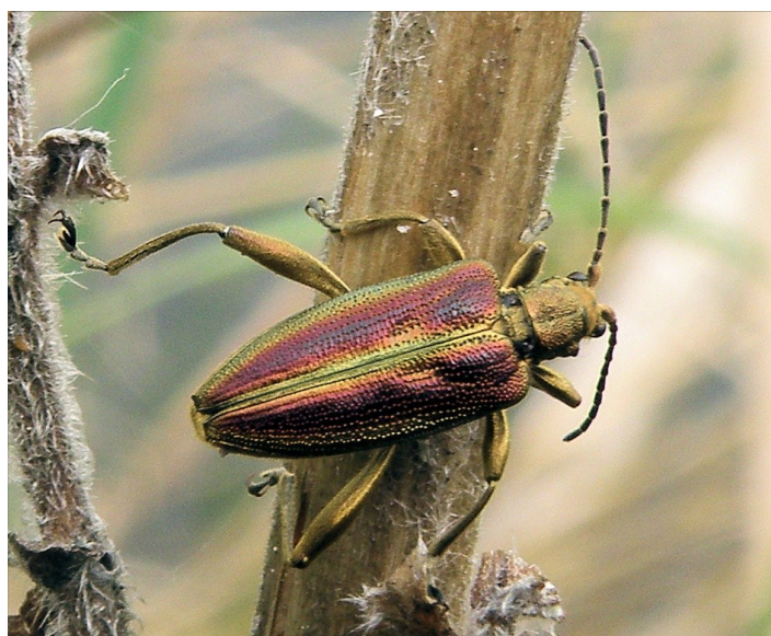
Zircon reed beetle ( Donacia aquatica )

The individual was collected while undertaking Site Condition Monitoring work at Endrick Mouth with Caledonian Conservation Ltd. for Scottish