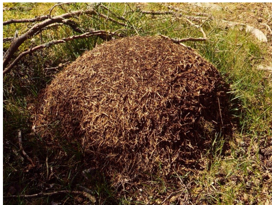
Scottish wood ant ( Formica aquilonia ) nest