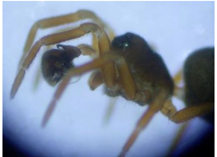
Male Blunt-brow bend-bearing spider ( Silometopus incurvatus ) have distinctive palps