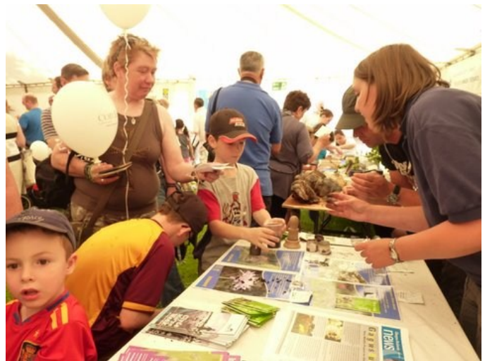
Buglife fun at the 2011 Glasgow Show

Buglife will be attending several public events across Scotland this year. This is an opportunity for volunteers to help us promote invertebrate conservation and learn about the work that