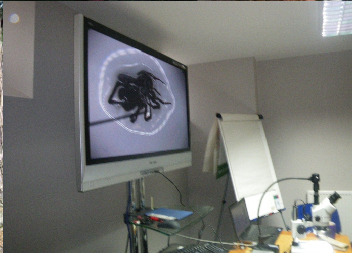
THIS PAGE CLOCKWISE FROM TOP LEFT: Springtail identification session ; Spider identification session ; Spider identification session ; Springtail field session. OPPOSITE PAGE TOP TO BOTTOM: Pseudoscorpion field session ; Moss nipper pseudoscorpion ( Neobisium carinoides) ; Pseudoscorpion identification session

demand, we will also be running a second introduction to beetles workshop in Stirling in May. Both are already fully booked, with the beetle workshop filling-up in just 25 minutes! However, do get in touch as we'd be happy to add you to the reserve lists in case of cancellations.