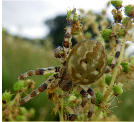
Britain's heaviest spider—the Four-spot orb-weaver ( Araneus quadratus)