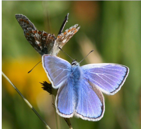
Common blues ( Polyommatus icarus )

Firstly it confirmed that butterflies won't fly in windy, rainy or overcast conditions! On more promising transect days a variety of common species were recorded, including Large white ( Pieris brassicae ), Small White ( Pieris rapae ), Green-veined white ( Pieris napi ), Orange-tip ( Anthocharis cardamines ), Small tortoiseshell ( Aglais urticae ), Peacock ( Inachis io ) and Meadow browns ( Maniola jurtina ). Common blue ( Polyommatus icarus ), which despite their name are not very common in the City, turned up in reasonable numbers on the species-rich grassland in the south of the site. This was very positive as the species has declined in recent years and appears to now be following a national