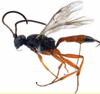
Newly described parasitoid wasp ( Stibeutes blandi )

The publications present new information on the distribution, taxonomy and life history of 153 species of the Ichneumonidae subfamily Cryptinae that were identified following analysis of almost 4,000 specimens from the National Museum of Scotland's collection. 39 of the species identified were new to Britain (many Scottish specimens) and seven of these were new to science. Five of the newly described species were recorded from Scotland ( Tropistes scoticus , Orthizema francescae , Stibeutes blandi , Theroscopus horsfieldi and Theroscopus mariae ). The 5mm long black and orange Stibeutes blandi is currently known from just one specimen collected by Keith Bland at 820m on the Cairnwell in Perthshire.