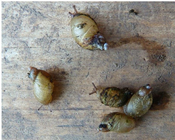
Small amber snail ( Succinella oblonga )

The Small Amber Snail ( Succinella oblonga ) is nationally rare in Britain. Of the handful of known sites, more are in Scotland than in England. A high proportion of records of this species are from