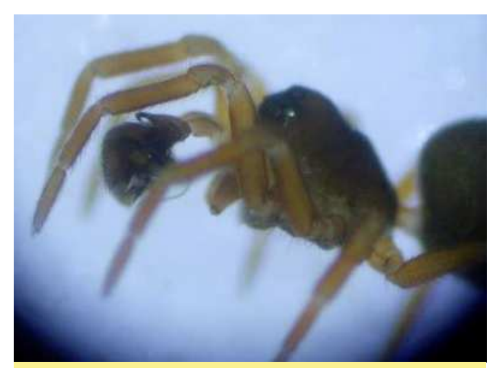
Male Blunt-brow bend-bearing spider ( Silometopus incurvatus ) have distinctive palps