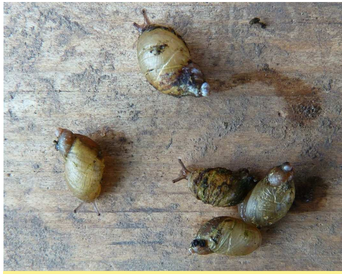
Small amber snail (Succinella oblonga)

The Small Amber Snail ( Succinella oblonga ) is nationally rare in Britain. Of the handful of known sites, more are in Scotland than in England. A high proportion of records of this species are from