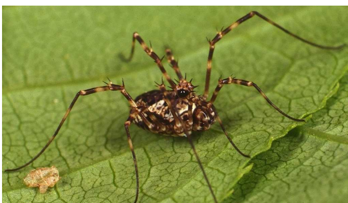
Crowned harvestman ( Megabunus diadema)

For the first time in many years there will be a meeting of Arachnologists in Scotland, to be held at Perth Museum on Saturday 25<sup>th</sup> August 2012.