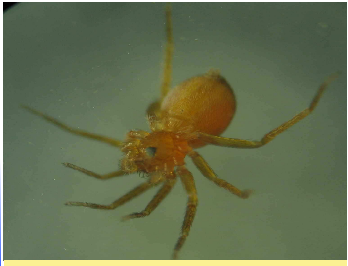
Pink prowler (Oonops domesticus)