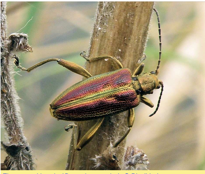
Zircon reed beetle (Donacia aquatica)

The individual was collected while undertaking Site Condition Monitoring work at Endrick Mouth with Caledonian Conservation Ltd. for Scottish