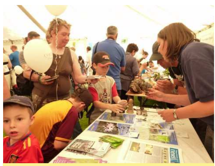
Buglife fun at the 2011 Glasgow Show

Buglife will be attending several public events across Scotland this year. This is an opportunity for volunteers to help us promote invertebrate conservation and learn about the work that