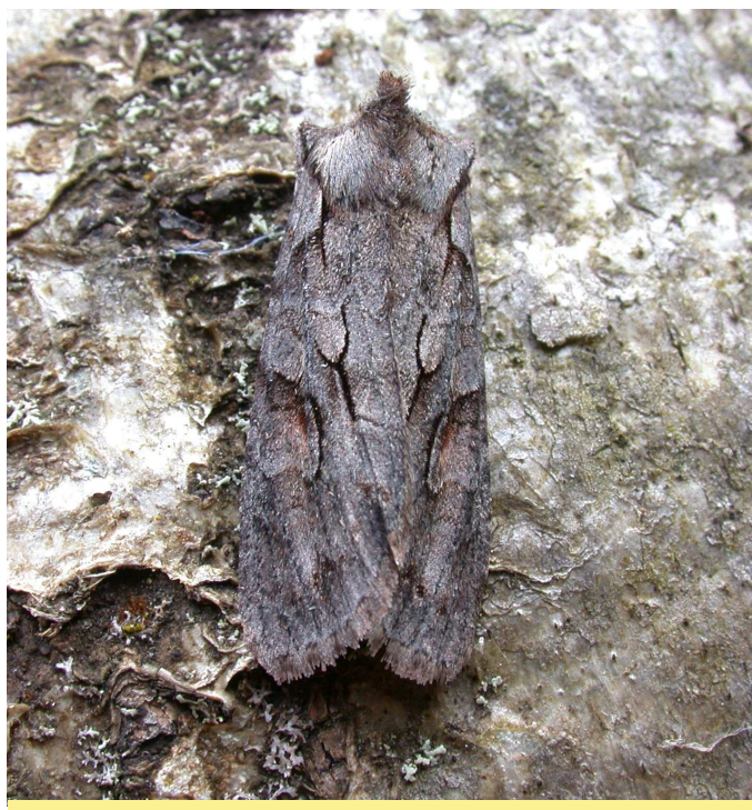
Conformist (Lithophane furcifera)

The Scottish Highlands, in particular Badenoch and Strathspey, is a popular destination for moth enthusiasts who live south of the border due to the presence of several local specialities.