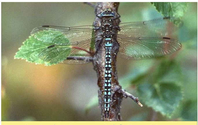
Azure hawker (Aeshna caerulea)

Azure hawker ( Aeshna caerulea ) were found at several sites this year. The small shallow bog pools where they breed had plenty of water after many dried out in the past two years. However, many of the larvae seen were in their first year and they have another two years to survive before emergence. A new breeding site was found and good numbers of adults were seen in new areas in the north.