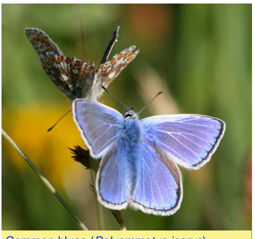
Common blues ( Polyommatus icarus )

including Large white ( Pieris brassicae ), Small White ( Pieris rapae ), Green-veined white ( Pieris napi ), Orange-tip ( Anthocharis cardamines ), Small tortoiseshell ( Aglais urticae ), Peacock ( Inachis io ) and Meadow browns ( Maniola jurtina ). Common blue ( Polyommatus icarus ), which despite their name are not very common in the City, turned up in reasonable numbers on the species-rich grassland in the south of the site. This was very positive as the species has declined in recent years and appears to now be following a national