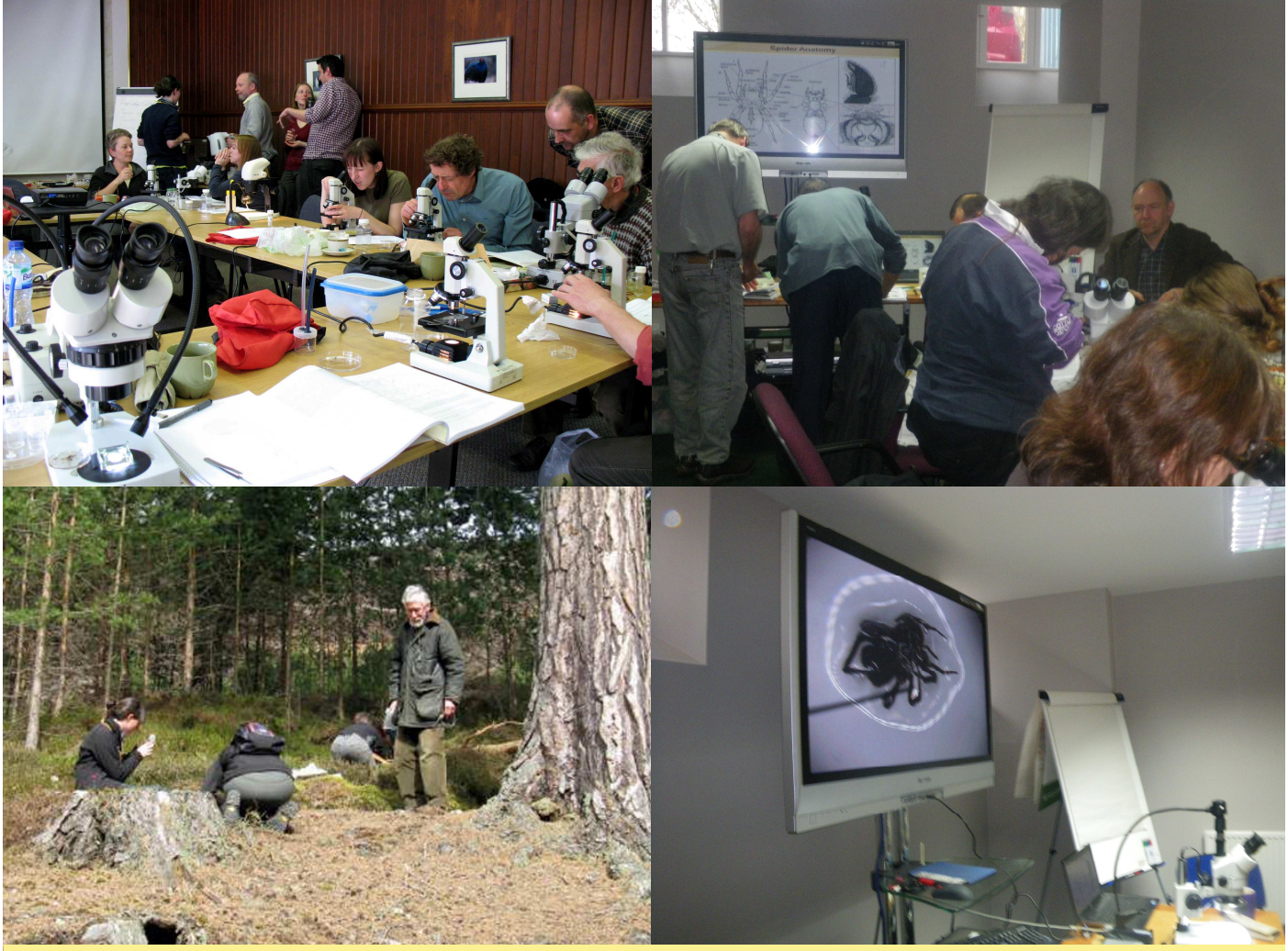
THIS PAGE CLOCKWISE FROM TOP LEFT: Springtail identification session ; Spider identification session ; Springtail field session. OPPOSITE PAGE TOP TO BOTTOM: Pseudoscorpion field session ; Moss nipper pseudoscorpion ( Neobisium carcinoides) ; Pseudoscorpion identification session

demand, we will also be running a second introduction to beetles workshop in Stirling in May. Both are already fully booked, with the beetle workshop filling-up in just 25 minutes! However, do get in touch as we'd be happy to add you to the reserve lists in case of cancellations.