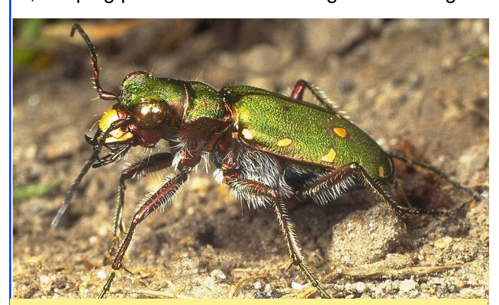
Green tiger beetle (Cicindela campestris)

This year we will be back at Roughcastle with more habitat creation and management across the site. We will be creating a bee bank, planting 3,000 plug plants and also clearing and thinning