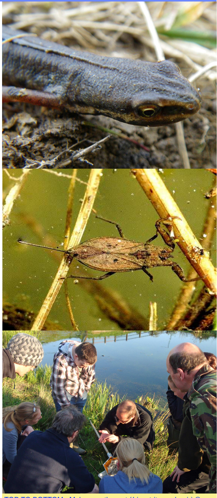
TOP TO BOTTOM: Male smooth newt ( Lissotriton vulgaris) ; Water scorpion ( Nepa cinerea) ; Workshop field session

For more information about Amphibian & Reptiles Groups of the UK, go to <a href="https://www.arguk.org">www.arguk.org</a>