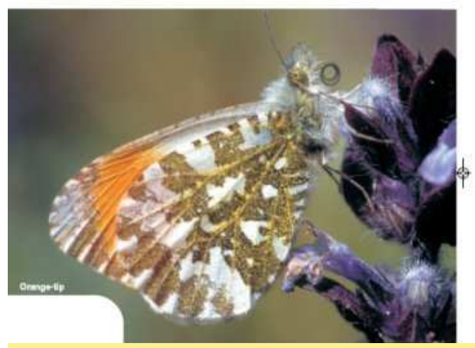
New Butterfly and day-flying moths of Glasgow leaflet

The very popular 'Butterflies and day-flying moths of Glasgow' leaflet has been reprinted with a few important changes to bring it up to date.