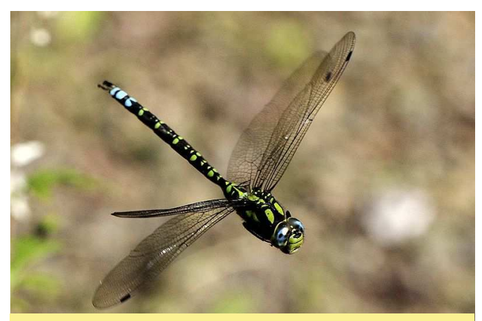
Southern hawker (Aeshna cyanea)

The species that are only found in Scotland within the UK also fared well in 2011. Larvae of the