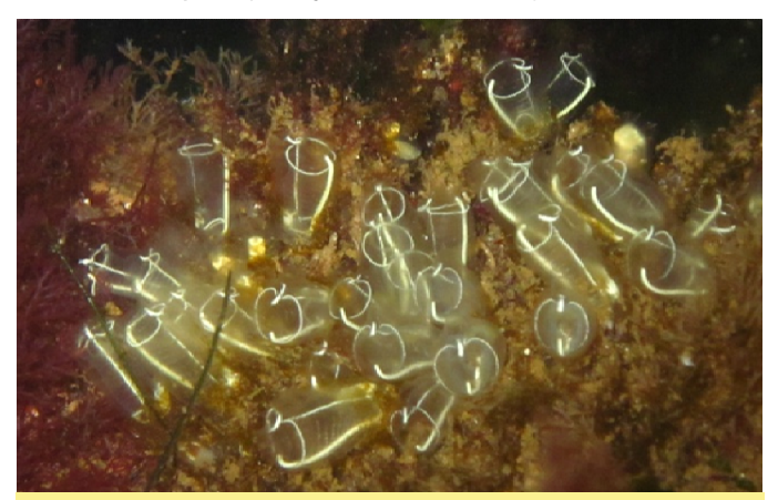
Lightbulb sea squirt ( Neomenia carinata )

Other sea squirts that can be found in Scottish waters include the Red sea squirt ( Ascidia mentula ), Gas mantle sea squirt ( Corella parallelogramma ), Fluted sea squirt ( Ascidiella aspersa ), the Gooseberry or 'Baked bean' sea squirt ( Dendrodoa grossularia ) and the beautiful Star sea squirt ( Botryllus schlosseri ).