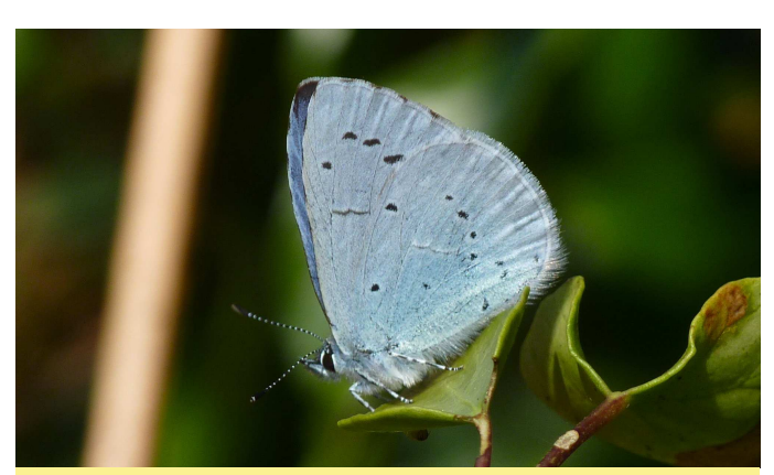
Holly blue (Celastrina argiolas) A species spreading through central Scotland

The leaflet can be obtained from Butterfly Conservation Tel: 01786 447753 or e-mail: Scotland@butterfly-conservation.org or from Glasgow City Council Tel: 0141 287 5665/7026 or e-mail: carol.maclean@glasgow.gov.uk