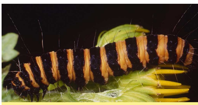
Cinnabar moth caterpillar ( Tyria jacobaeae )

and under, aged 13-17 and over 17 years. Only one insect photograph per person is allowed and the photograph must be taken within the British Isles during 2012. The entrant must be the person who took the photograph and owns the copyright. Photographs must be submitted by e-mail to