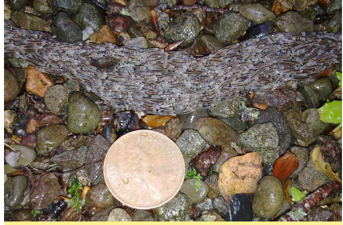
'Army' of Dark-winged fungus gnat larvae (Sciara militaris)

A chance mention of a local phenomenom to a council employee resulted in the discovery of a mysterious occurrence in Leadhills, South Lanarkshire being reported to the local Ranger Service. It looks eerie from a distance – like a very slowly moving snake skin! Up close these long, thin columns are actually made up of hundreds of tiny grey larvae known as "army