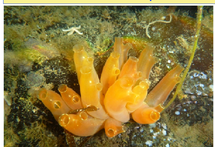
Yellow-ringed sea squirt ( Ciona intestinalis )

Sea squirts or tunicates are a group of marine filter -feeding sac-like invertebrates with two siphons (one incurrent and one excurrent). Despite the simple appearance of the adults, they are in fact closely related to vertebrates with a free-swimming larval stage that has a tail and primitive spinal chord called a notochord. Sea squirts are members of the subphylum Tunicata within the phylum Chordata, which contains all vertebrates and as well as the Lancelet (subphylum Cephalochordata) which was mentioned in the last edition of Scottish Invertebrate News, Volume 2, Issue 2.